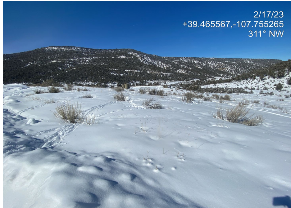
Photo 3. Photos show examples of interim areas. Introduced perennial grasses and native shrubs appear established.