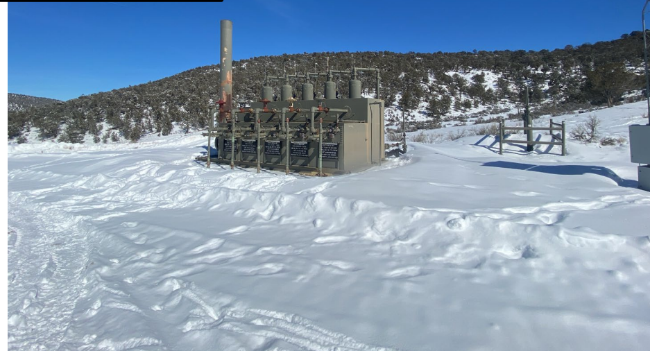
Photo 2. Photos show production areas. A tank battery sign is absent (left).