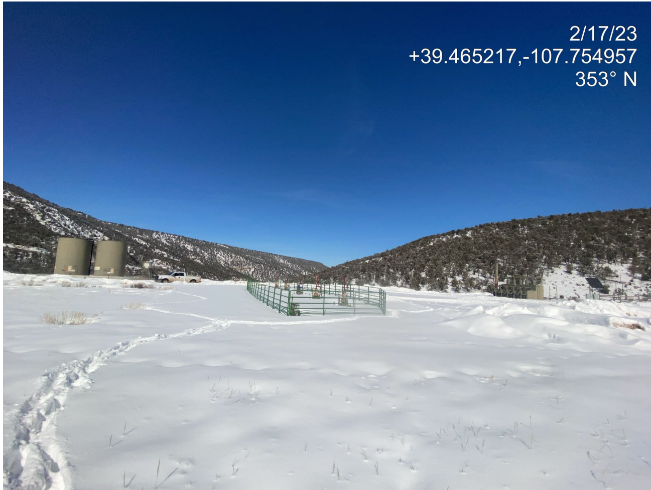
Photo 1. Photo taken from the south shows an overview of the location.