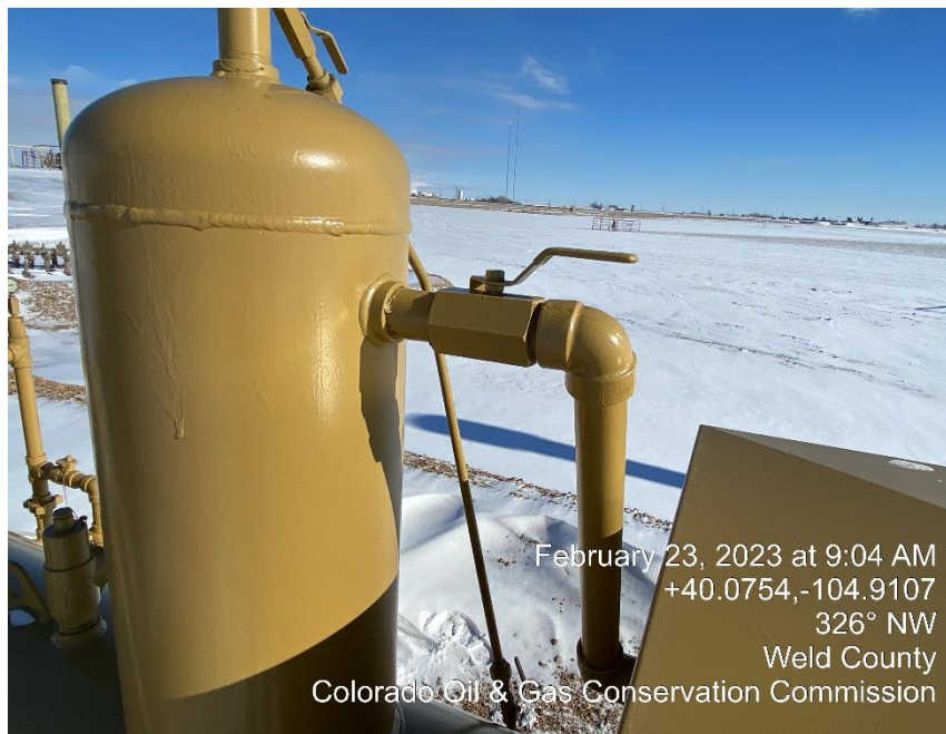
Photo #11 Ball valve appears to be open on the top side of the separator