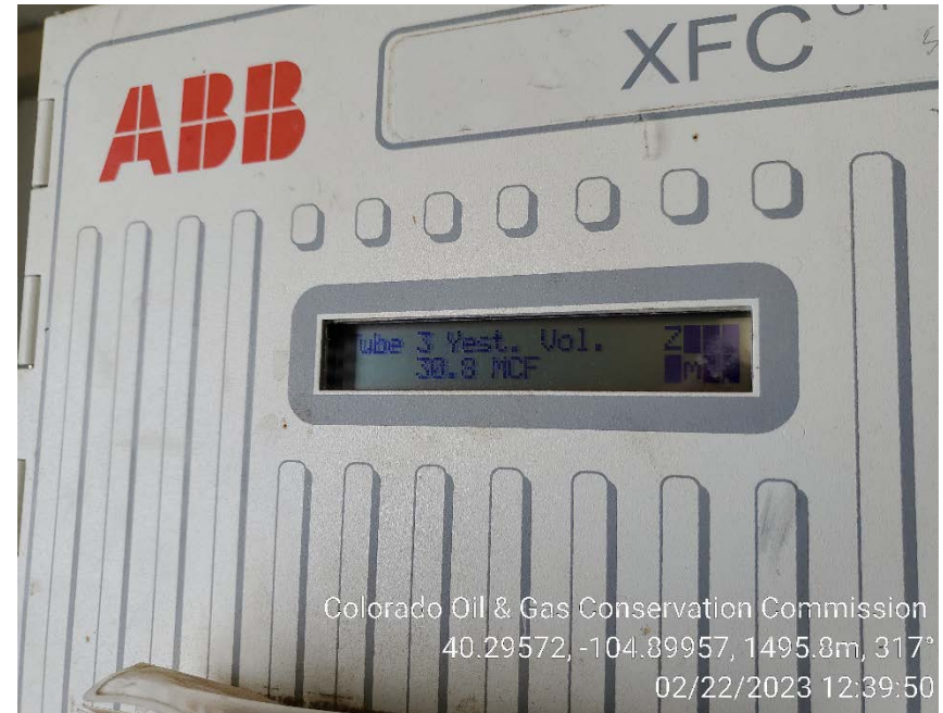
Previous day product sold volume