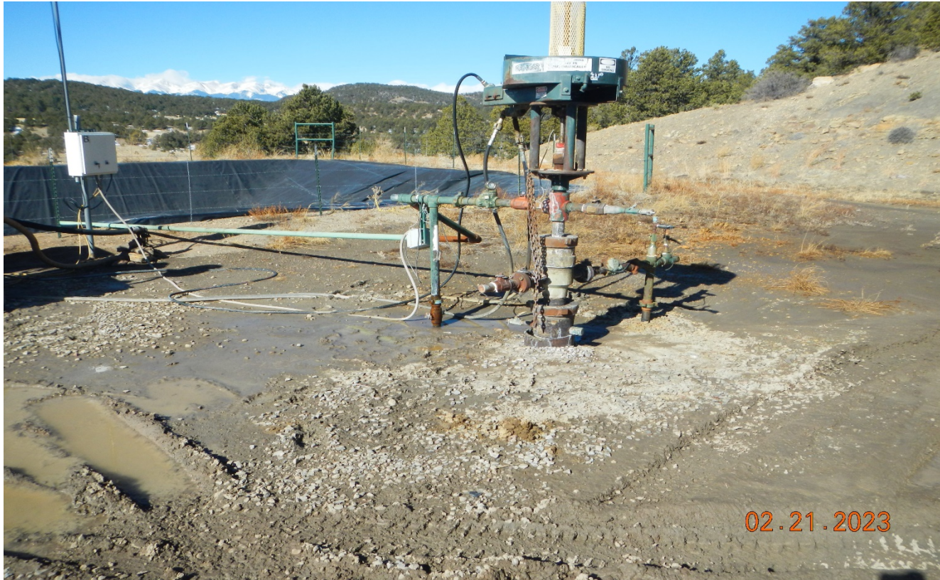
Photo 2. Facing toward the wellhead. There was a water leak that had occurred which is the reason for the wet soils in this area.