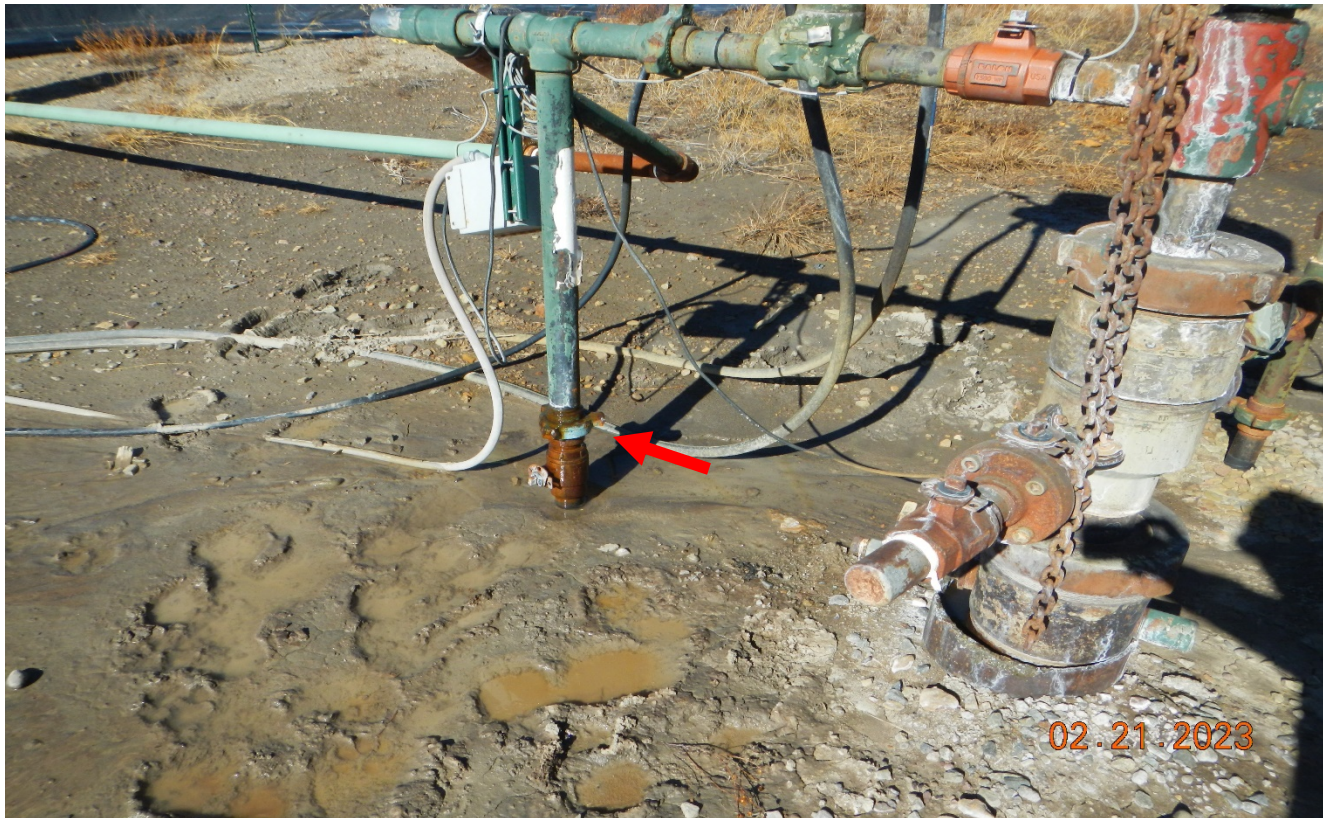
Photo 3. There is still a dripping water leak coming from this pipe joint.