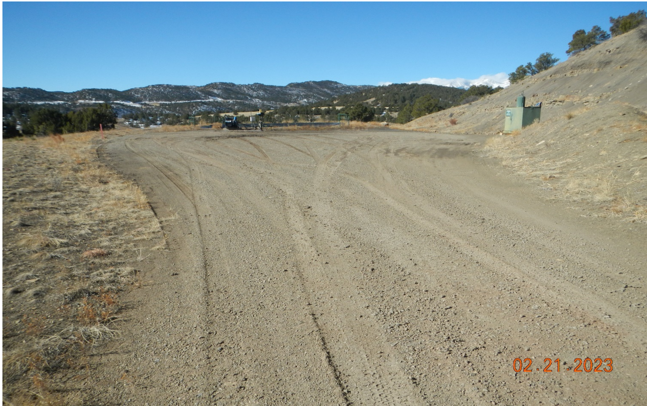
Photo 1. Facing southwest toward the location.