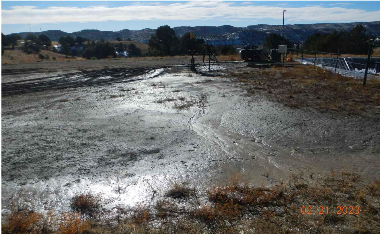
Photo 7. Facing southeast toward the wellsite. There are signs that produced water flowed off northwest side of the location.