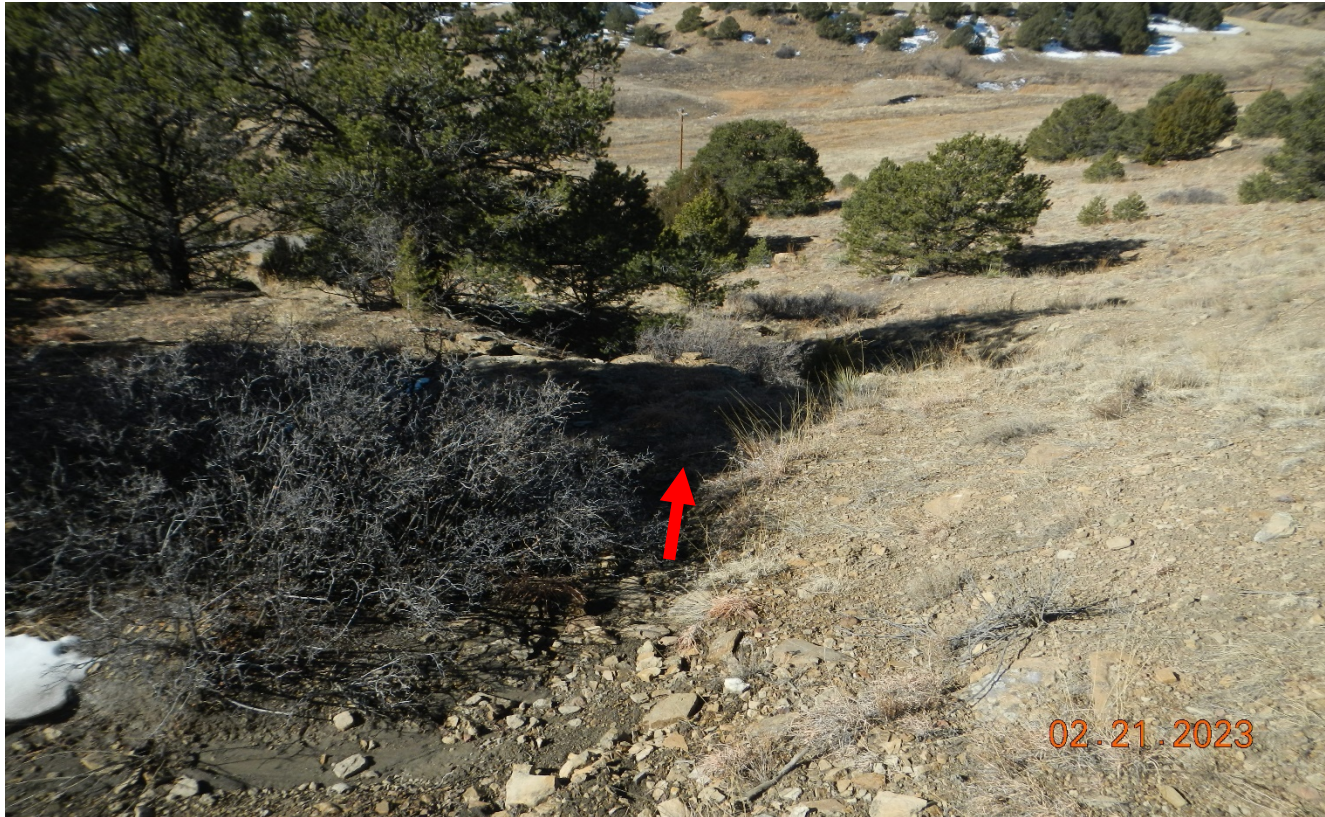
Photo 9. There are signs that produced water flowed off the northwest side of the location down toward CR 31.9.