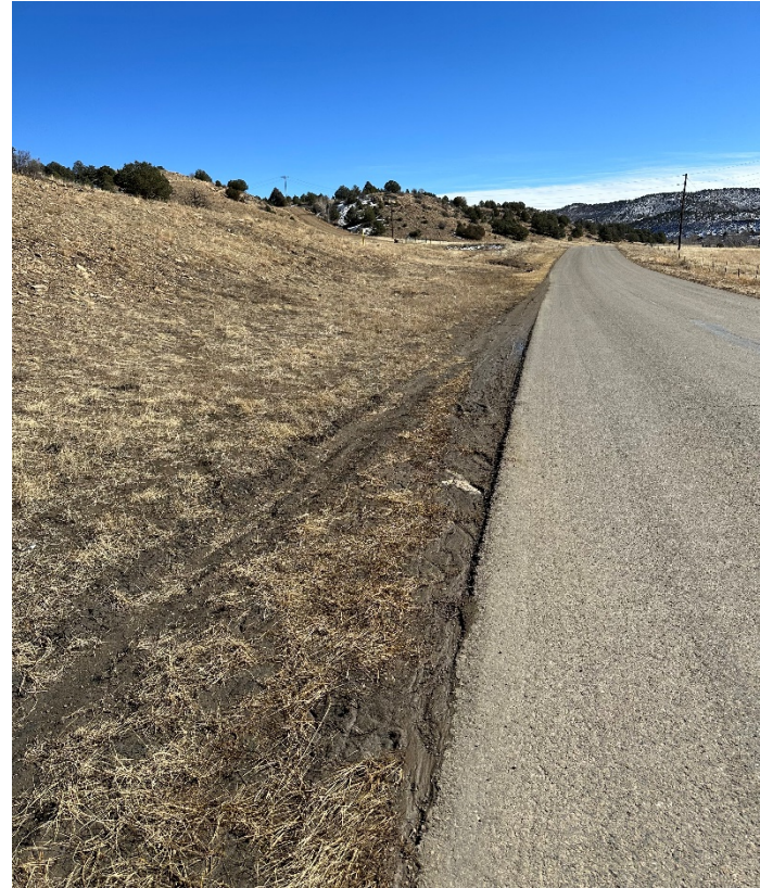
Photo 13. Facing northeast along CR 31.9 showing wet soils along the road.