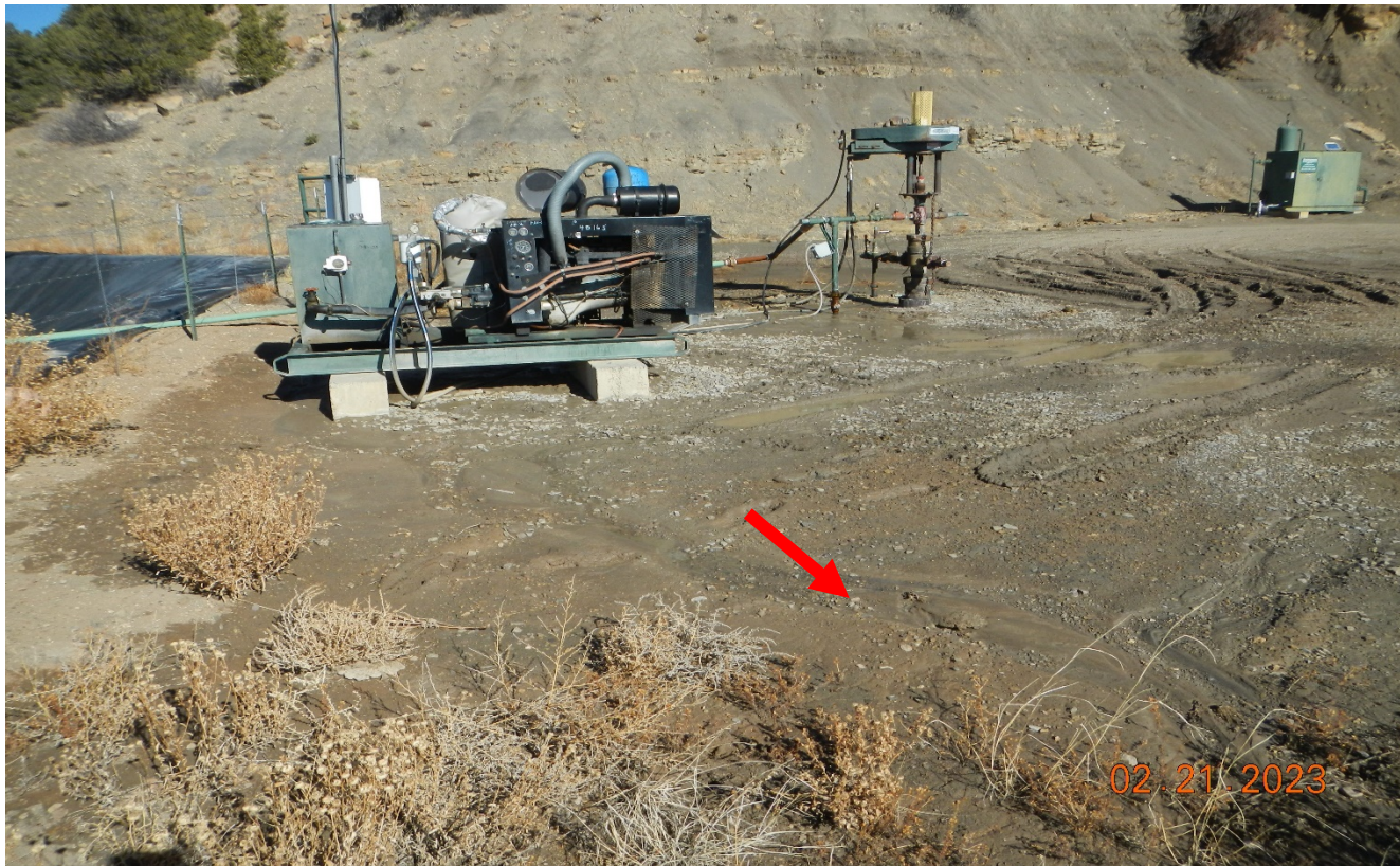
Photo 4. There are signs that produced water flowed off the southwest side of the location down toward CR 31.9.