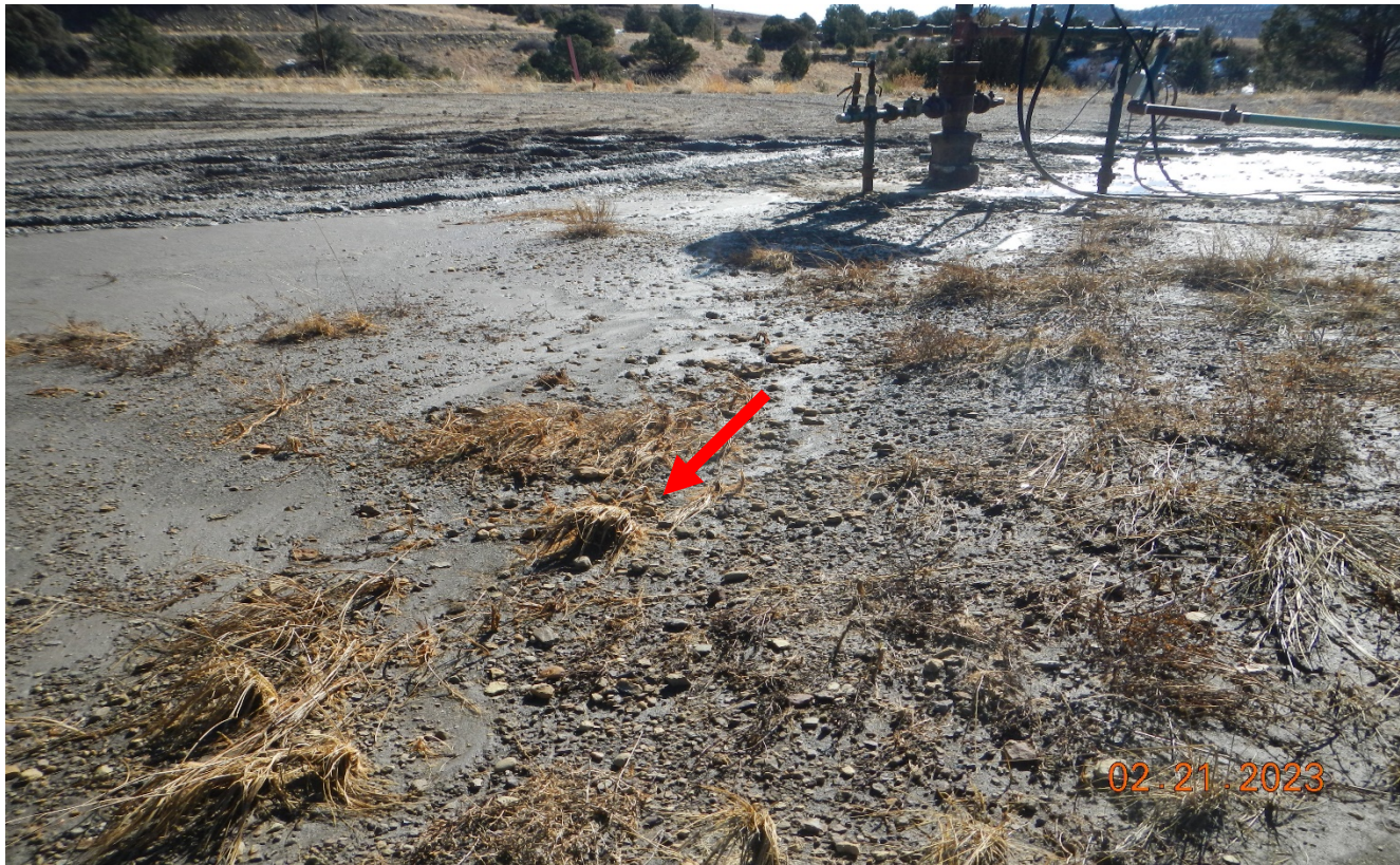
Photo 6. Facing southeast toward the wellsite. . There are signs that produced water flowed off northwest side of the location. The flow pattern laid the vegetation over in the direction of the water flow..