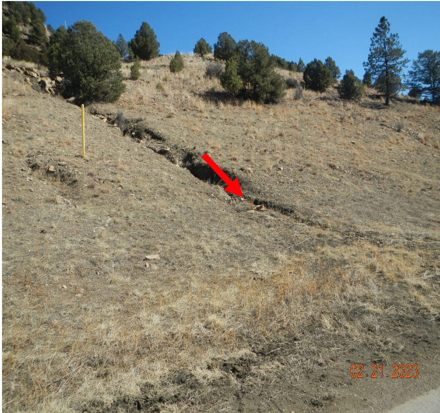
Photo 10. This is the point along the county road where produced water flowed from the northwest corner of the wellsite.