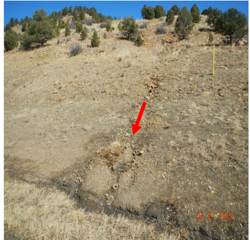
Photo 11. This is the point along the county road where produced water flowed from the southwest corner of the wellsite.