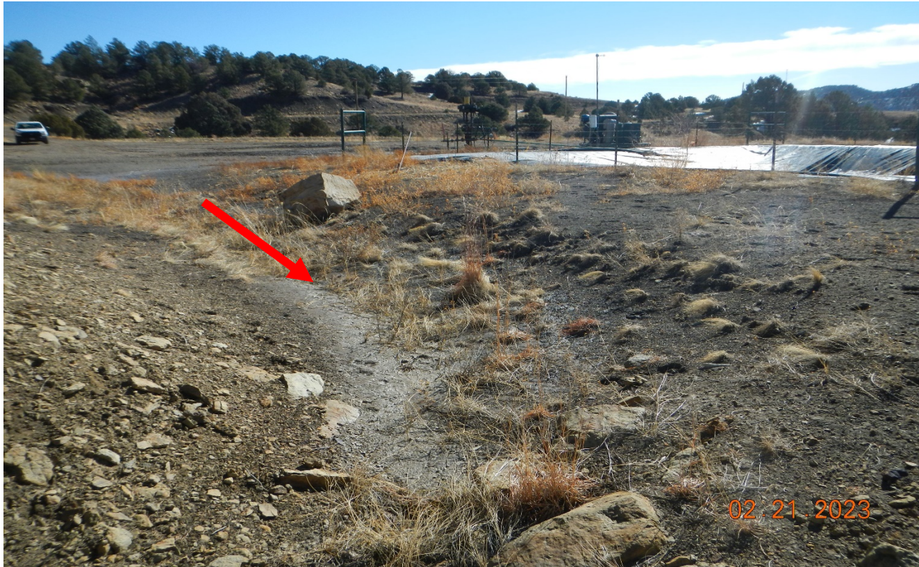
Photo 8. There are signs that produced water flowed off northwest side of the location.