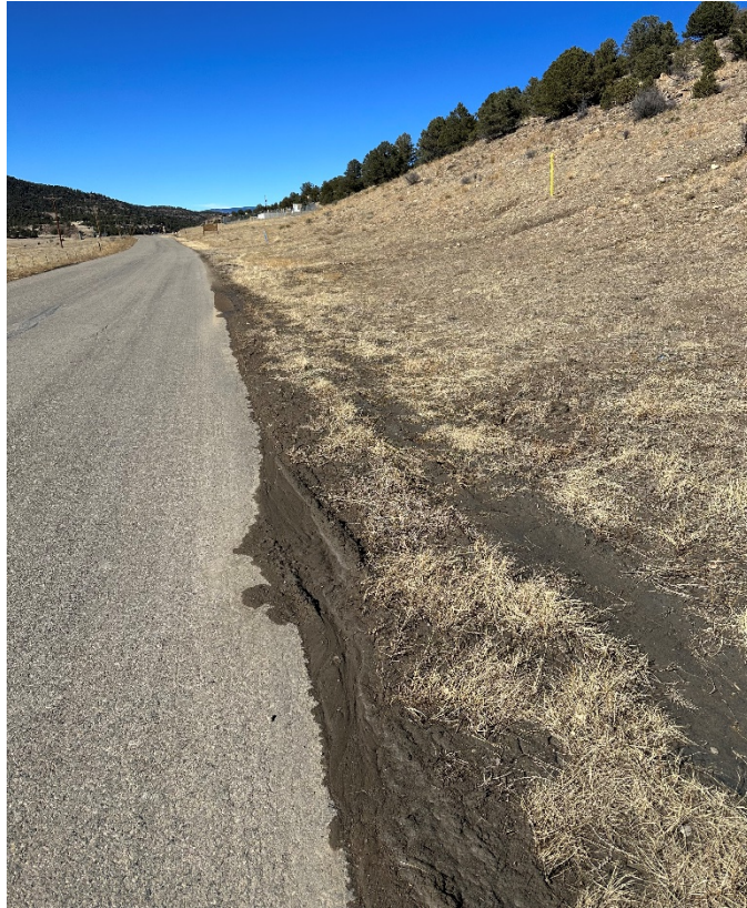
Photo 12. Facing northeast along CR 31.9 showing wet soils along the road.