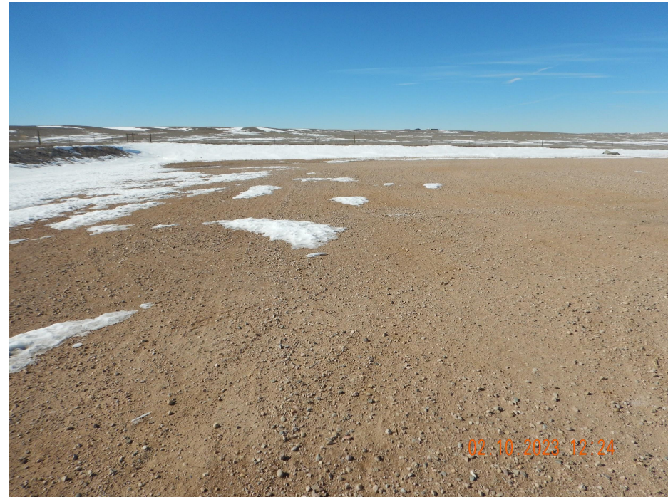
Photo 5. Photo taken from the southern location, facing West. See comments under Photo 4.