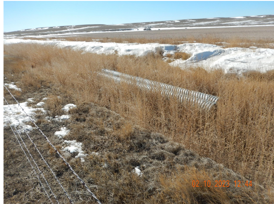
Photo 17. Photo taken from the eastern location, facing Southwest. Photo illustrates the weedy vegetation within the BMP area, as well as unused equipment.