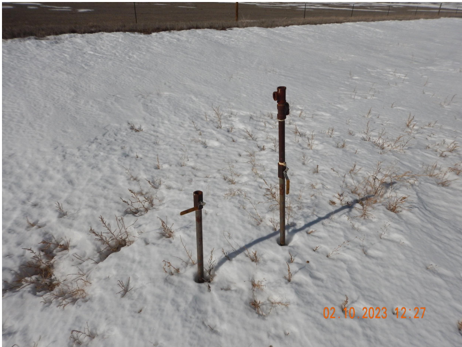
Photo 8. Photo taken from the western location, facing Northwest. Photo illustrates unused risers and this is considered unused equipment.