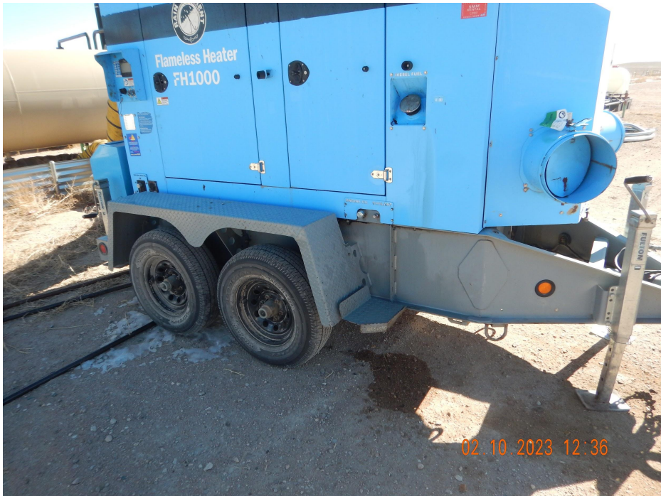
Photo 14. Photo taken from the eastern location. Photo illustrates poor housekeeping, as diesel fuel has spilled onto the ground. Operator will be required to have secondary containment for materials handling and spill prevention practices.