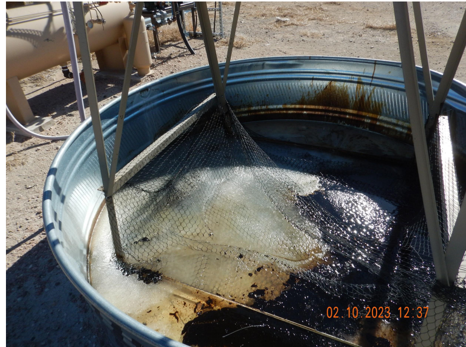
Photo 15. Photo taken from the eastern location. Photo illustrates netting is in disrepair. Remove and properly dispose fluids from within the secondary containment.