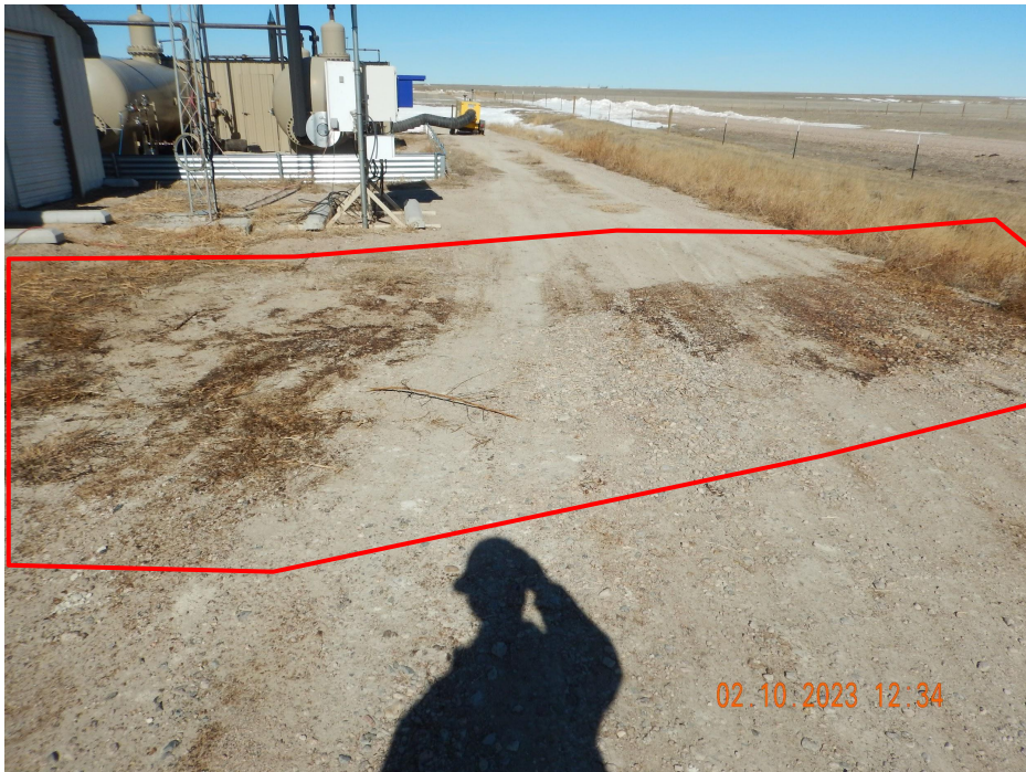
Photo 12. Photo taken from the eastern location, facing North. Photo illustrates a spill of what appears to be non-E&P exempt waste from a Mobil Pegasus SAE 40 container. This will need to be reported to CDPHE and this appears to be a violation of Rule 906.