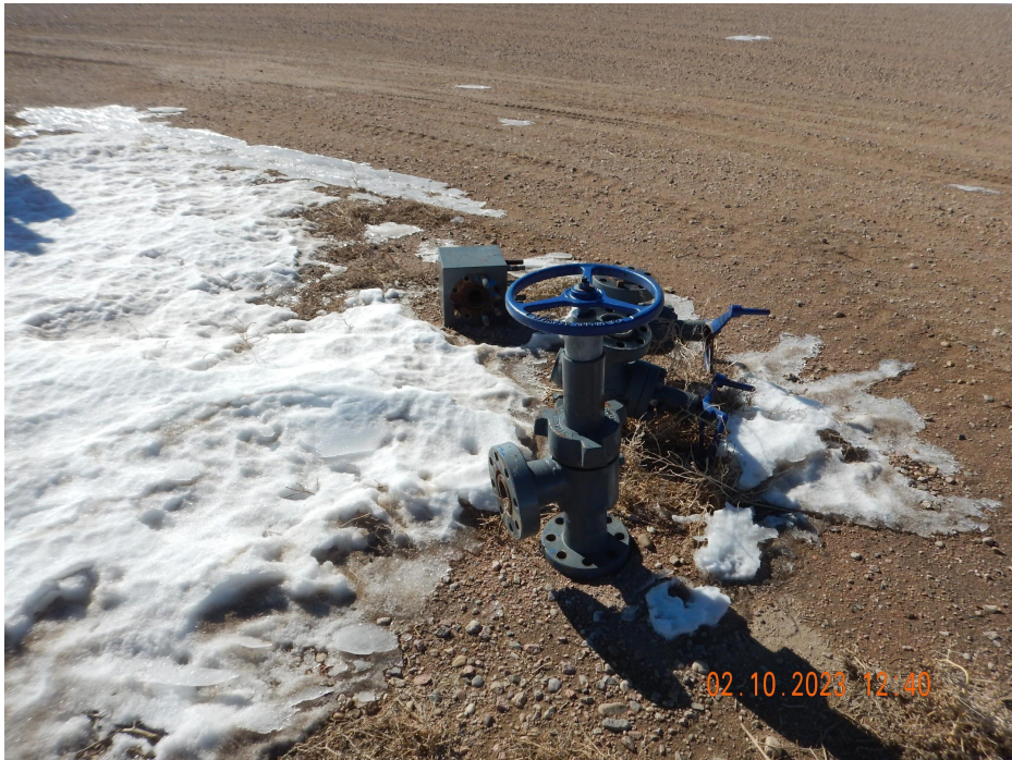
Photo 18. Photo taken from the wellheads. Photo illustrates unused equipment.