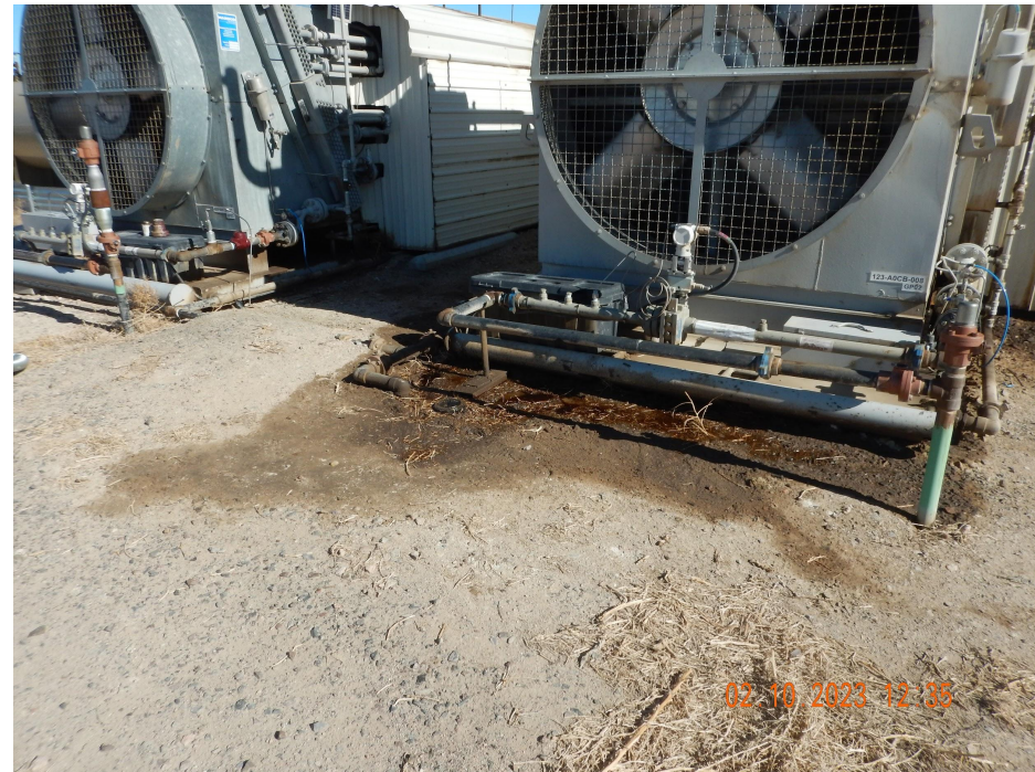
Photo 13. Photo taken from the eastern location, facing East. Photo illustrates stained soil/spill related to the compressor.