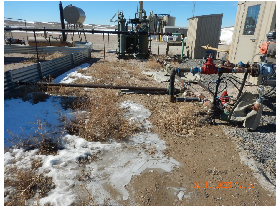
Photo 11. Photo taken from the northeastern location, facing West. Photo illustrates weed debris and weedy vegetation around production equipment.