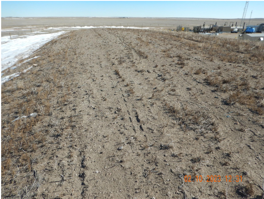
Photo 10. Photo taken from the northern location, facing East. Photo illustrates the topsoil stockpile which is primarily bare or has weedy, annual vegetation with minimal perennial vegetation that would not met the standard.