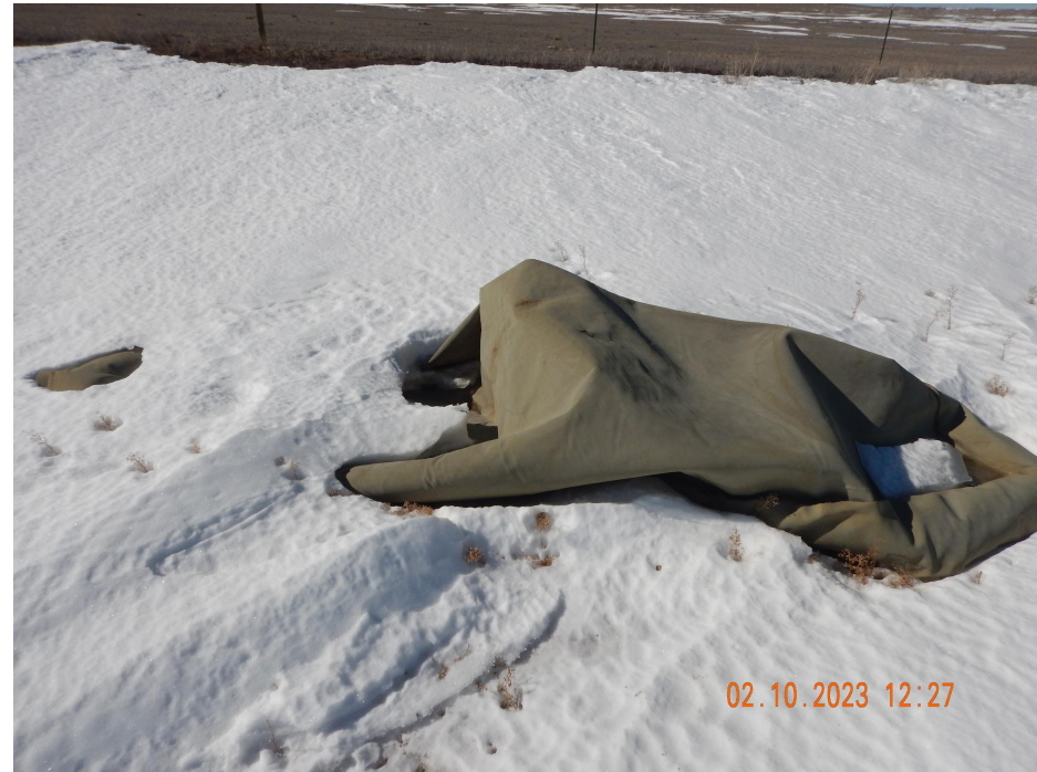
Photo 7. Photo taken from the western location, facing West. Photo illustrates a potential tarp that was not secured and is not considered trash/debris.