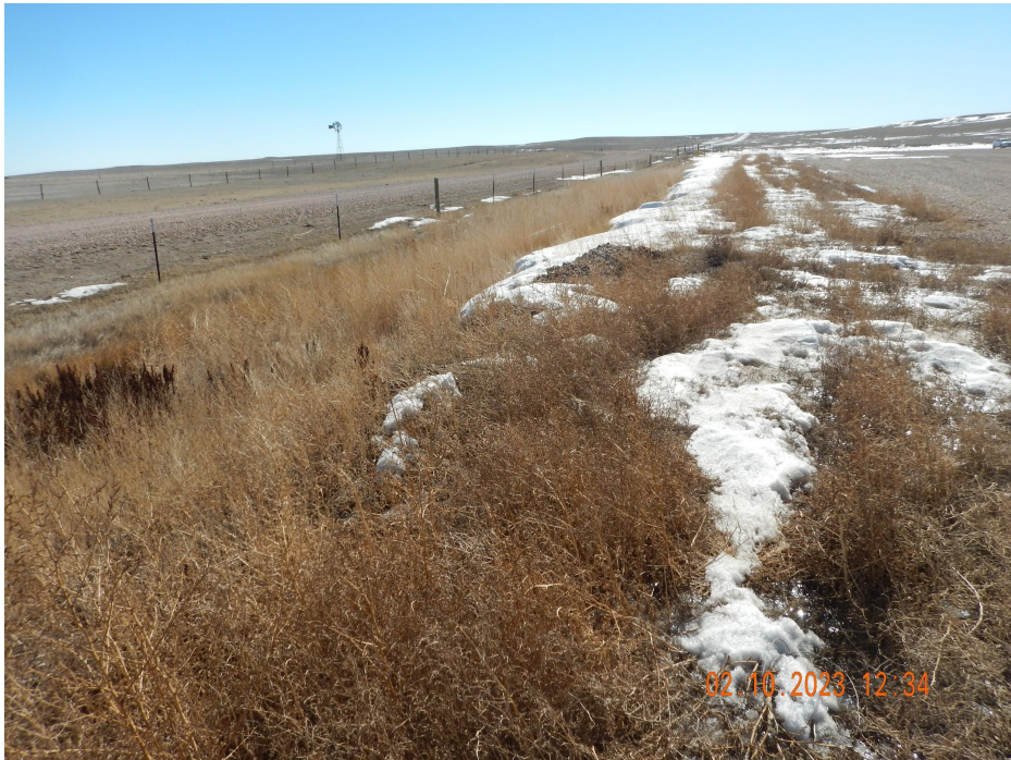
Photo 16. Photo taken from the eastern location, facing South. Photo illustrates unmanaged, weedy vegetation along the eastern well pad and the BMP area.