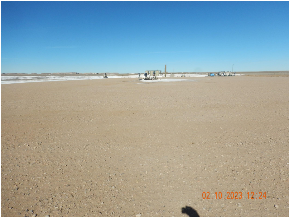
Photo 4. Photo taken from the southern location, facing North. Photo illustrates interim reclamation has not been performed.