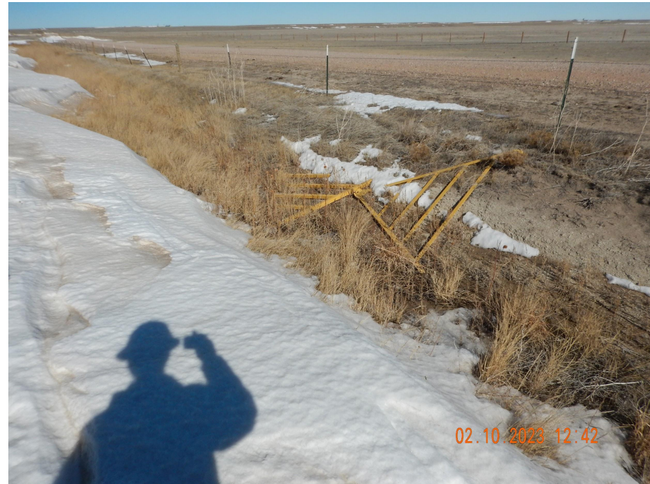
Photo 19. Photo taken from the southeastern location, facing Northeast. Photo illustrates unused equipment within the BMP area.