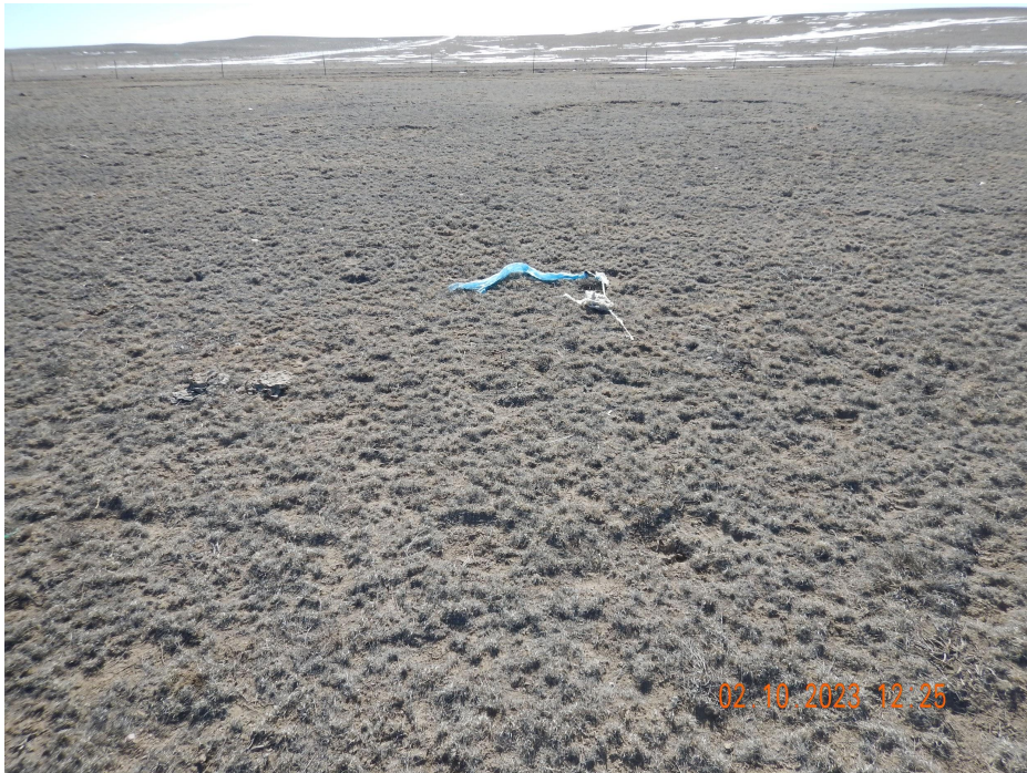
Photo 6. Photo taken from the southern location, facing South. Photo illustrates trash has blown off location.