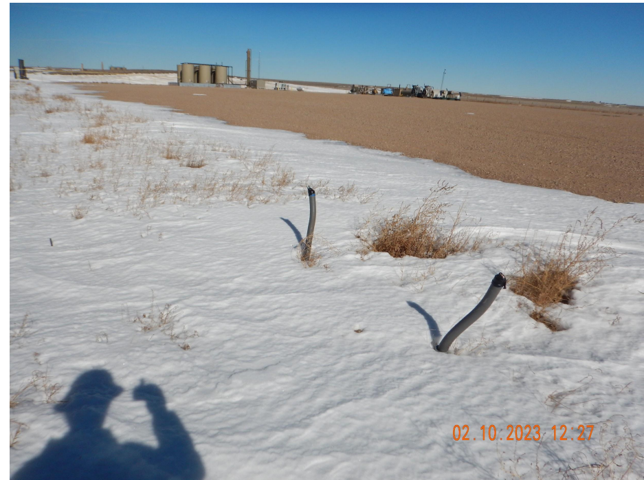
Photo 9. Photo taken from the western location, facing Northeast. Photo illustrates electrical power sources related to the risers; this is considered unused equipment.