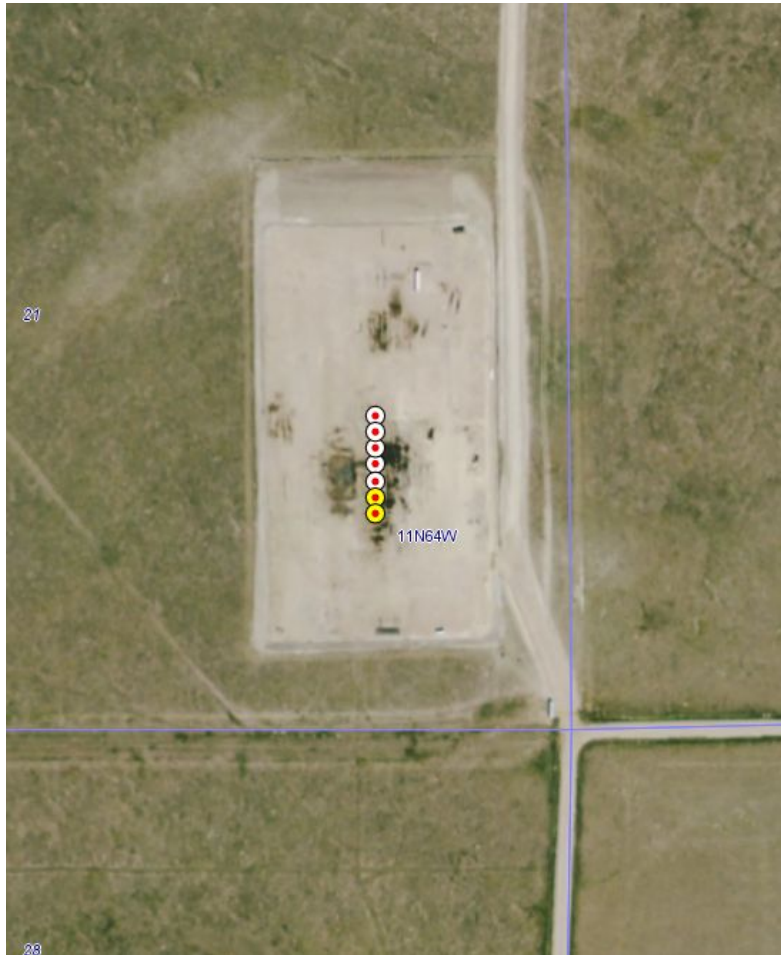
Photo 2. COGCC GISOnline aerial imagery from 2019 illustrates the location. At the time of this inspection, the location remains the same size and interim reclamation has not been performed- refer to Photos 4-5.