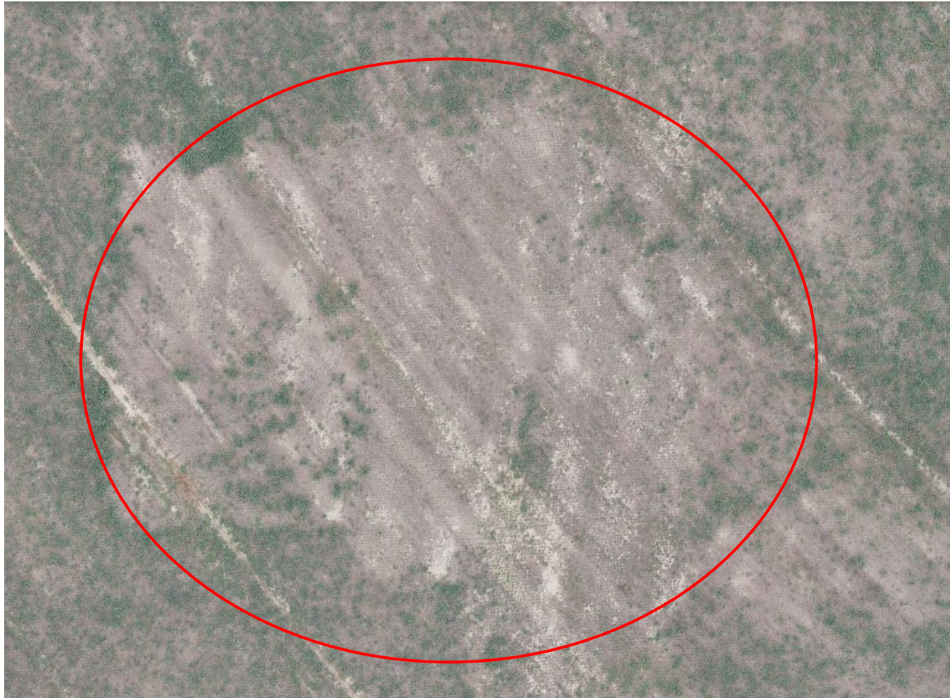
Photo 4. Zoomed in Orthomosaic taken from 200 ft (Oct. 2022). Illustrates harvested crop on and around the well location (red circle). Bare dirt and sparse crop growth.