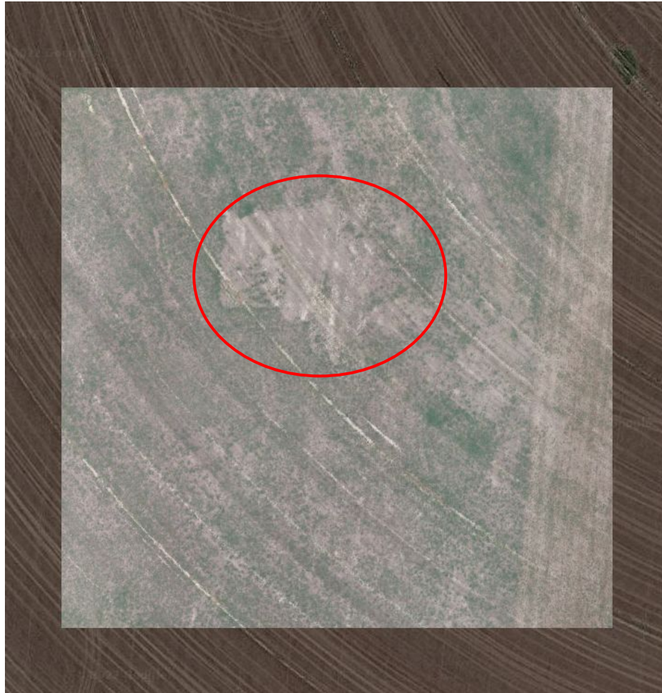
Photo 3. Orthomosaic drone aerial imagery taken from 200 ft (Oct. 2022). Illustrates harvested crop on and around the well location (red circle).