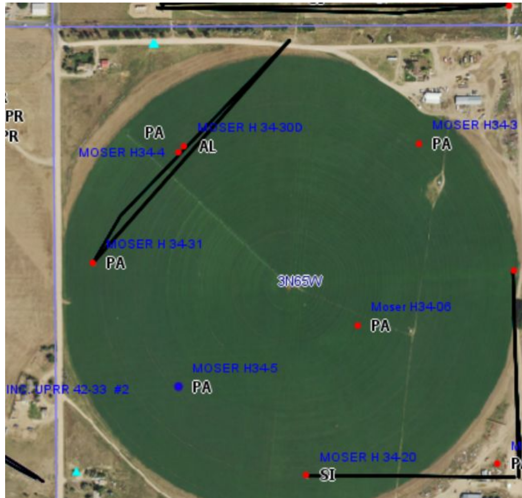
Photo 2. COGCC Online Map aerial imagery 2019 with subject well (blue dot) and related wells (red dots).