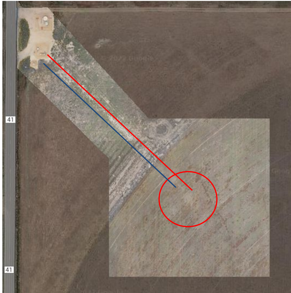
Photo 3. Orthomosaic drone aerial imagery taken from 200 ft (Oct. 2022). Illustrates rangeland on and around the well location (red circle), flowline (red line), and access road (above blue line). Tank battery is still has equipment remaining. Access road is still visible.