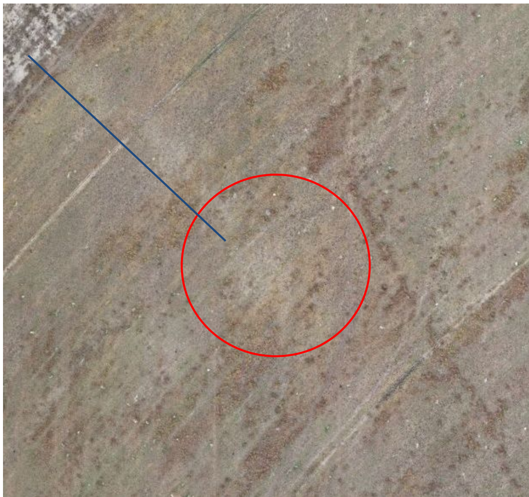
Photo 4. Zoomed in Orthomosaic taken from 200 ft (Oct. 2022). Illustrates rangeland growth on and around the well location (red circle) that is comparable to surrounding area. Access road (blue line) is barely visible in an agricultural field.