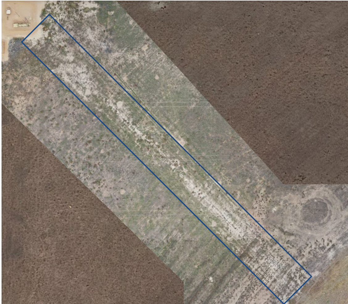
Photo 6. Zoomed in Orthomosaic taken from 200 ft (Oct. 2022). Illustrates lack of full rangeland growth on and around the access road (blue line).