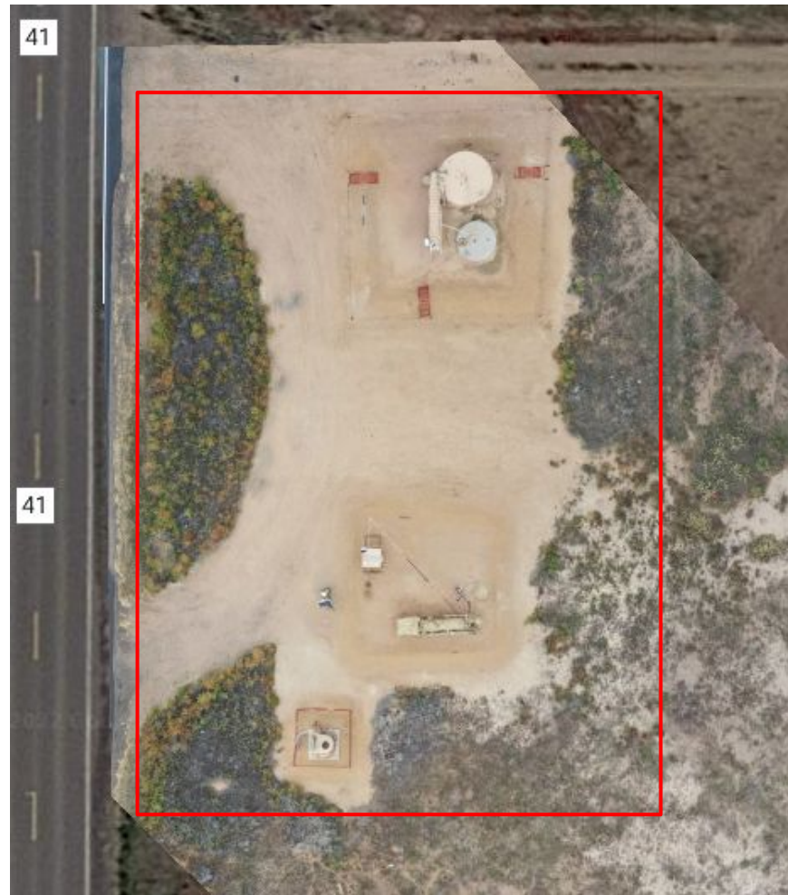
Photo 5. Zoomed in Orthomosaic taken from 200 ft (Oct. 2022). Illustrates equipment remaining on tank battery (red rectangle).