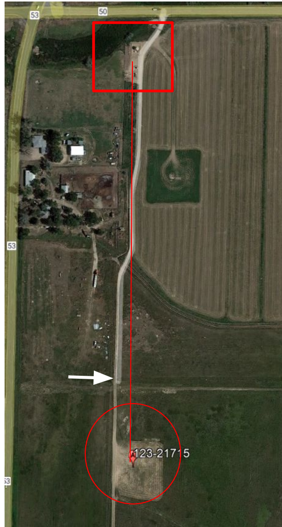
Photo 1. Google Earth aerial imagery taken 7/2019 during active operations. Photo illustrates the well location (red circle), tank battery (red rectangle), access road (white arrow), and approximate flowlines (red line).