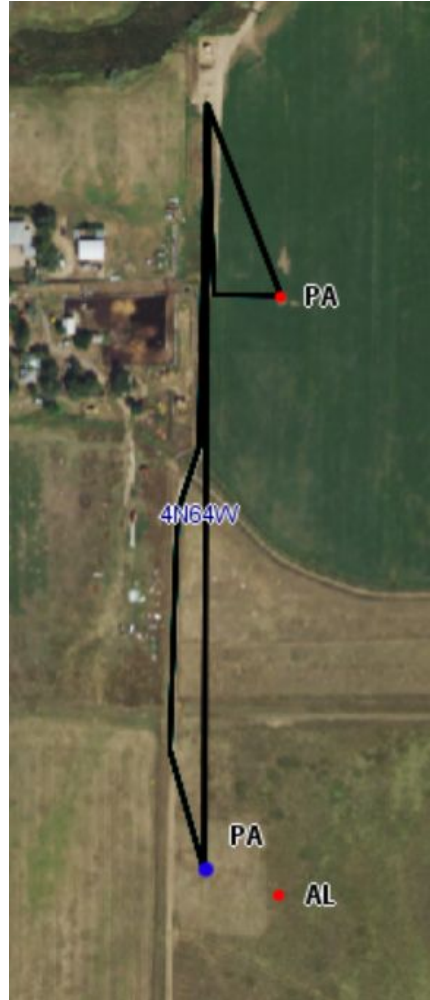
Photo 2. COGCC Online Map aerial imagery 2019 with subject well (blue dot), related wells (red dots), tank battery (north center) and flowlines (black lines). Flowline abandonment form has not been submitted.