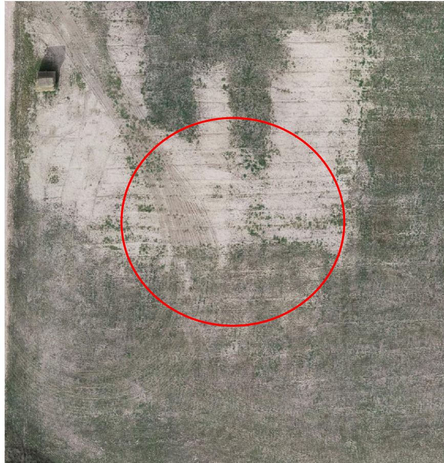
Photo 4. Zoomed in Orthomosaic drone aerial imagery taken from 200 ft (Sept. 2022). Illustrates lack of growth on and around the well location (red circle). Appears to have bare soil. Appears similar to rest of area, however crop height cannot be fully evaluated. Another inspection is required when crop is actively growing.