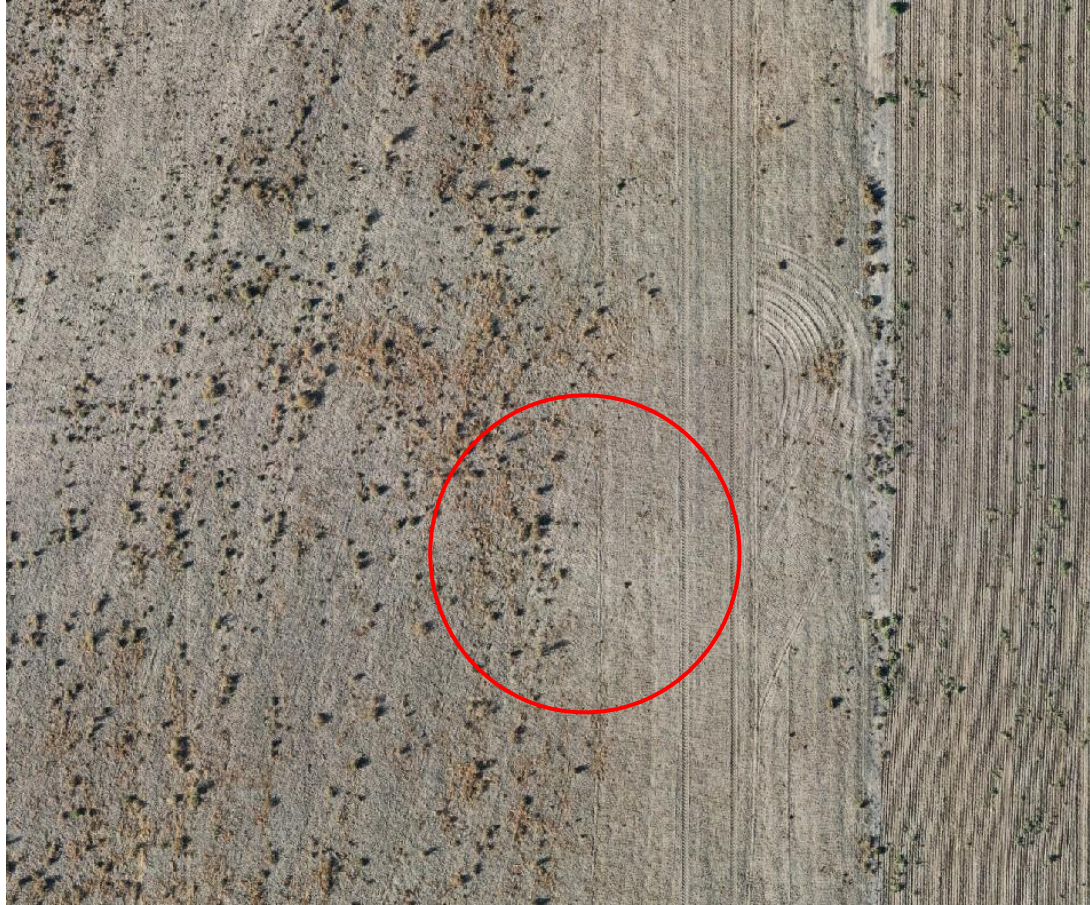
Photo 4. Zoomed in Orthomosaic drone aerial imagery taken from 200 ft (Sept. 2022). Illustrates growth on and around the well location (red circle). Appears similar to rest of area, however crop height cannot be fully evaluated. Another inspection is required when crop is actively growing.

Inspection Photos Location Name: LDS D *17-20 Location ID: 330145