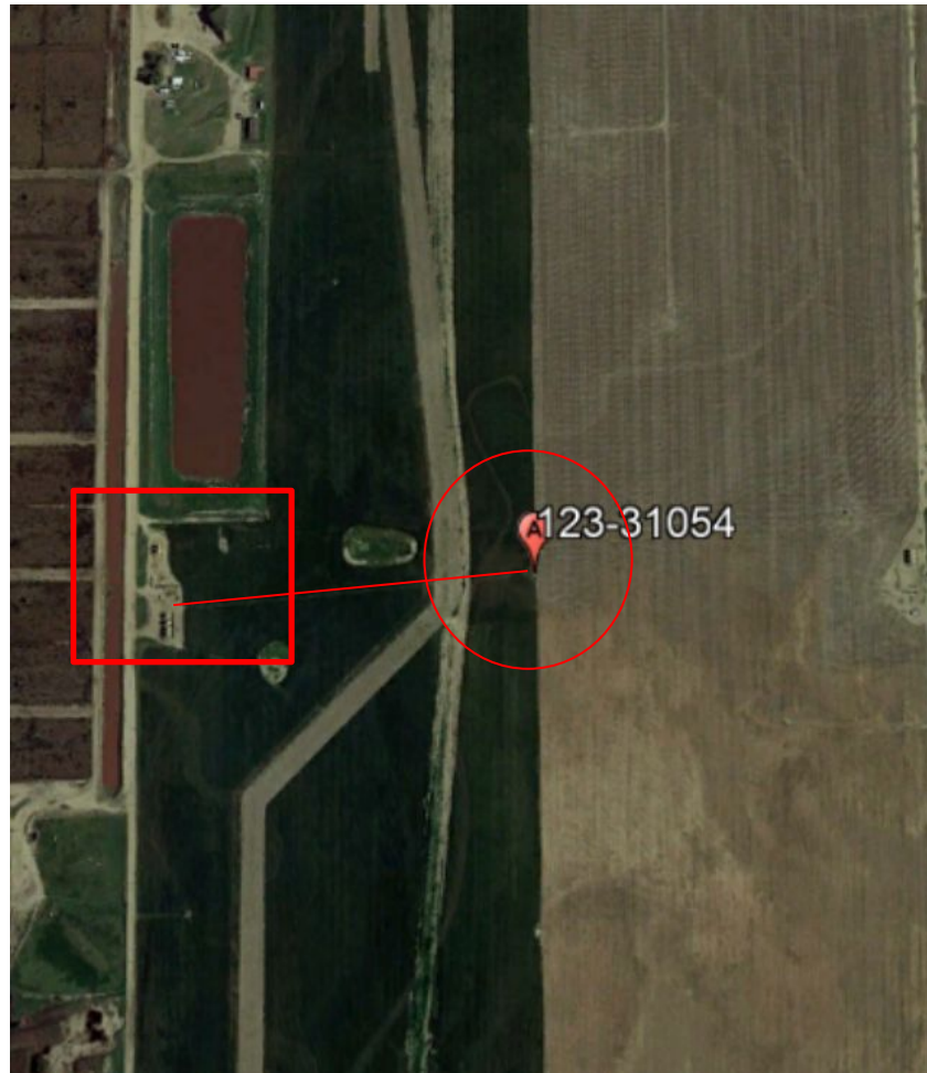
Photo 1. Google Earth aerial imagery taken 8/2018 during active operations. Photo illustrates the well location (red circle), tank battery (red rectangle), and approximate flowlines (red line).

Inspection Photos Location Name: LDS D *17-20 Location ID: 330145