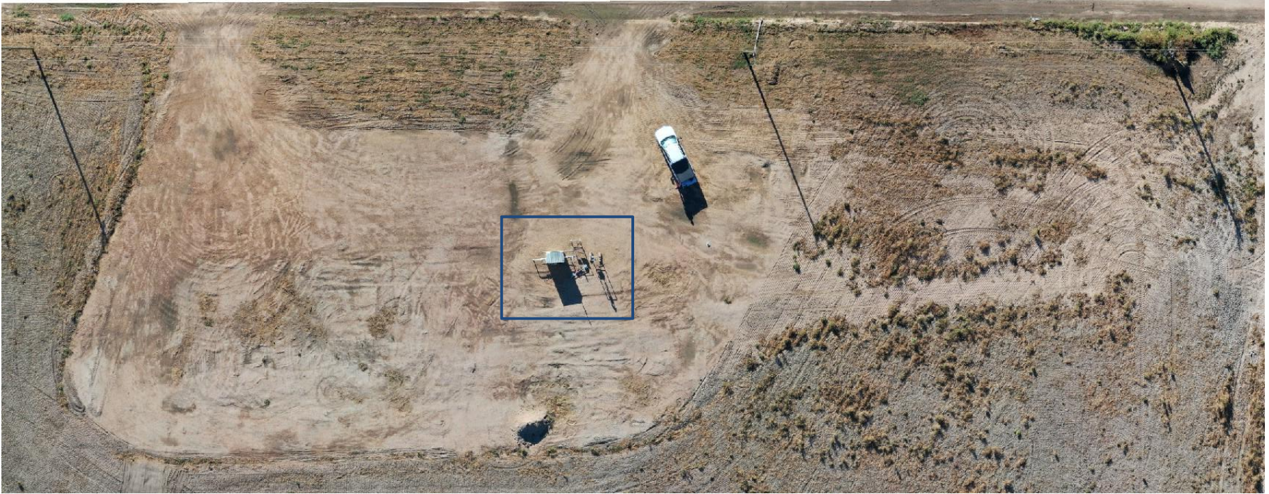
Photo 5. Zoomed in Orthomosaic drone aerial imagery taken from 200 ft (Sept. 2022). Illustrates growth on and around the tank battery. Equipment remains (blue rectangle) on tank battery location.