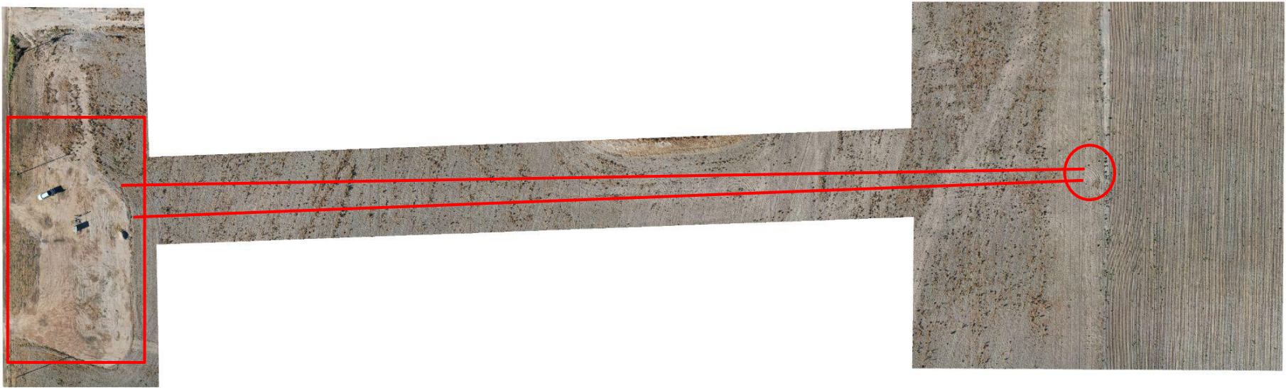
Photo 3. Orthomosaic drone aerial imagery taken from 200 ft (Spt. 2022). Illustrates growth on and around the well location (red circle), flowlines (red lines) and tank battery (red rectangle).