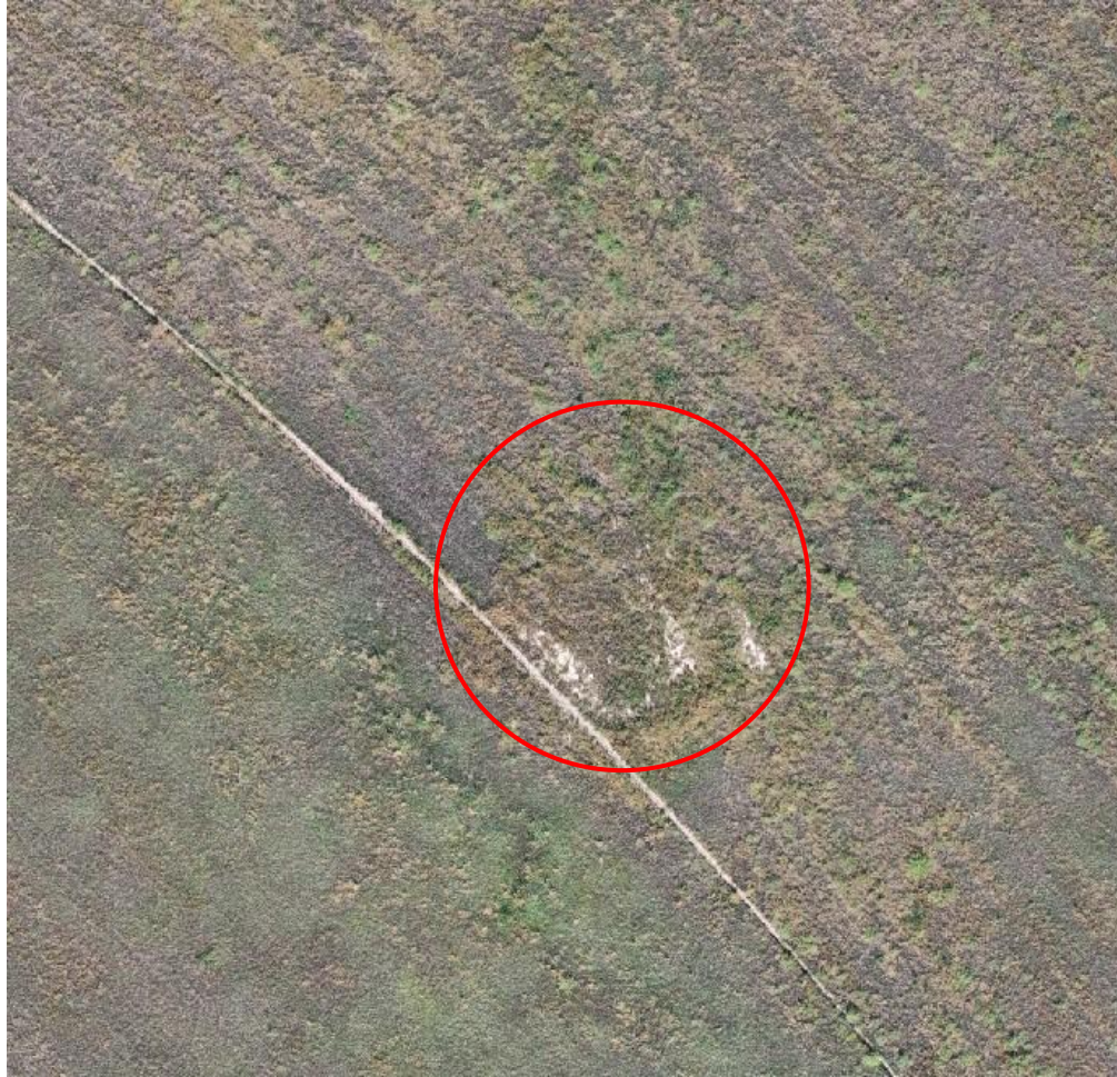
Photo 4. Zoomed in Orthomosaic drone aerial imagery taken from 200 ft (Sept. 2022). Illustrates growth on and around the well location (red circle). Some bare soil is visible however it appears to be less than 5% or 10%. Appears similar to rest of area, however crop height cannot be fully evaluated. Another inspection is required when crop is actively growing.