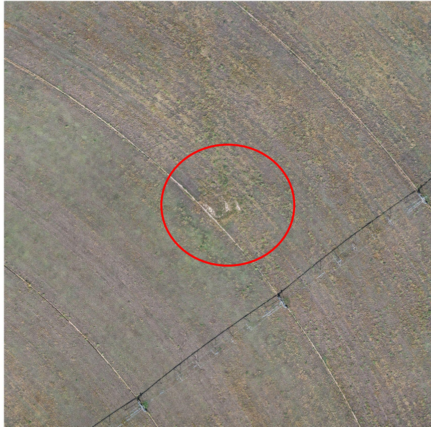
Photo 3. Orthomosaic drone aerial imagery taken from 200 ft (Sept. 2022). Illustrates growth on and around the well location (red circle). Tank battery is addressed in Location 329783 report.