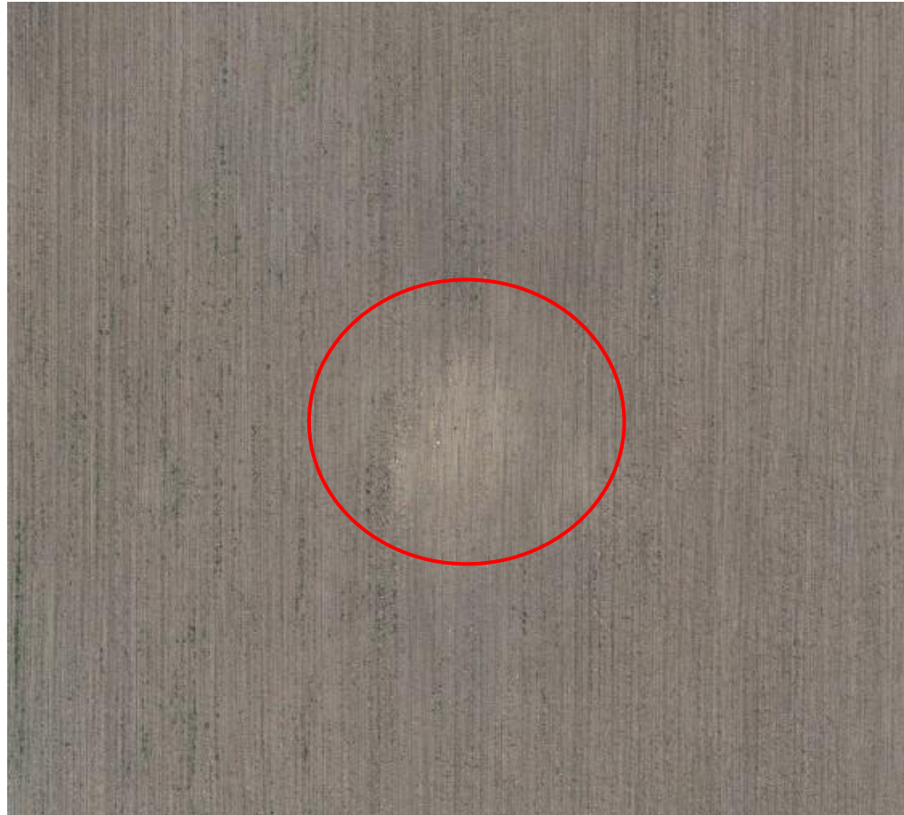
Photo 4. Zoomed in Orthomosaic drone aerial imagery taken from 200 ft (Sept. 2022). Illustrates growth on and around the well location (red circle). Appears similar to rest of area, however crop height cannot be fully evaluated. Another inspection is required when crop is actively growing.