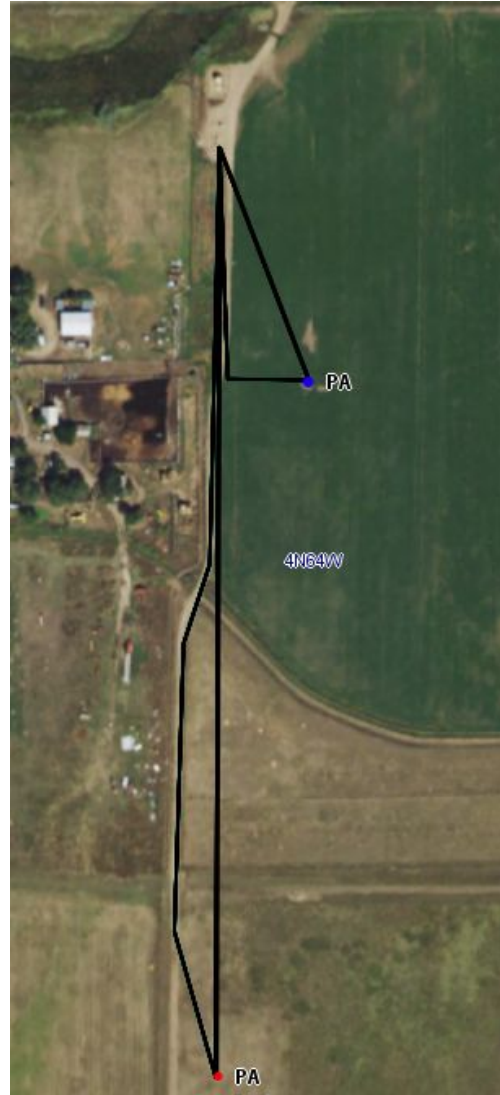
Photo 2. COGCC Online Map aerial imagery 2019 with subject well (blue dot), related well (red dot), tank battery (north center) and flowlines (black lines).