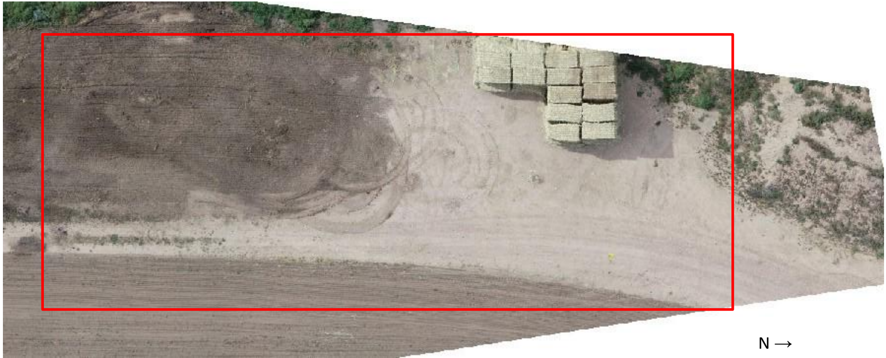
Photo 5. Zoomed in Orthomosaic drone aerial imagery taken from 200 ft (Sept. 2022). Illustrates no growth on the tank battery location (red rectangle).