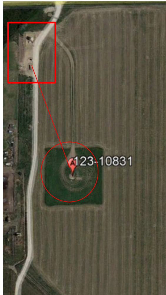
Photo 1. Google Earth aerial imagery taken 7/2019 during active operations. Photo illustrates the well location (red circle), tank battery (red rectangle), and approximate flowlines (red line).