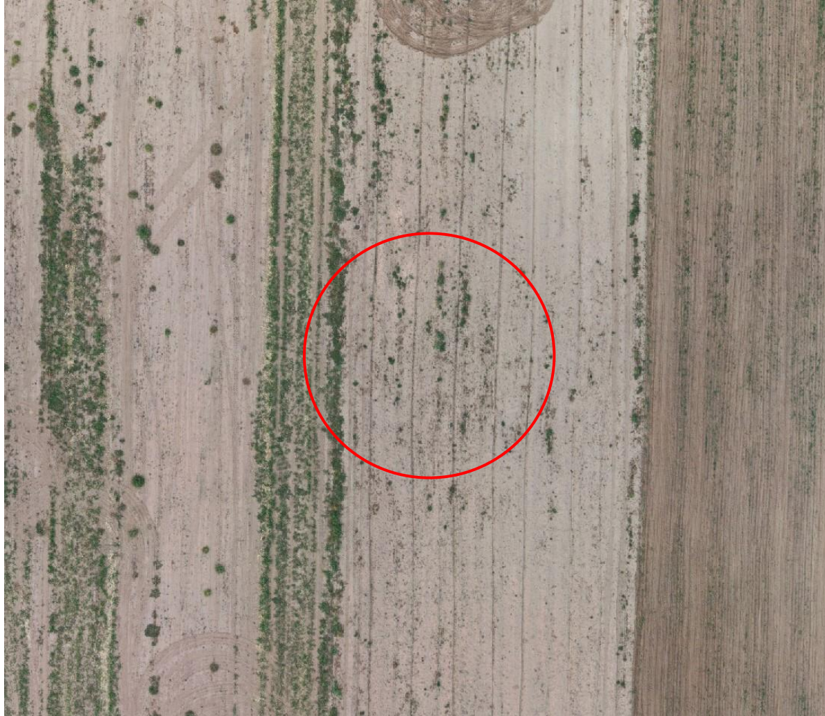
Photo 4. Zoomed in Orthomosaic drone aerial imagery taken from 200 ft (Sept. 2022). Illustrates growth on and around the well location (red circle). Ground is fallow, so another inspection is required when crop is actively growing. Access road is not apparent.