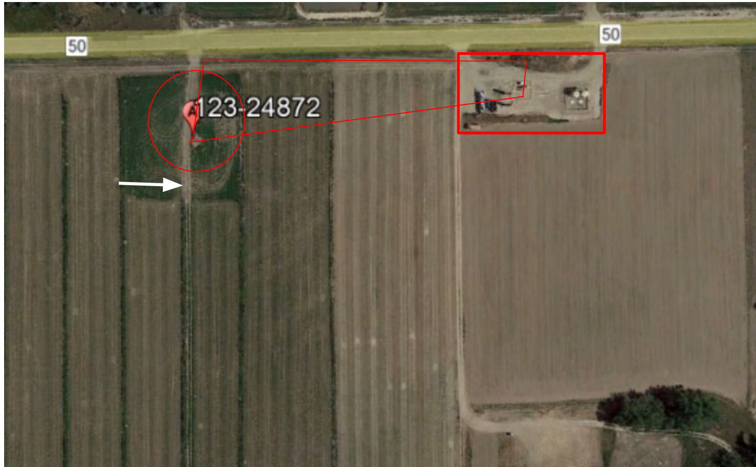
Photo 1. Google Earth aerial imagery taken 7/2019 during active operations. Photo illustrates the well location (red circle), tank battery (red square), flowline (red line), and well location access road (white arrow).