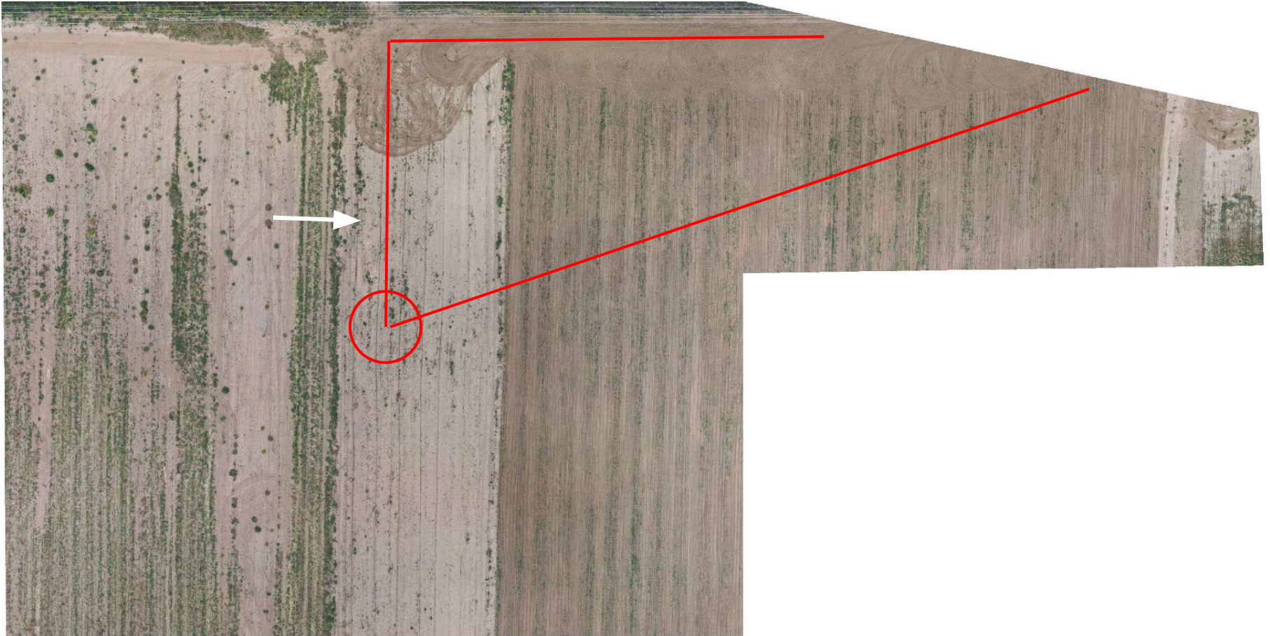
Photo 3. Orthomosaic drone aerial imagery taken from 200 ft (Sept. 2022). Illustrates growth on and around the well location (red circle), flowlines and access road (white arrow). Red line is approximate flowlines. Tank battery is addressed in Location 329878 report.