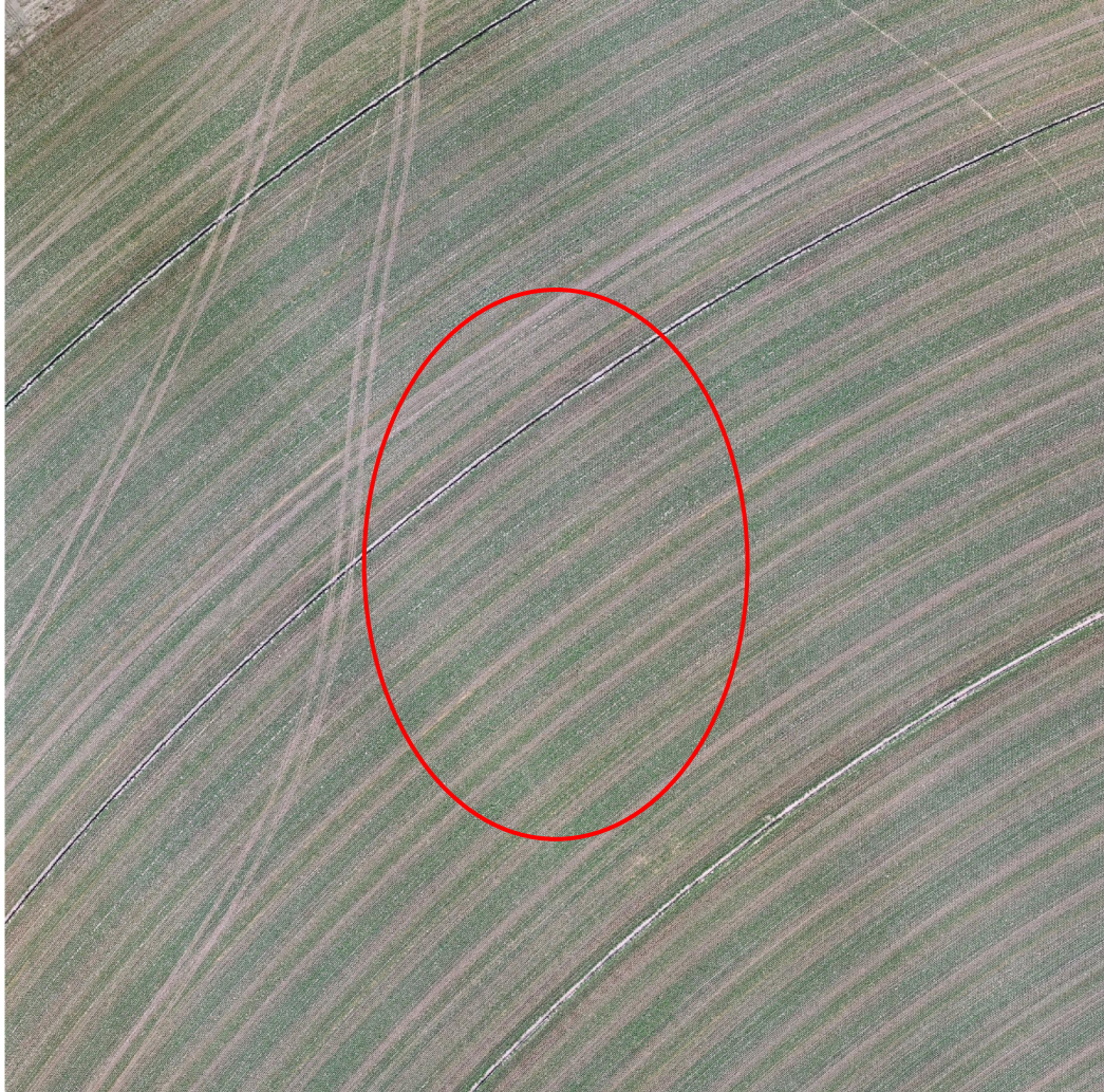
Photo 3. Orthomosaic drone aerial imagery taken from 200 ft (Sept 2022). Illustrates harvested crop on and around the well locations (red circle). Tank Battery is addressed in Location 323230 report.