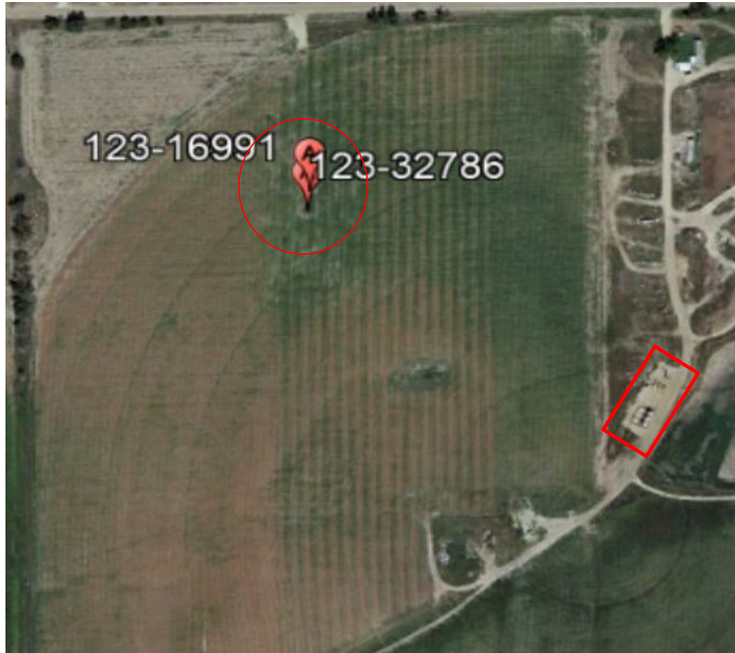
Photo 1. Google Earth aerial imagery taken 9/2013 during active operations. Photo illustrates the well locations (red circle) and tank battery (red rectangle).