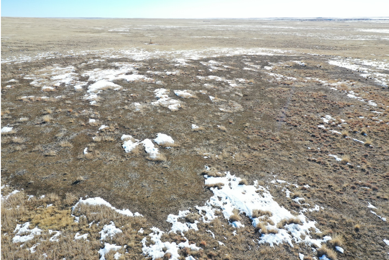
Photo 2. Facing southwest toward the location. The perennial vegetation has not established and most of the location is bare of vegetation.