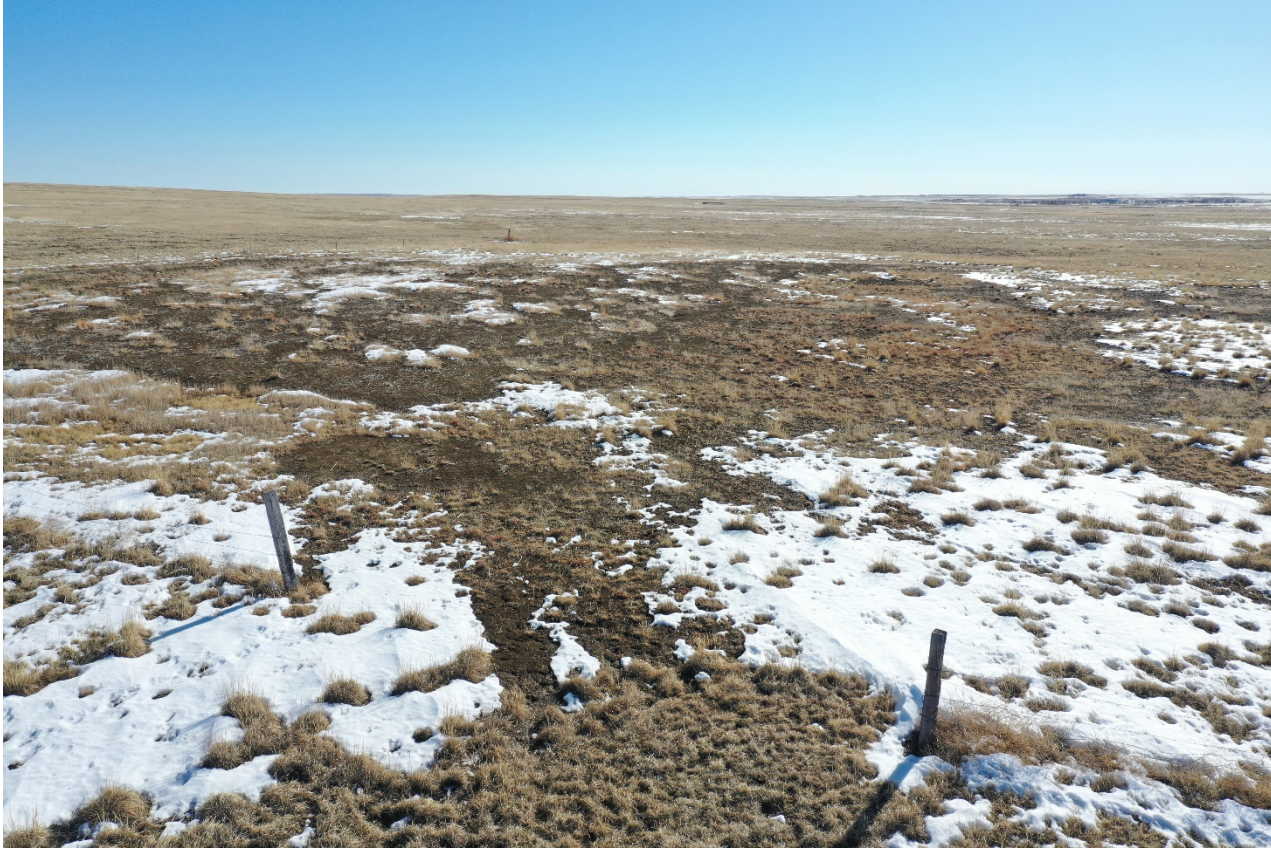
Photo 1. Facing southwest toward the location. The gate between the two wood post is down and the fence is not maintained.