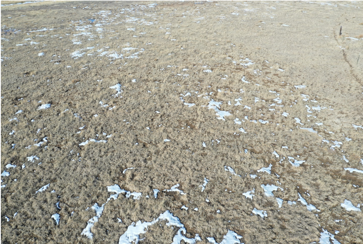
Photo 4. Facing down toward the surrounding undisturbed reference area which has a uniform native vegetation cover.