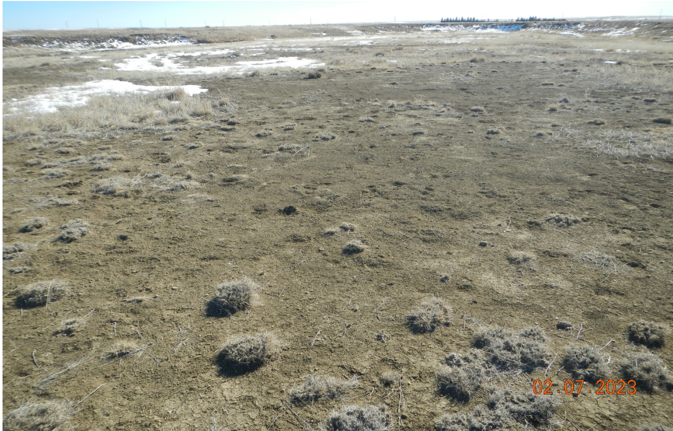
Photo 2. Center of the location facing south. The perennial vegetation has not re-established at the location.