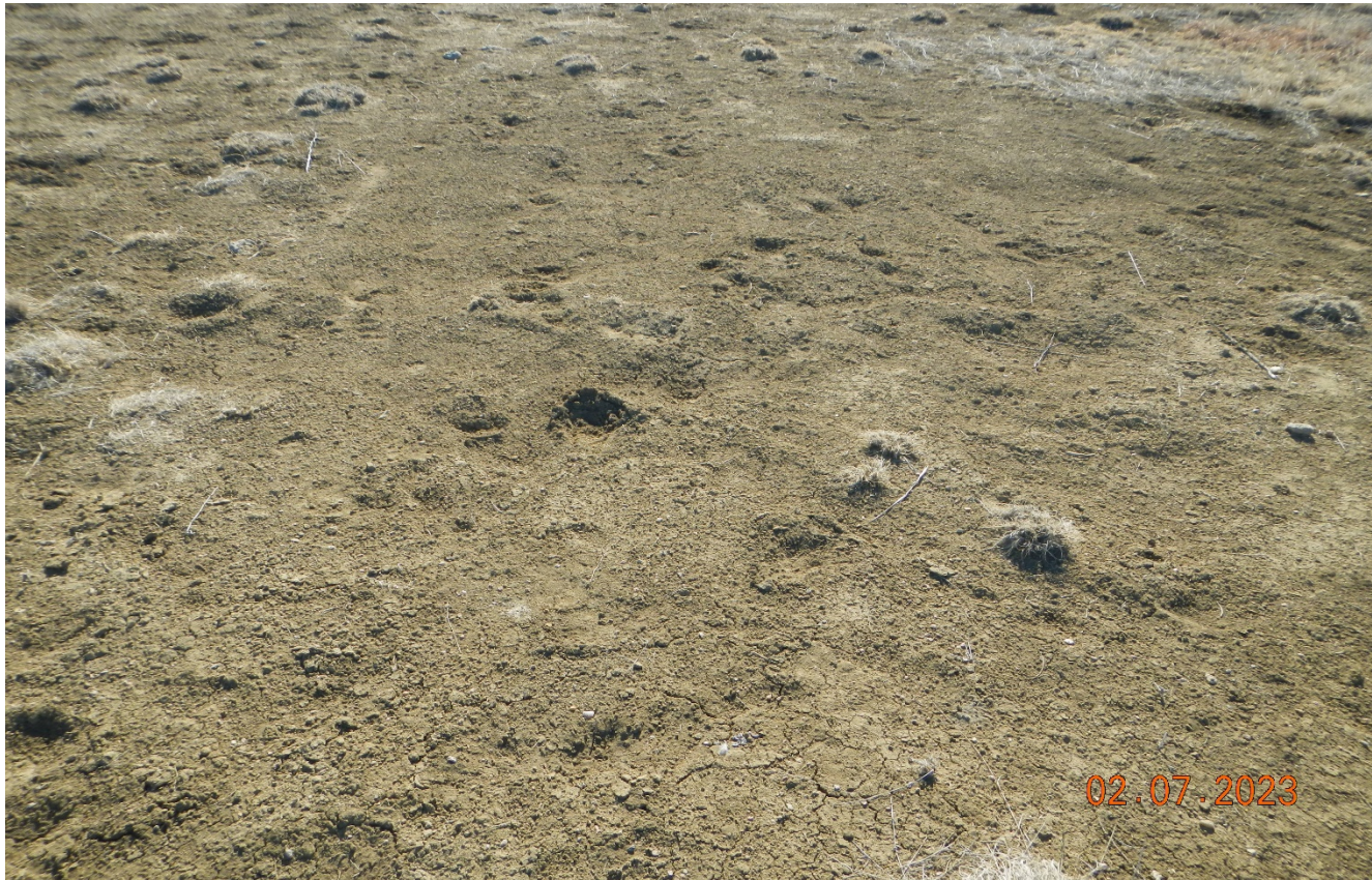
Photo 4. Facing toward the groundcover at the location which shows insufficient vegetation cover.