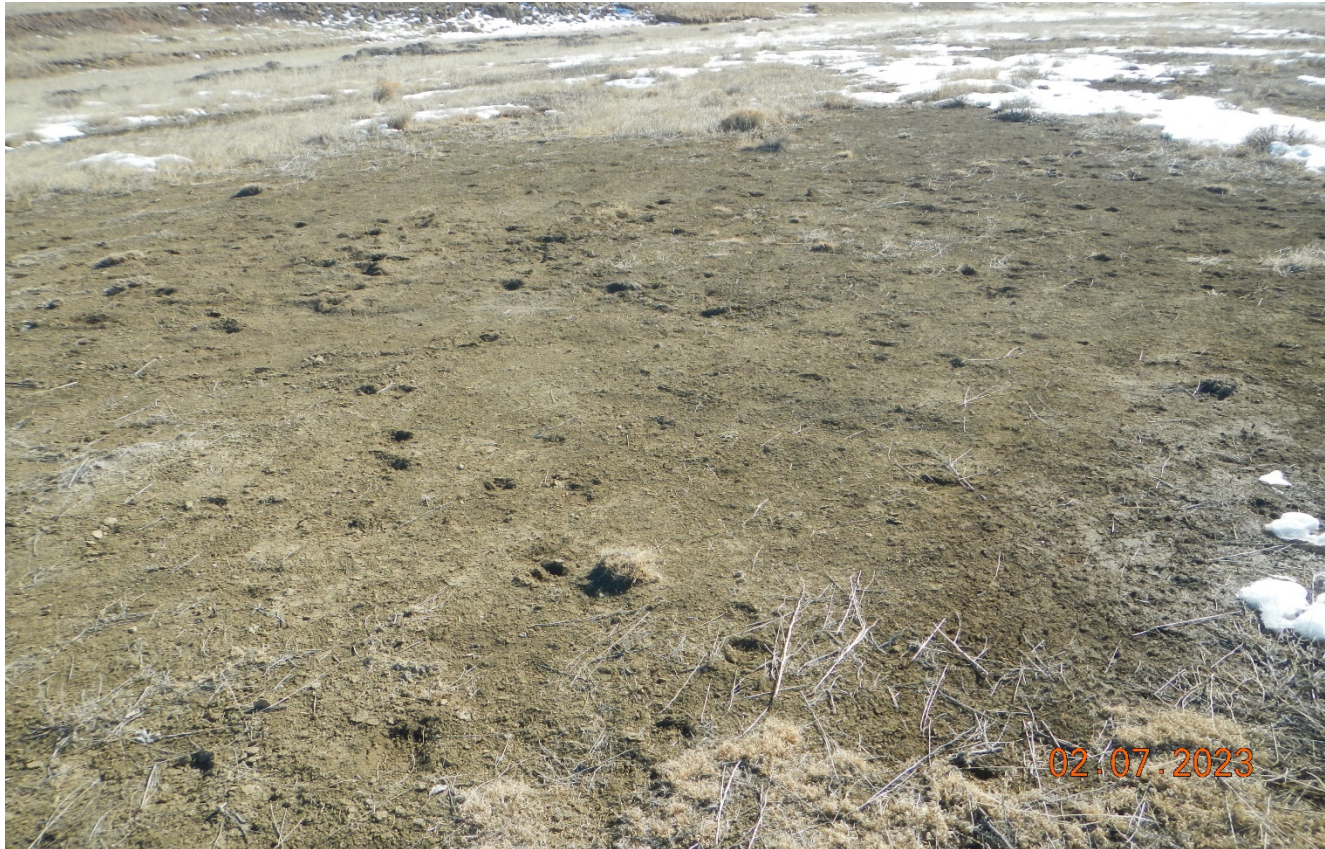
Photo 3. Facing southwest at the location. This area is approximately 80x80' with minimal vegetation cover.