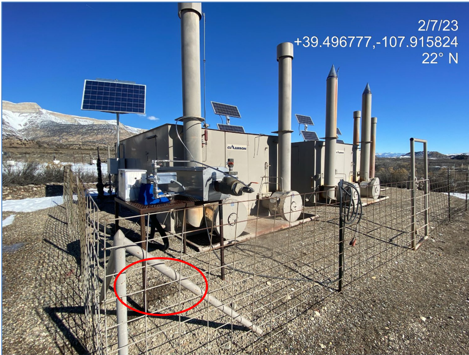
Photo 2. Photos show stained soil beneath chemical injection equipment.