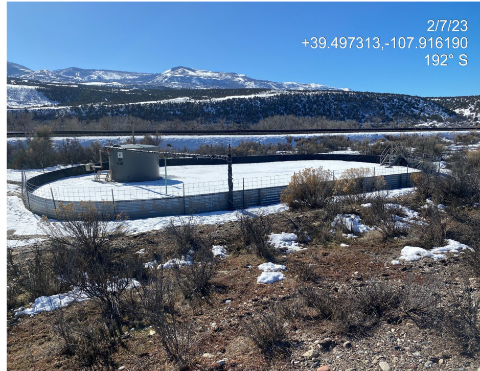
Photo 1. Photos show an overview of the location to the west (left) and southeast (right).