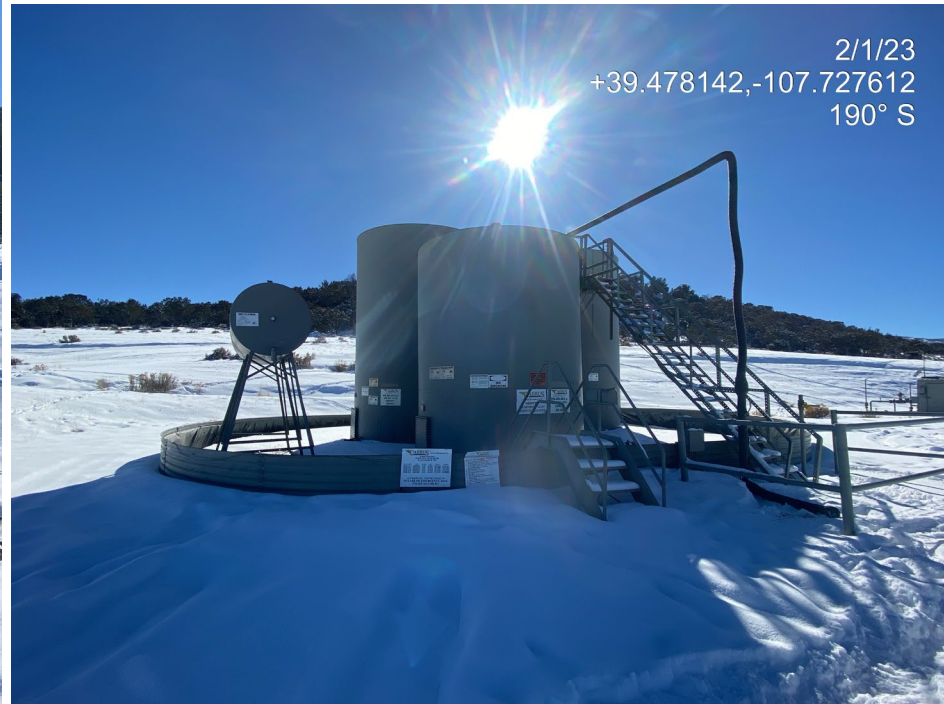
Photo 3. Photos show production areas.