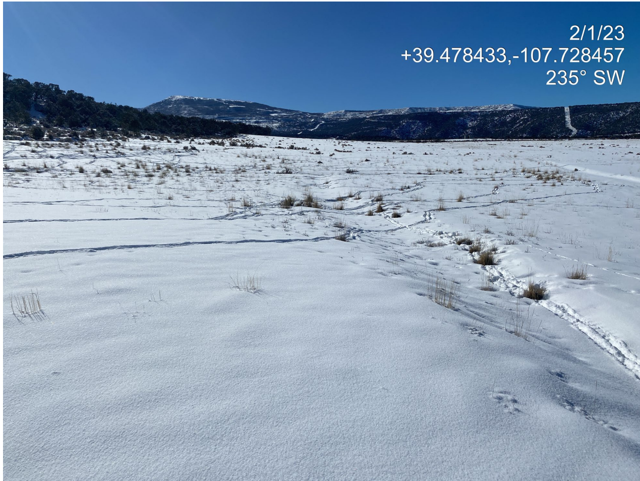
Photo 4. Photo shows an example of interim areas. Perennial grasses appear established.