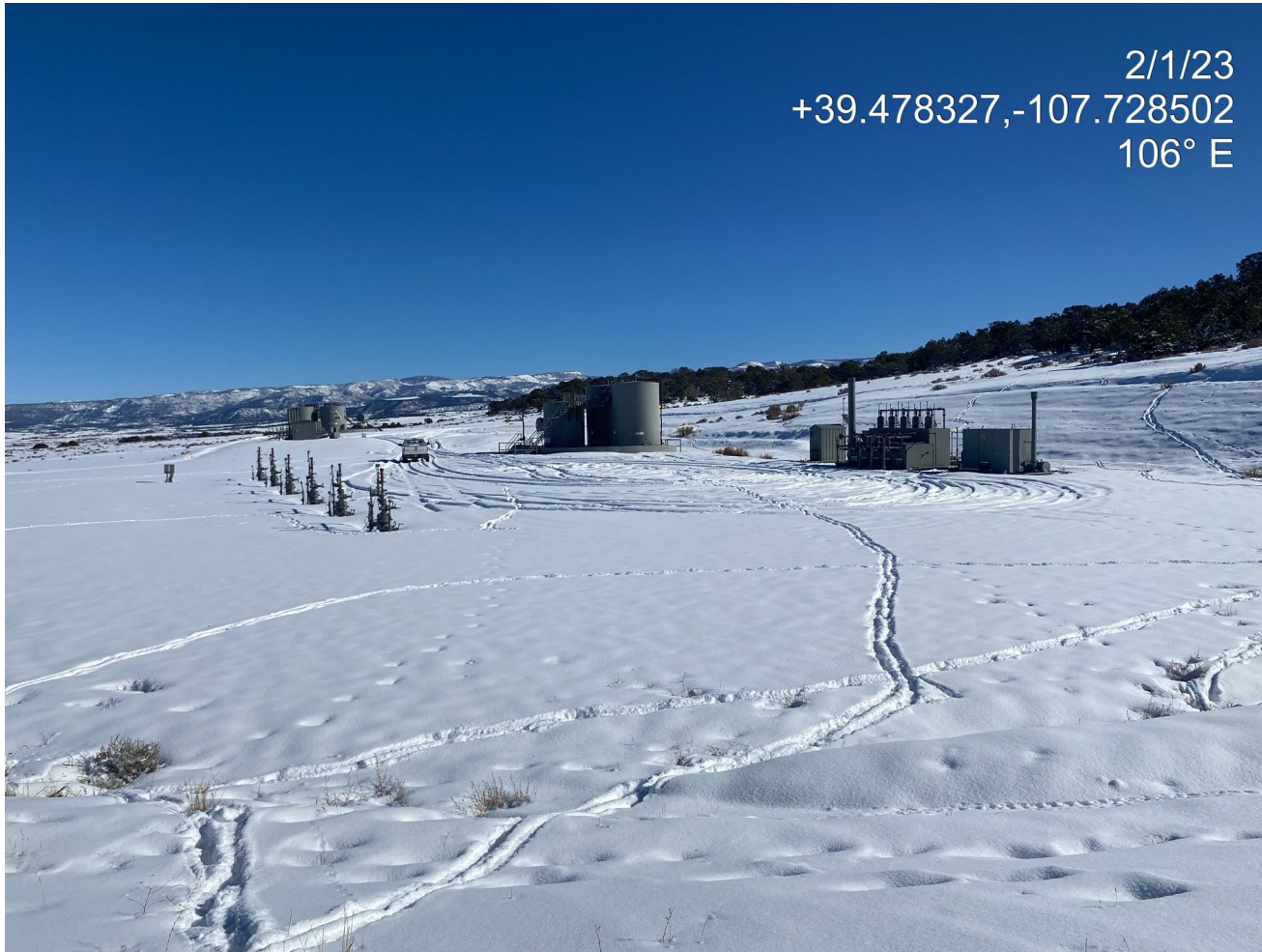
Photo 1. Photo taken from the west shows an overview of the location.