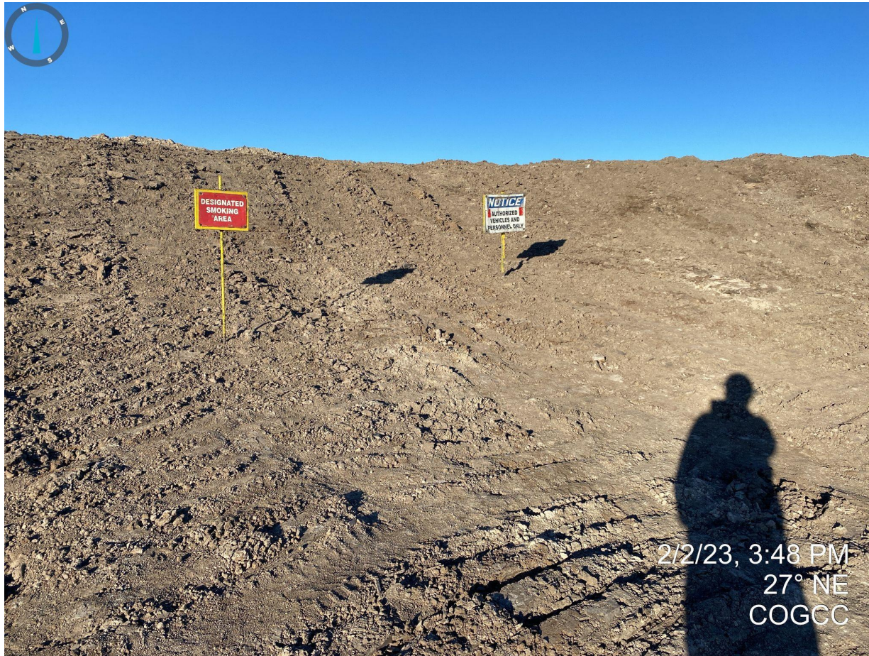
Photo 14. Facing northeast from topsoil stockpiles. See comments in Photo 13.