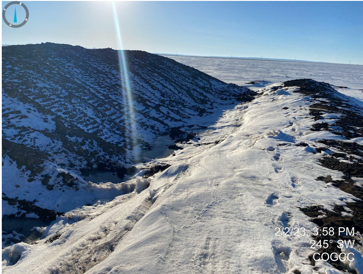
Photo 13. Facing southwest from the topsoil stockpiles. Photo illustrates that topsoil stockpiles have been temporarily stabilized with equipment tracking.