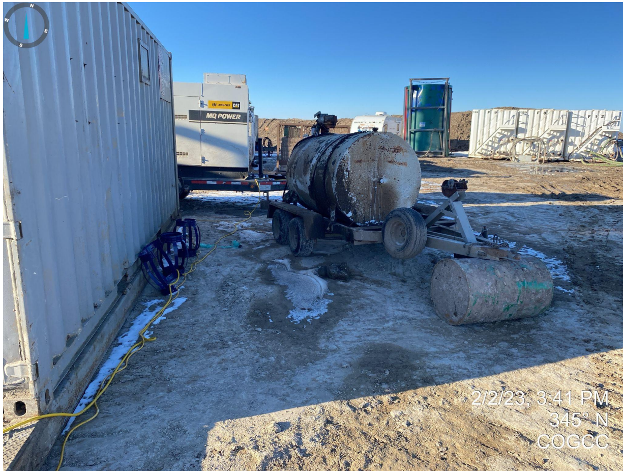
Photo 3. Facing north near the drill rig. Diesel tank does not have a secondary containment and is not in compliance with Rule 1002.f.(2)B.