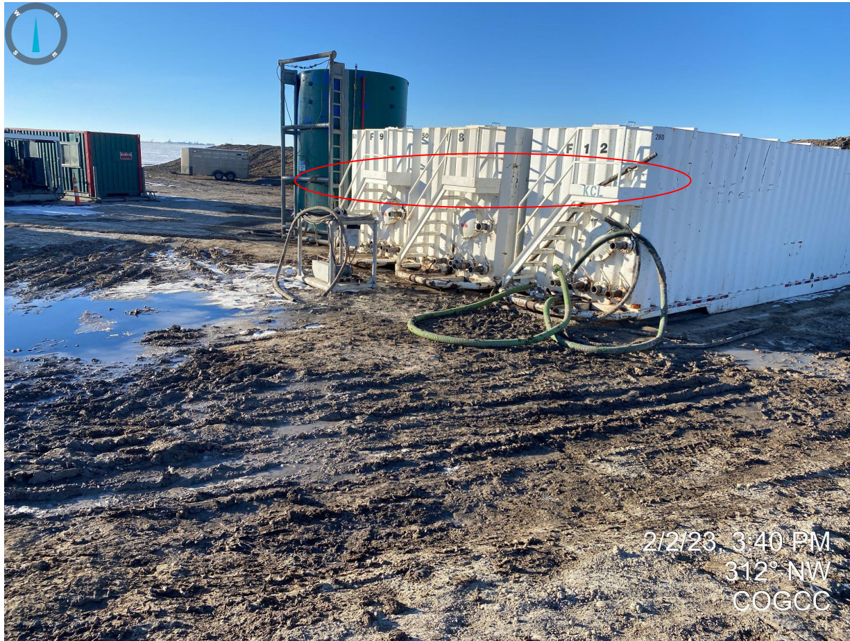
Photo 4. Facing northwest near the entrance. Tanks do not have adequate labels/NFPA placards.