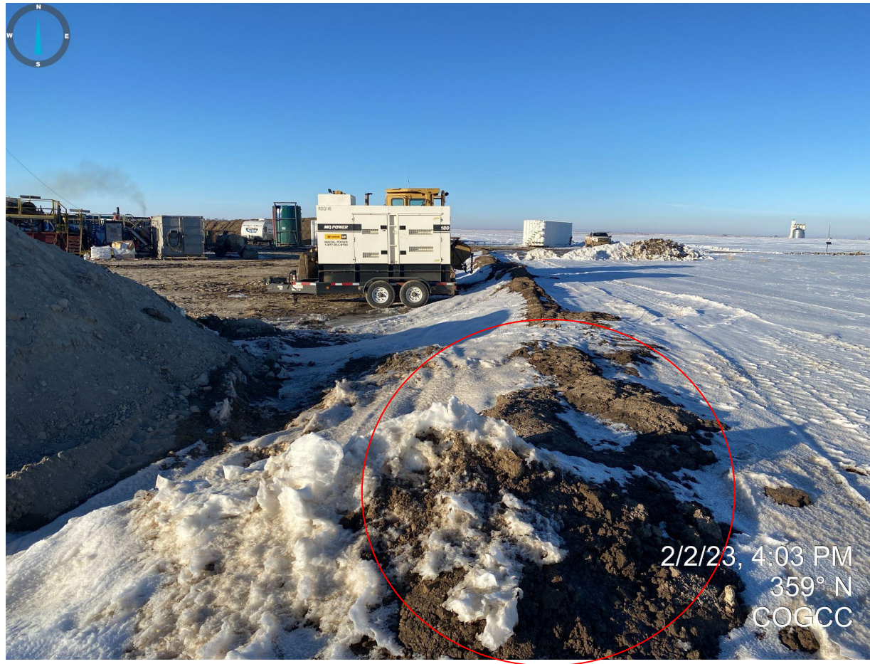
Photo 20. Facing north from the southeast corner of the location. Photo illustrates that the berm BMP is still comprised of unconsolidated material and is not in compliance with Rule 1002. Staff acknowledges that the weather and snow cover are preventing maintenance; maintenance will need to be performed as weather permits.