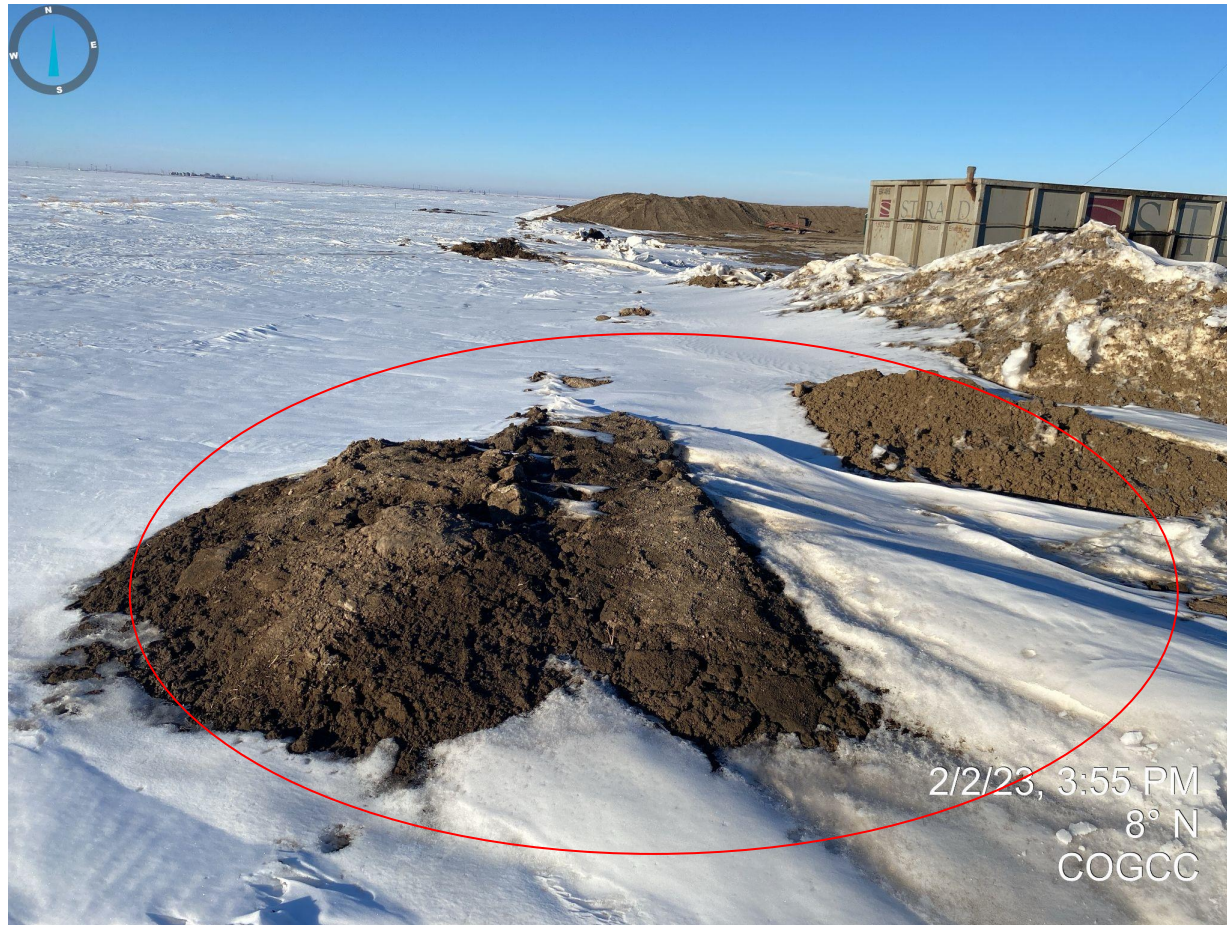
Photo 22. Facing north from the southwest corner of the location; see comments in Photo 20.