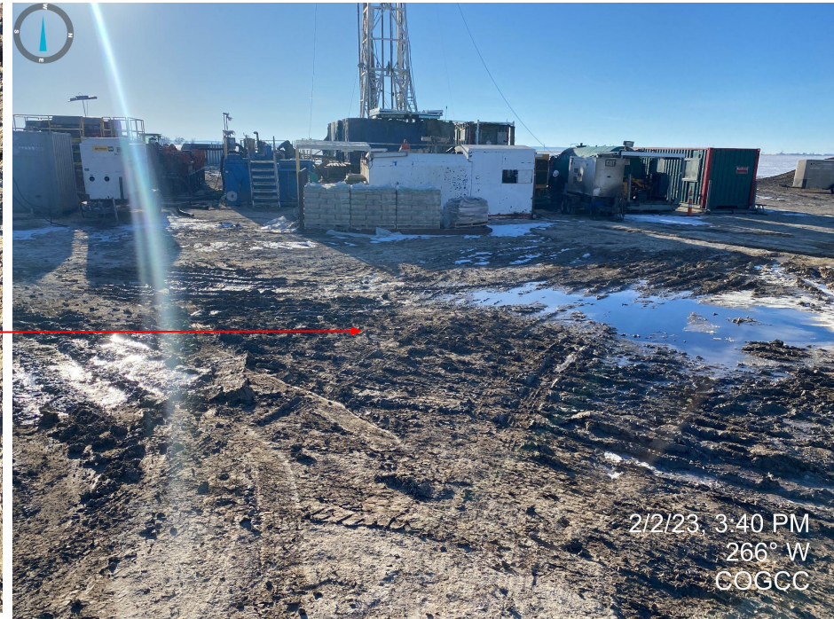
Photos 1 & 2. Cigarette butts observed near the location's entrance which is not compliant with Rules 610.f or 610.g.