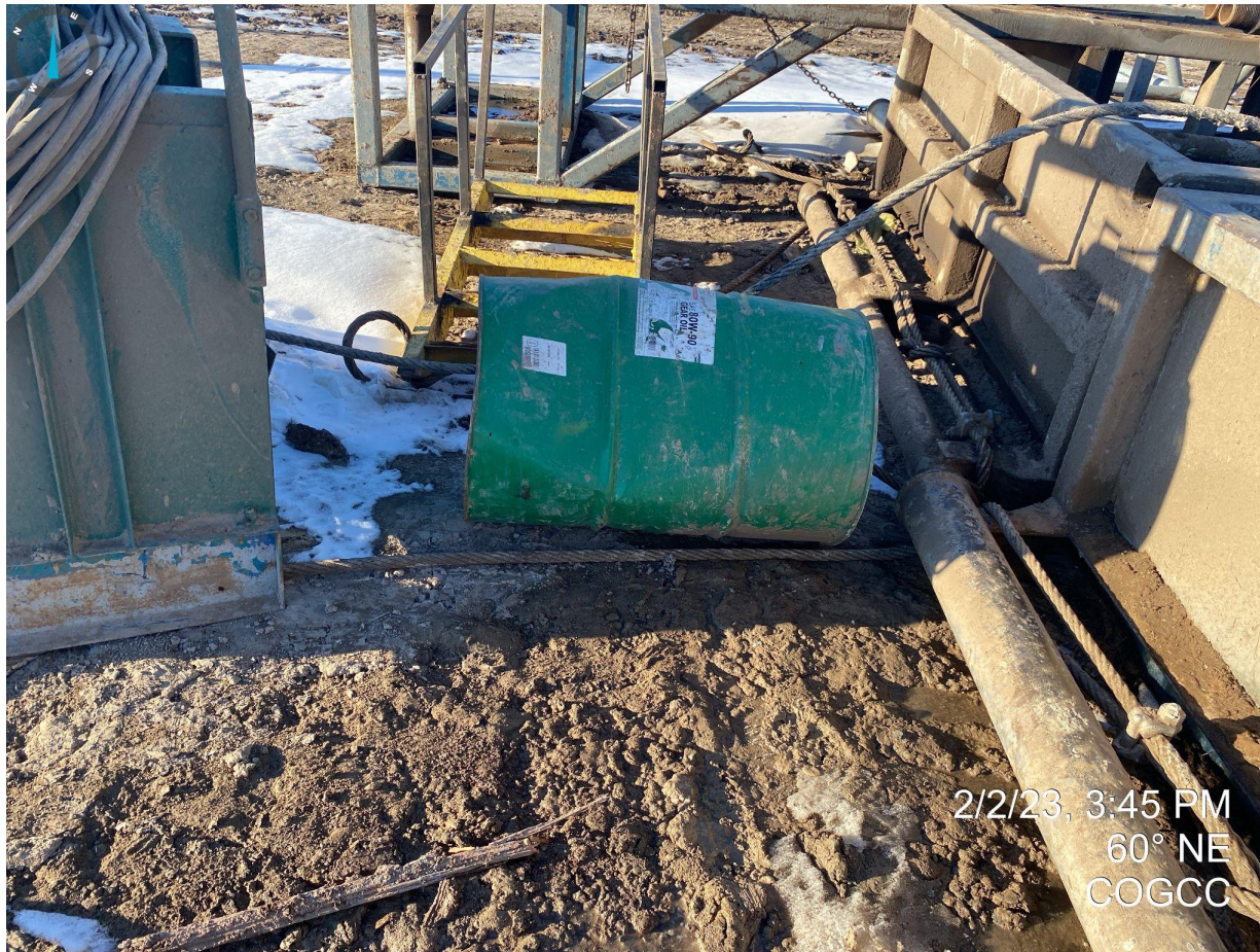
Photo 7. Facing northeast near the drill rig. Photo illustrates barrel that was tipped over, not placed in a secondary containment, and is not in compliance with Rule 1002.f.(2)B.