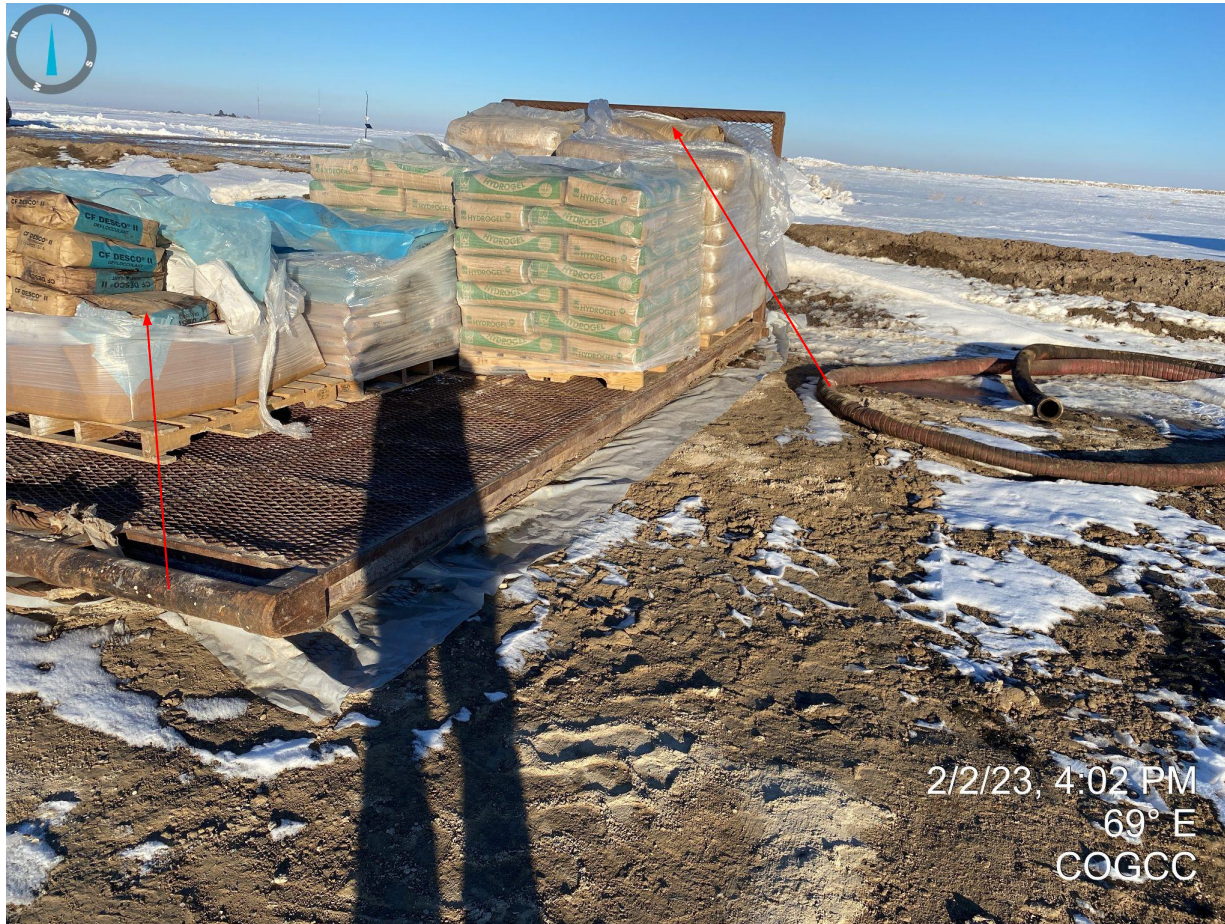
Photo 8. Facing east from the eastern portion of the location. Photo illustrates that materials do not have adequate covering to minimize contact with precipitation or stormwater and are not in compliance with Rule 1002.f.(2)A.