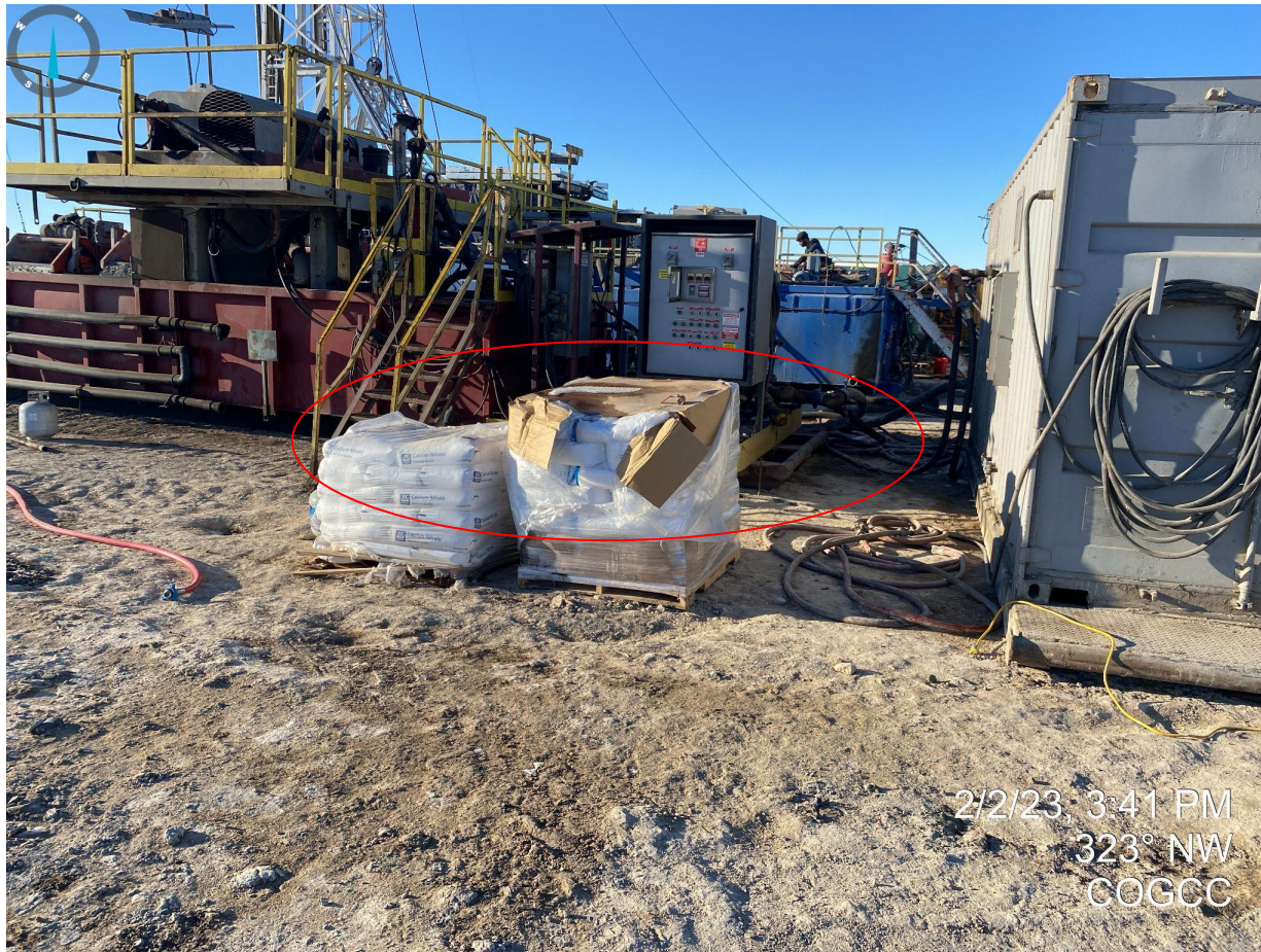
Photo 5. Facing northwest near drill rig. Photo illustrates that materials do not have adequate covering to minimize contact with precipitation or stormwater and are not in compliance with Rule 1002.f.(2)A.