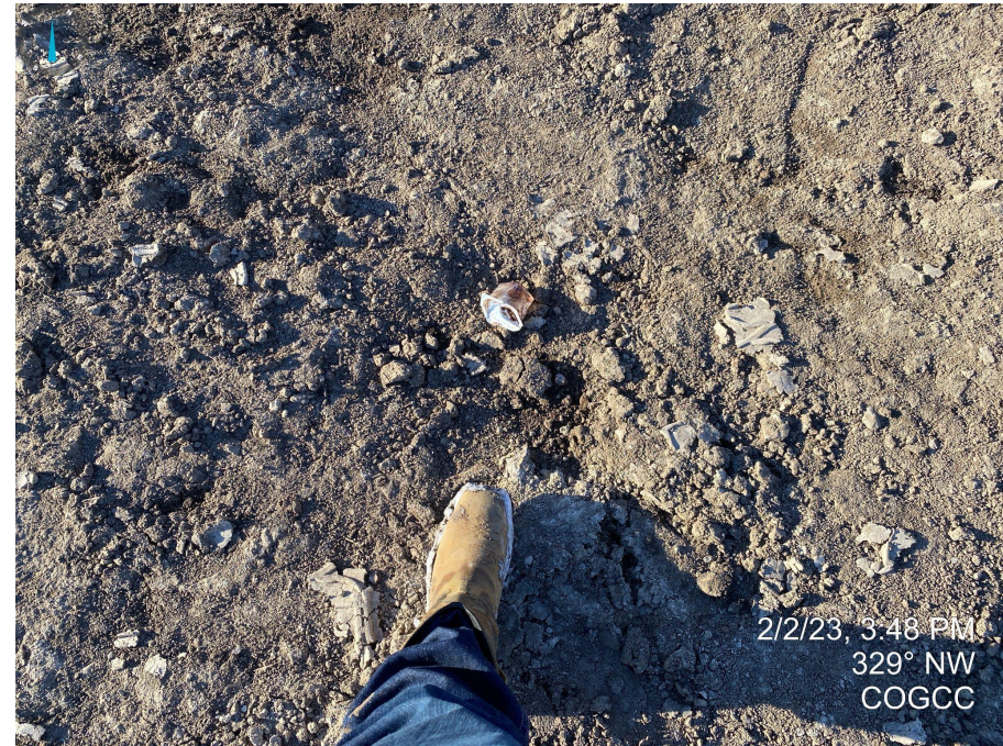
Photos 17 & 18. Close up photos near the topsoil stockpiles illustrating trash that was observed on location.