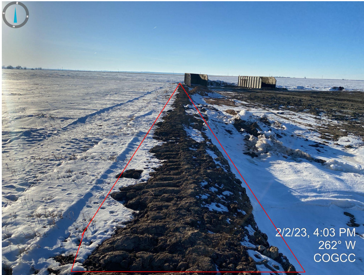
Photo 21. Facing west from the southeast corner of the location; see comments in Photo 20.