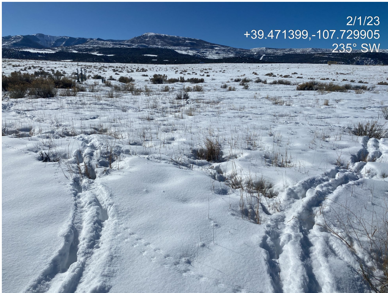
Photo 4. Photo shows an example of interim areas. Perennial grasses appear established.

Inspection Photos Location Name: BENZEL-67S93W/1SWSW Location ID: 334961