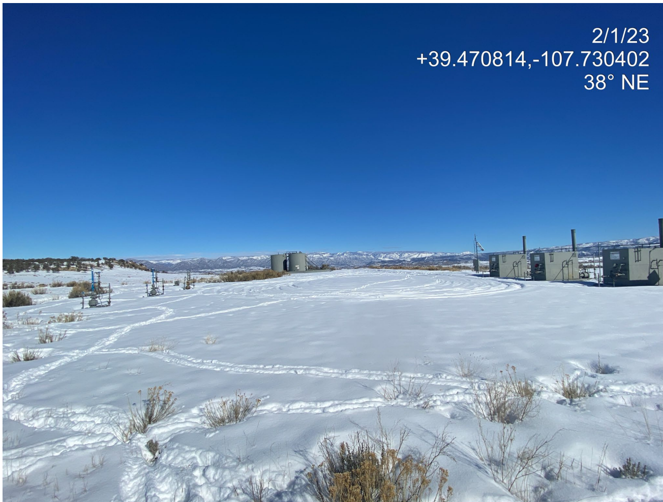
Photo 1. Photo taken from the south shows an overview of the location.