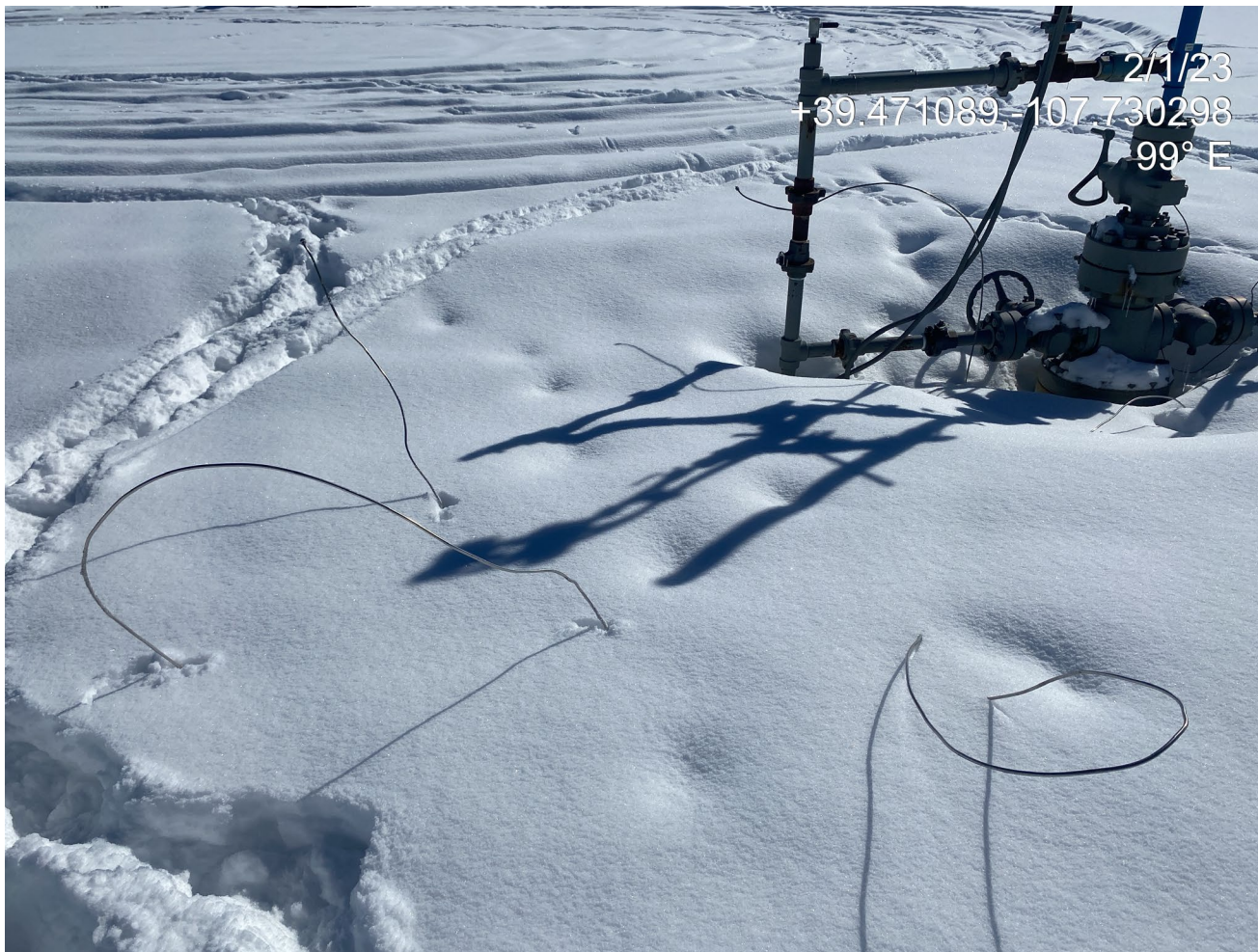
Photo 2. Photo shows old injection line equipment/debris.