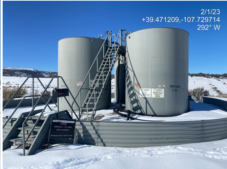
Photo 3. Photos show production areas.