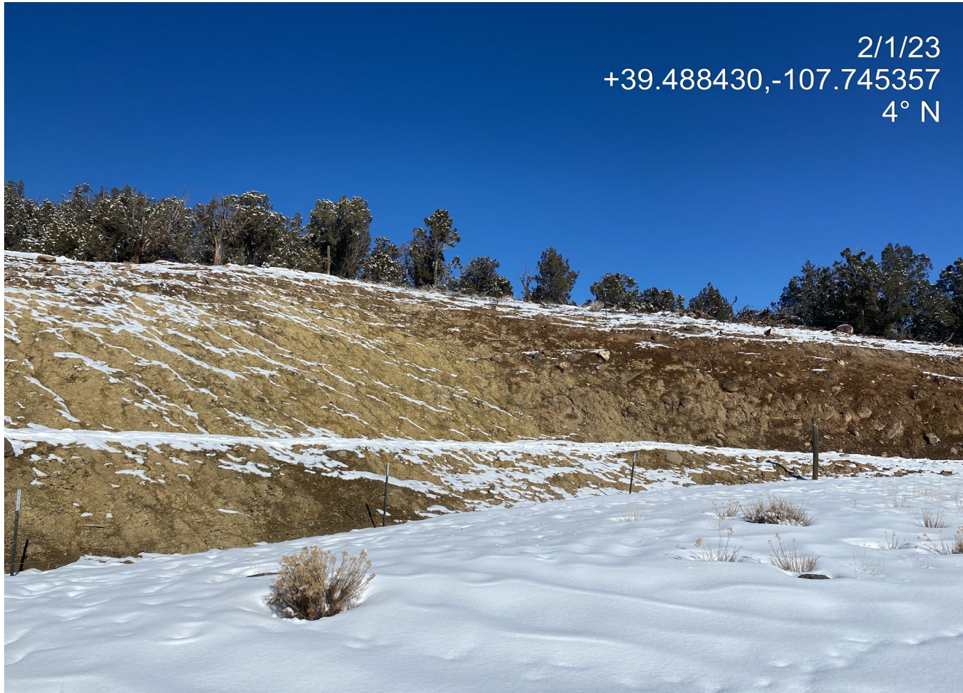
Photo 2. Photo shows the eroding cut slope at the north of the location.