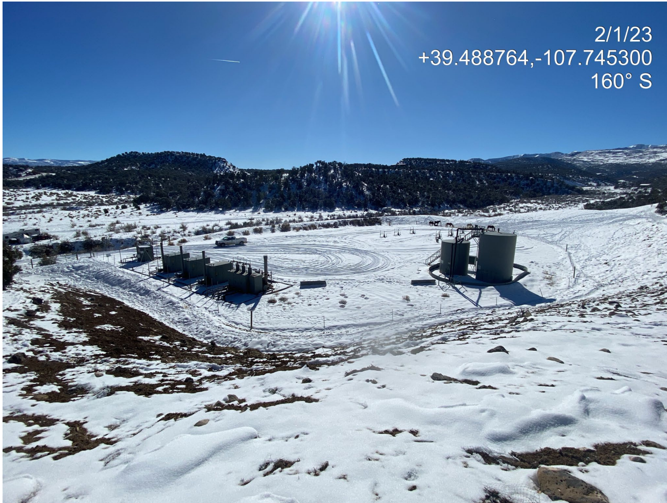
Photo 1. Photo taken from the north shows an overview of the location.