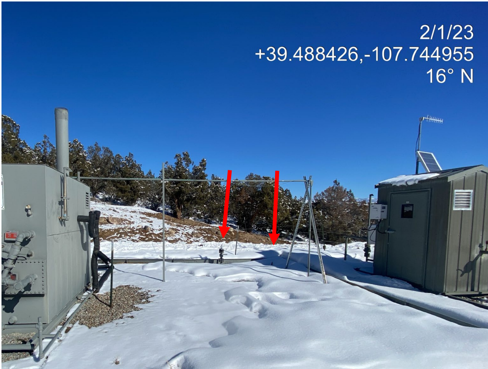
Photo 5. Photos show two (2) risers which appear to be associated with a plugged and abandoned well and decommissioned flowline and separator.