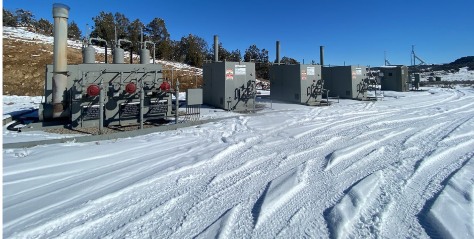
Photo 6. Photos show production areas.