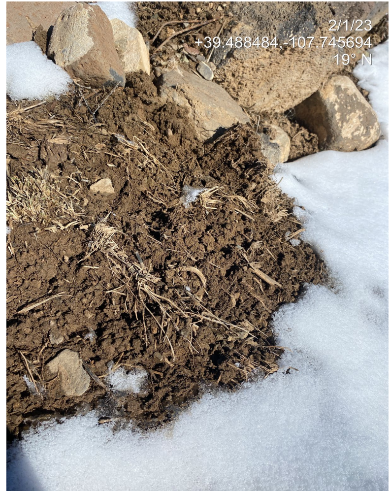
Photo 4. Photos show exposed roots of grazed or uprooted perennial grasses.