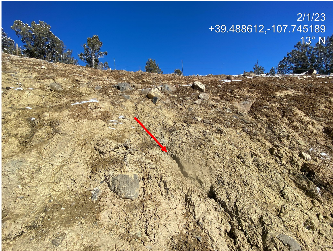
Photo 3. Photo shows rill erosion occurring on the cut slope at the north of the location.