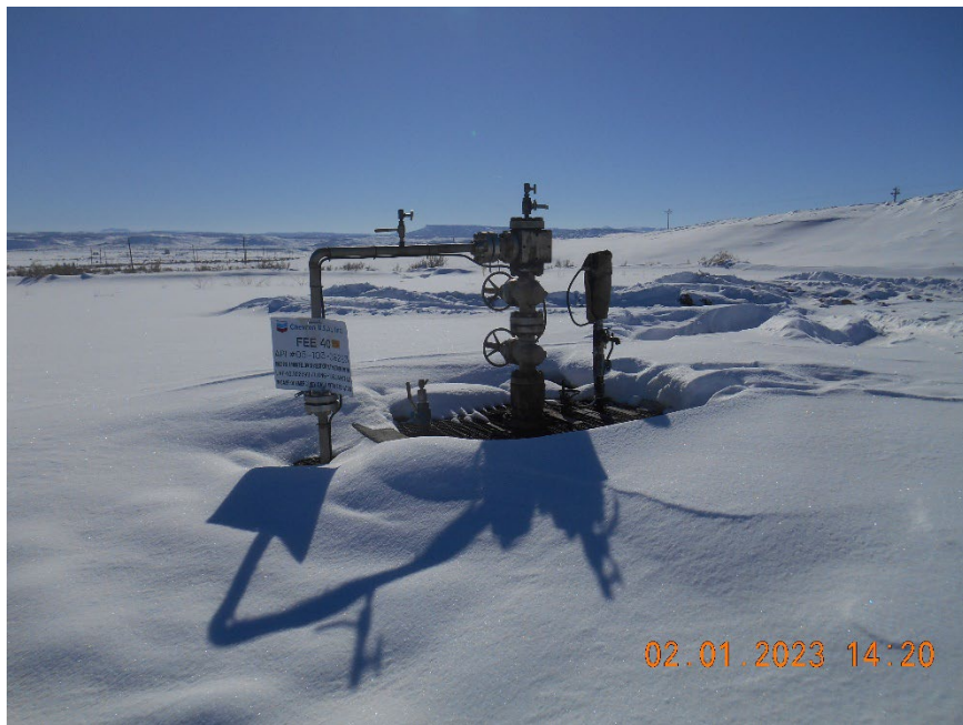
Injection wellhead during MIT