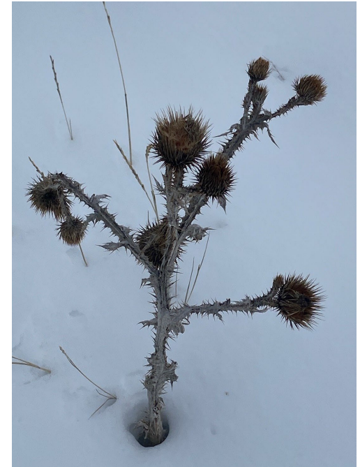
Photo 2. Photo shows an example of interim area vegetation. Perennial grasses appear established. Scotch thistle (List B Noxious) is present.