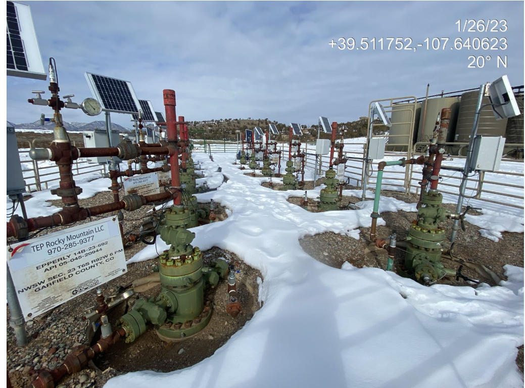
Photo 5. Photos show production areas.