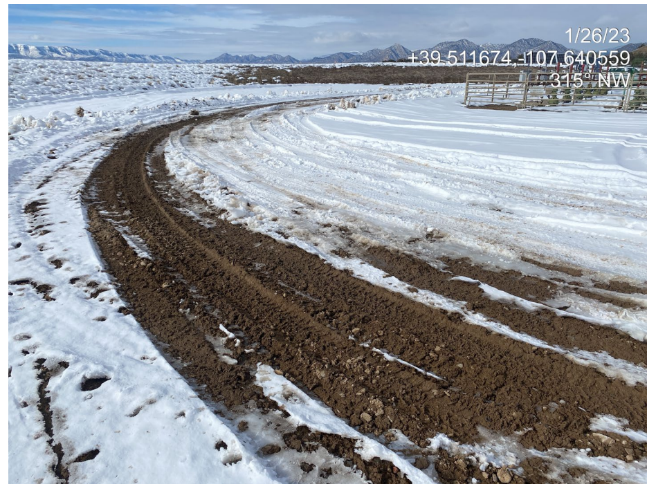
Photo 2. Photos show degradation to the pad surface and a lack of stabilization BMPs and tracking controls.