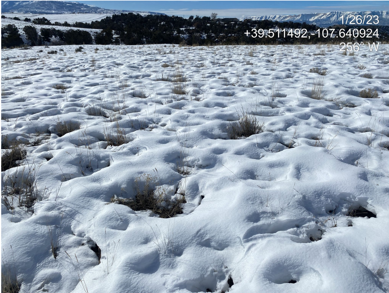
Photo 6. Photo shows an example of interim area vegetation. Perennial grasses appear established.