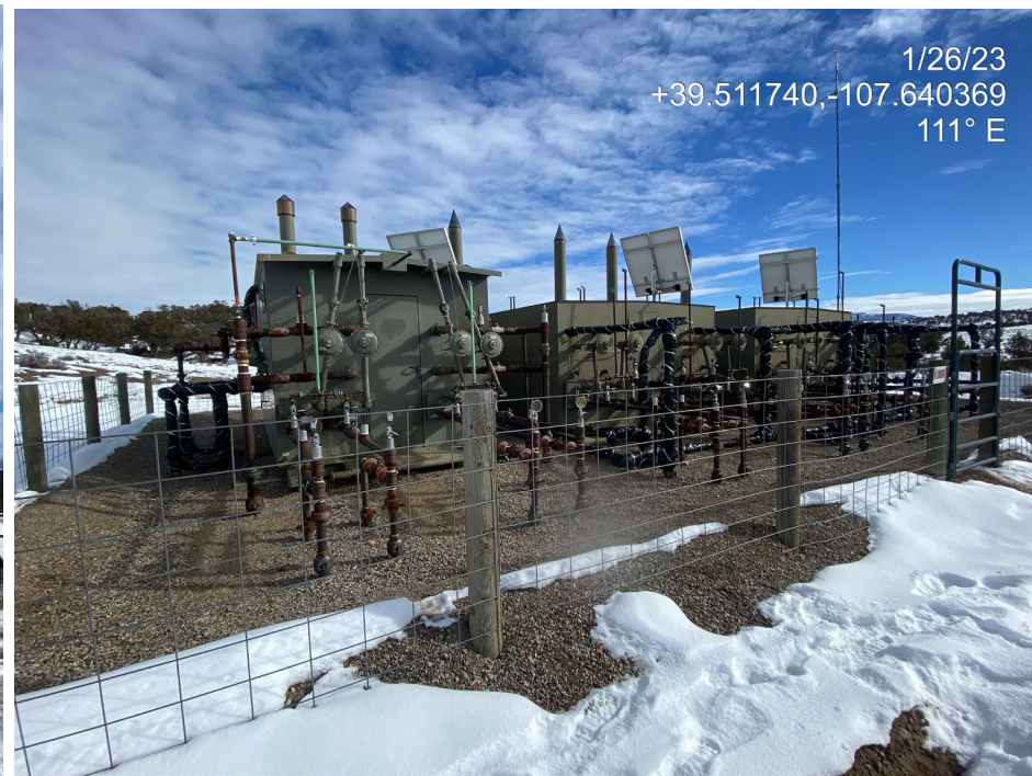
Photo 4. Photos show production areas.