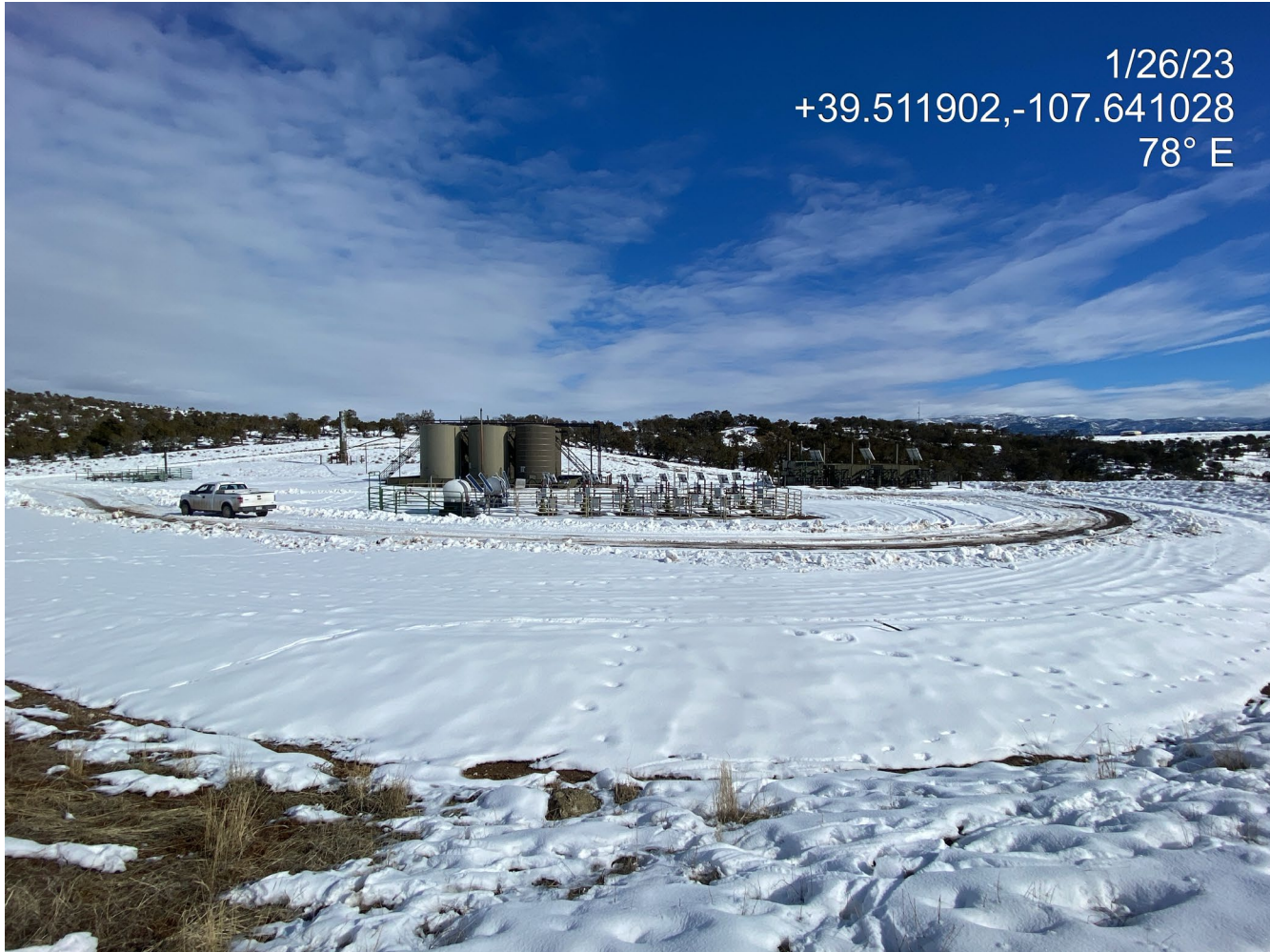
Photo 1. Photo taken from the west shows an overview of the location.