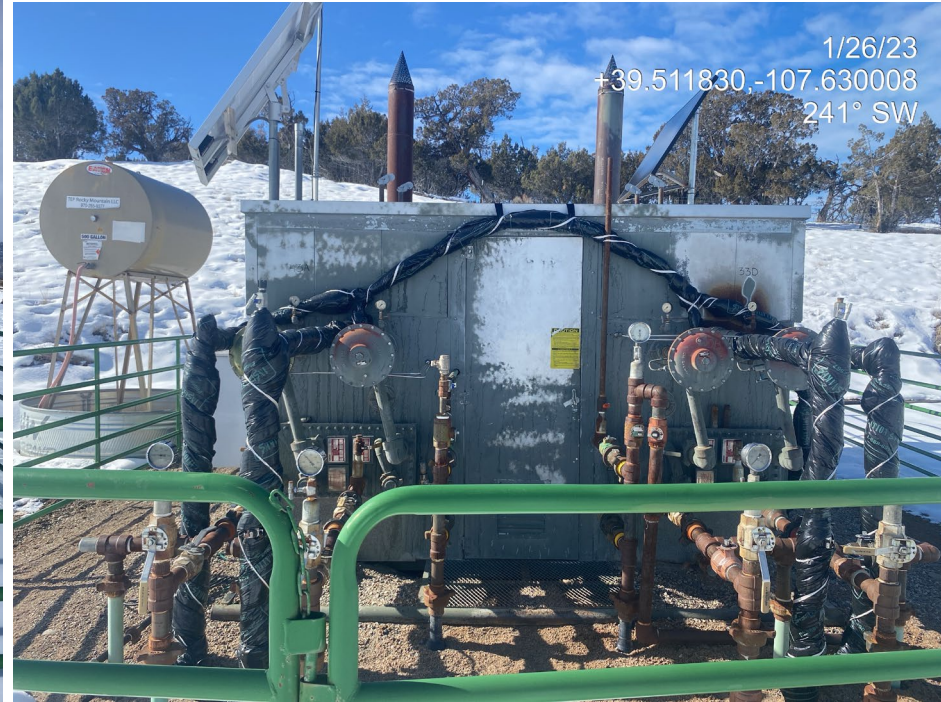
Photo 3. Photos show production areas.