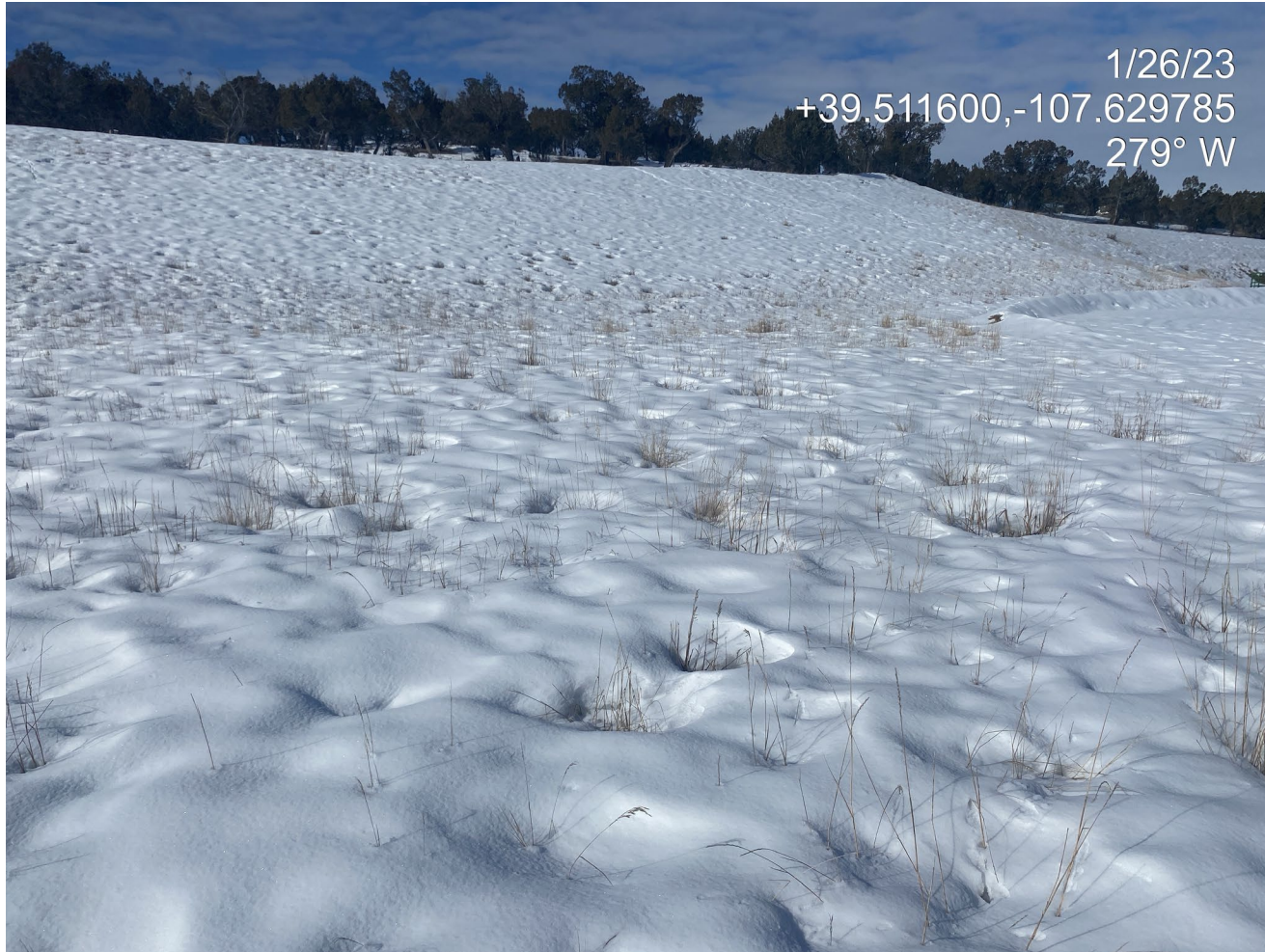
Photo 5. Photo shows an example of interim area vegetation. Perennial grasses appear established.