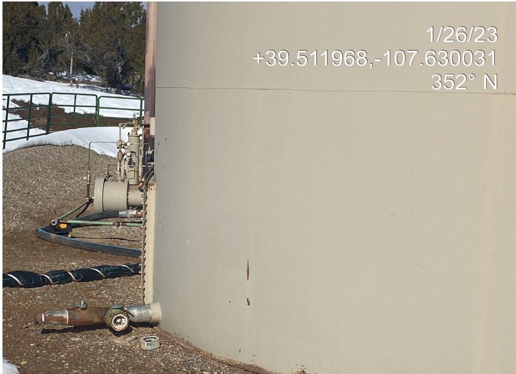
Photo 2. Photos show a cap not installed on a tank drain line (left) and wildlife protection BMPs absent on a secondary containment stock tank (right).