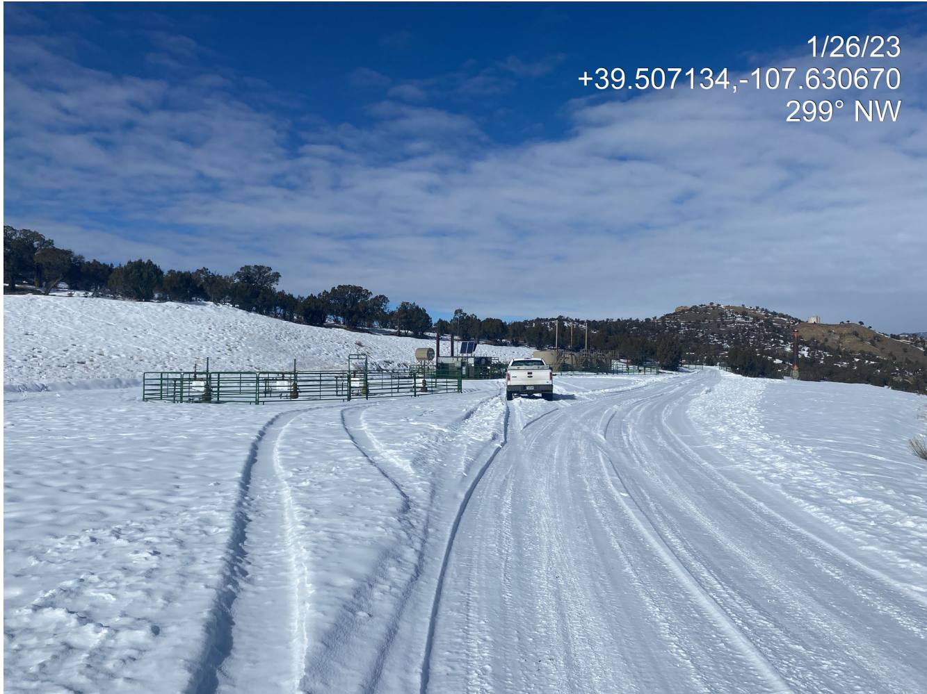
Photo 1. Photo taken from the south shows an overview of the location.