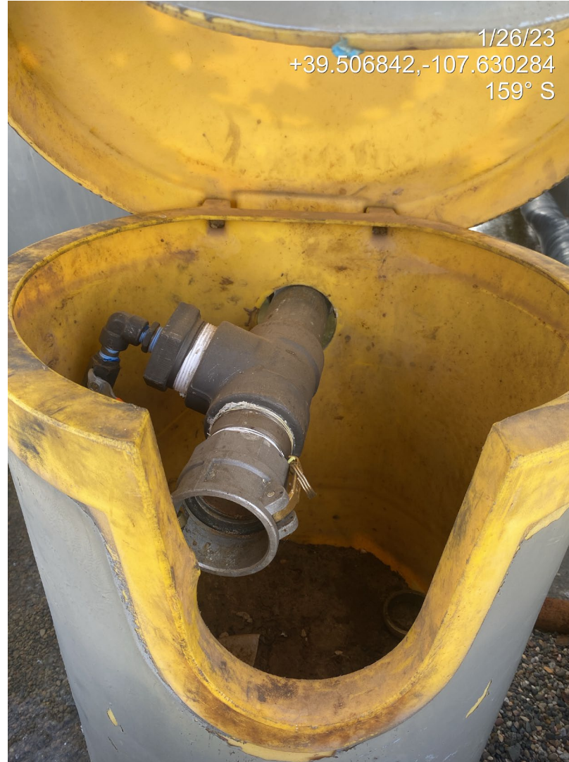
Photo 2. Photo shows a load line lacking a bull plug.