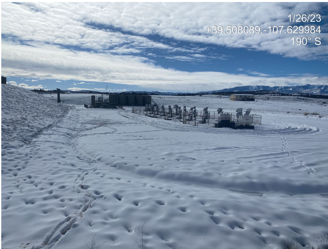
Photo 1. Photo taken from the north shows an overview of the location.