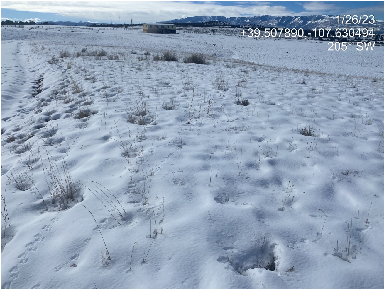
Photo 7. Photo shows an example of interim area vegetation. Perennial grasses appear established.