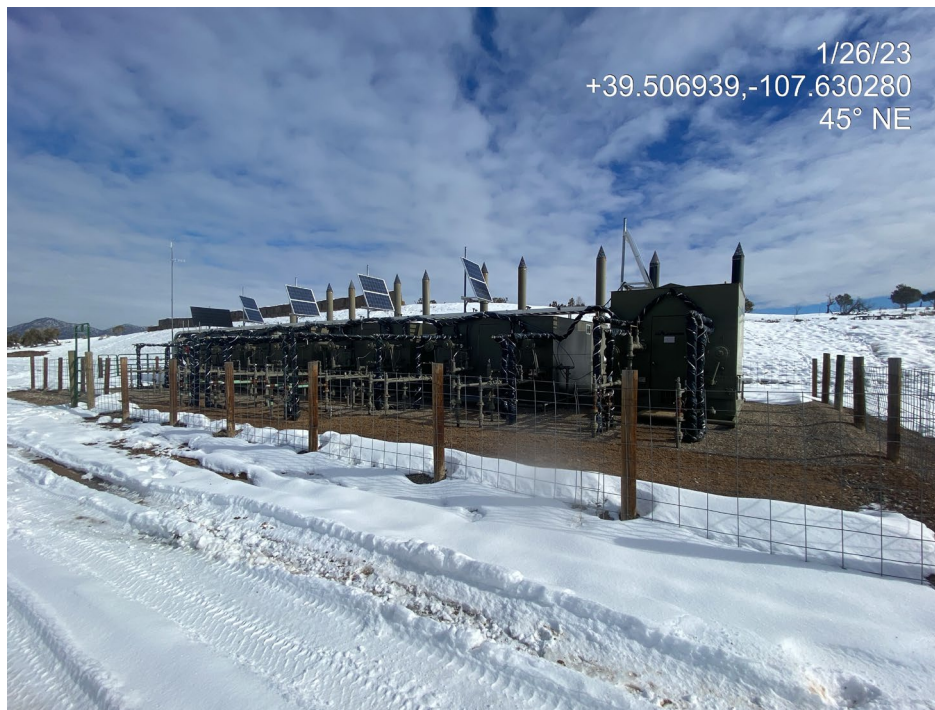
Photo 5. Photos show production areas.