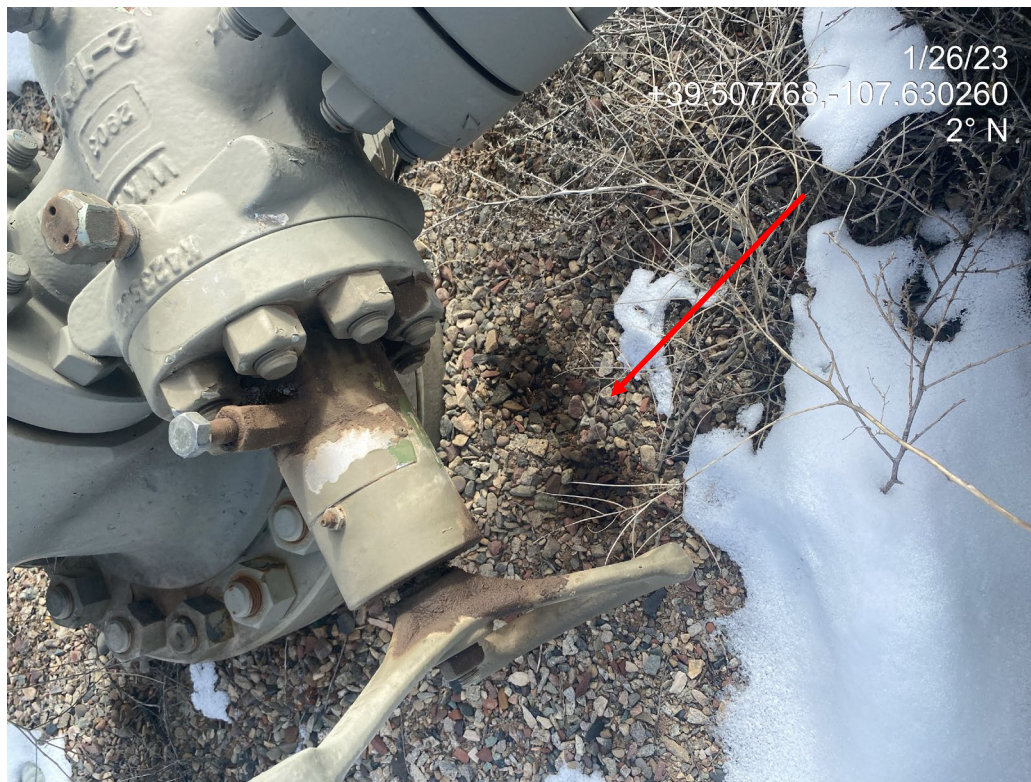
Photo 4. Photos show staining at wellheads.