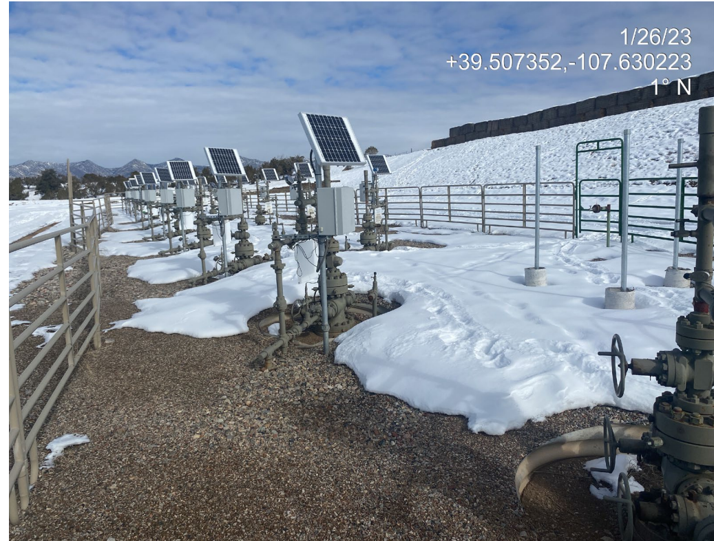
Photo 6. Photos show production areas.