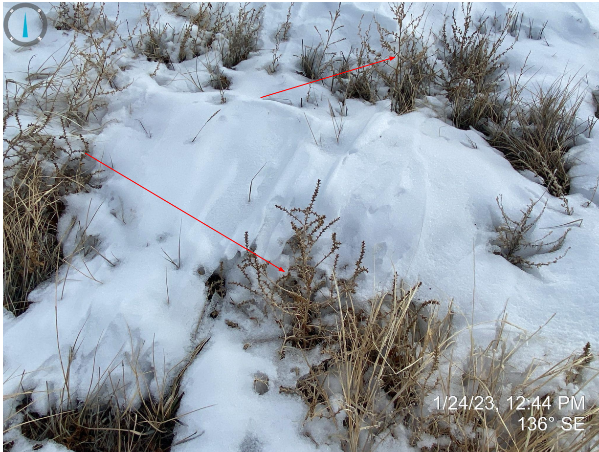
Photo 5. Close up photo of undesirable vegetation (e.g. russian thistle and kochia) that was observed throughout the location.