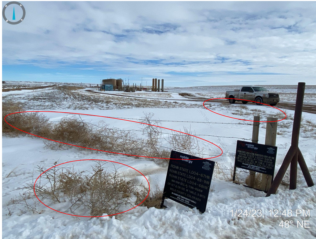
Photo 8. Facing northeast near the location's entrance. See comments in Photos 6 & 7.