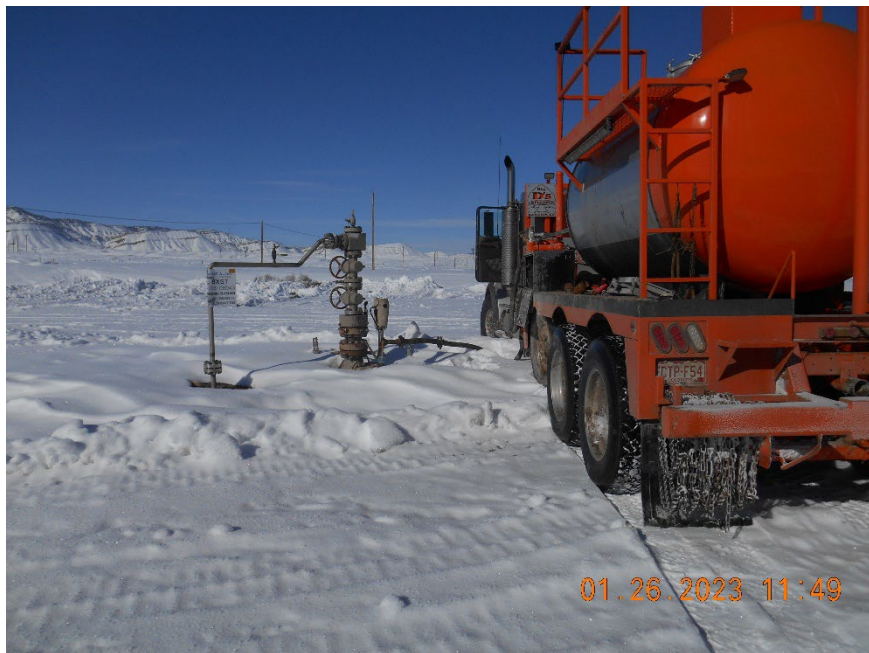
Injection wellhead during MIT