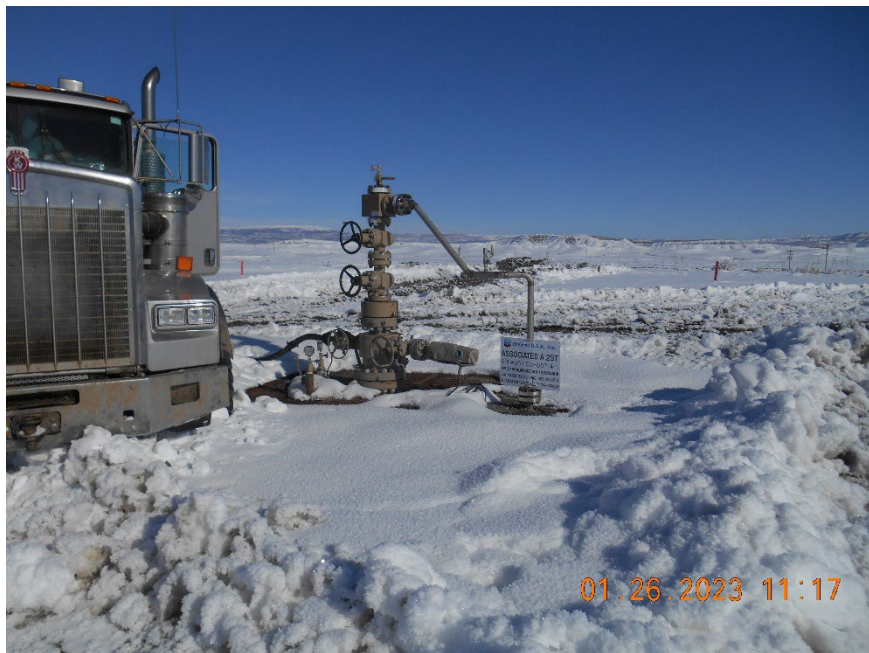
Injection wellhead during MIT