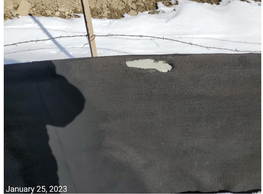
Photo 3: Photos examples showing various holes/tears observed within the secondary containment liner.