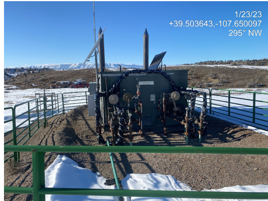
Photo 4. Photos show production areas.