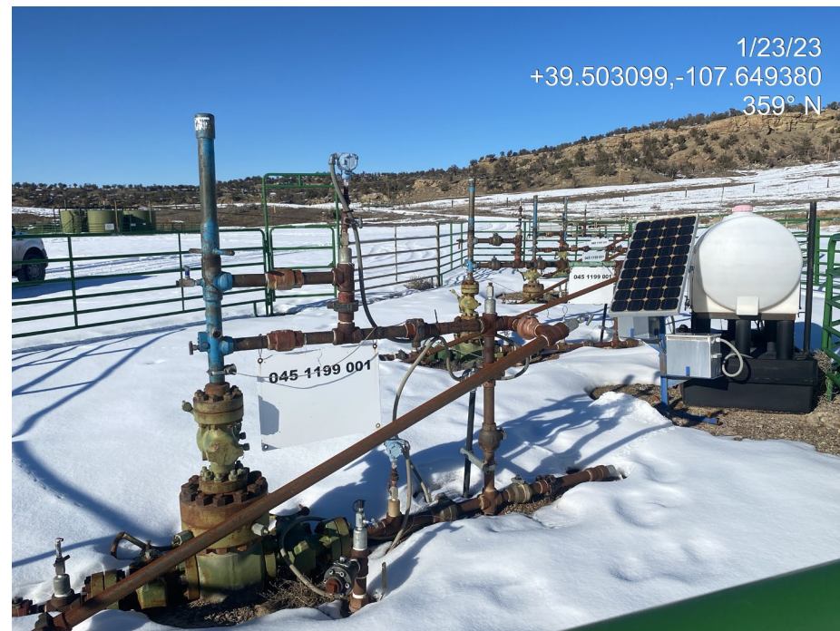
Photo 3. Photos show production areas.