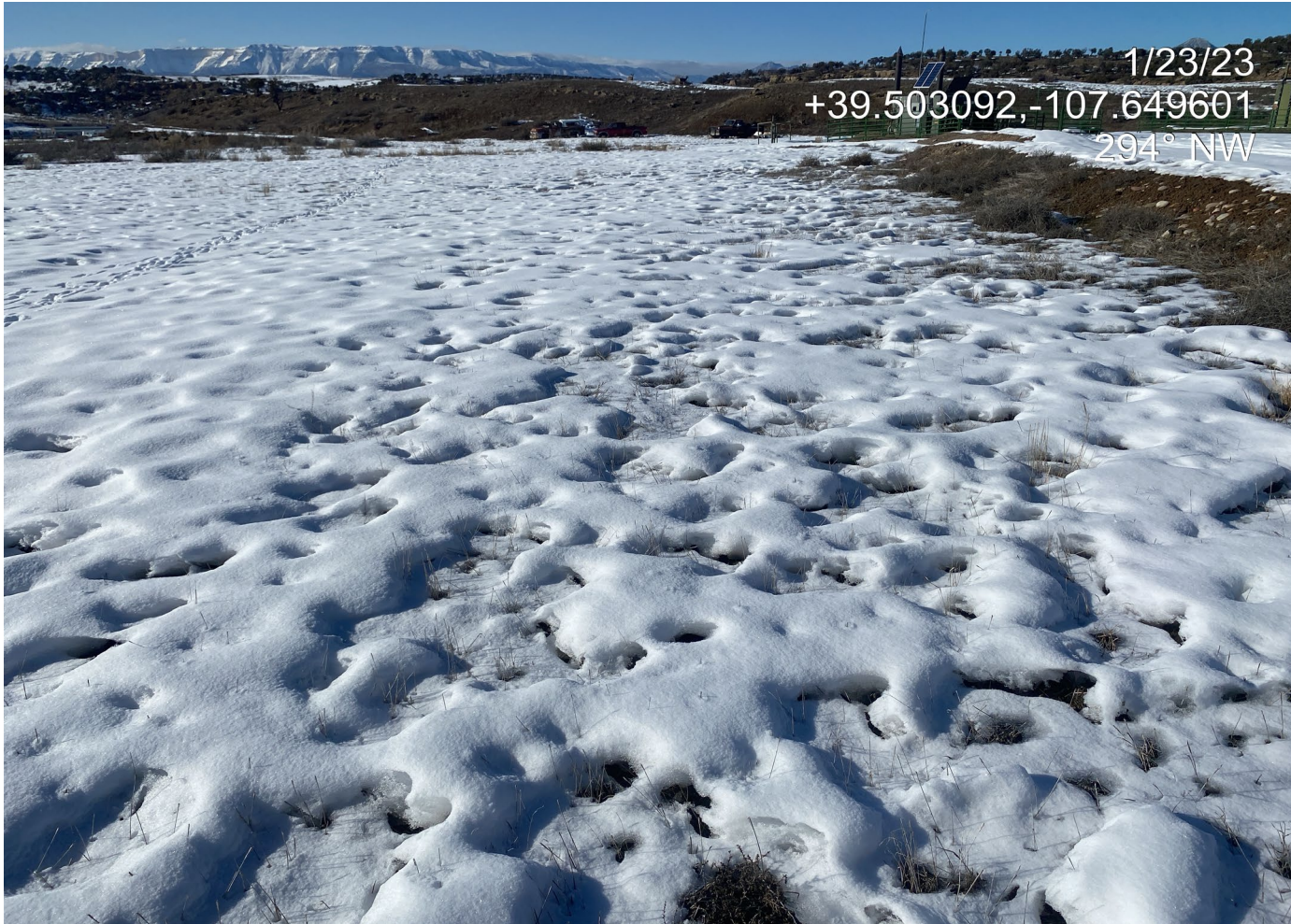
Photo 5. Photos shows the western interim areas. Perennial grasses are not evident.