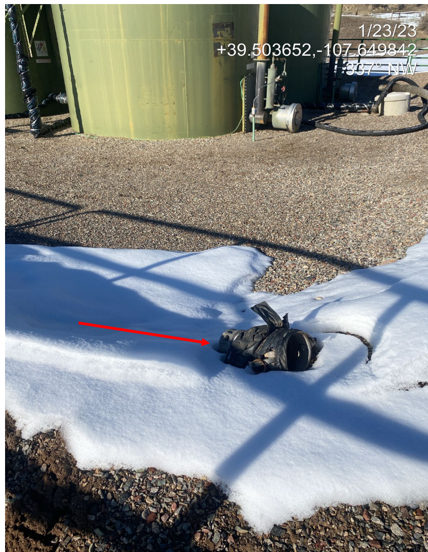
Photo 2. Photos shows debris within the tank battery secondary containment berm.