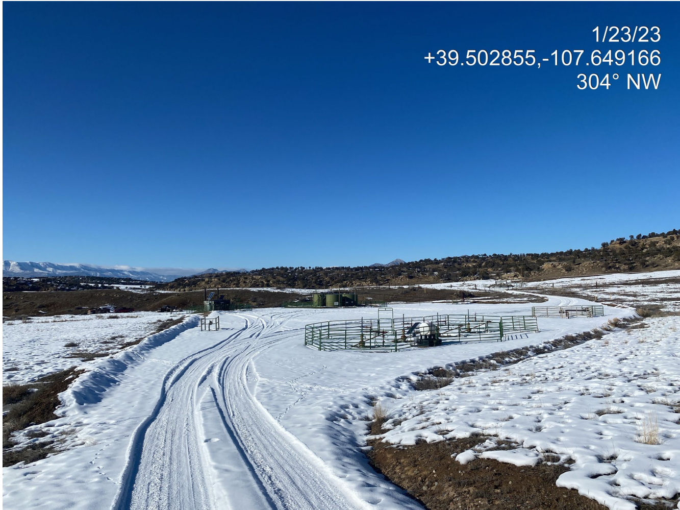
Photo 1. Photo taken from the south shows an overview of the location.