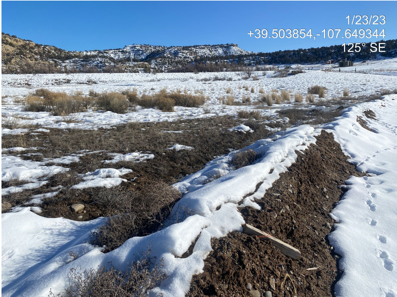
Photo 6. Photos shows the eastern interim areas. Perennial grasses appear scattered.