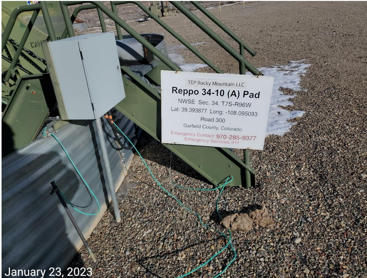
Photo 3: Photo shows signage and the tank battery. Signage missing required information such as Well name(s) and API number(s) associated with the Tank battery.