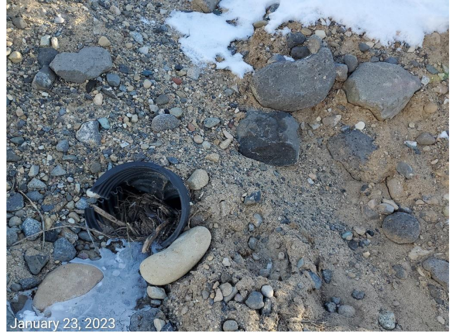
Photo 4: Photo taken from the stormwater outlet on the east end of the Location. Drain pipe appears to have been either crushed, filled with sediment/material, or both, and is no longer allowing for stormwater to discharge from the working pad, resulting in ponding.