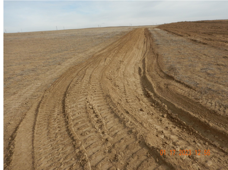
Photo 6. Photo taken from the northwestern location, facing East. Photo illustrates the temporary stormwater ditch and berm BMP and the topsoil stockpile.