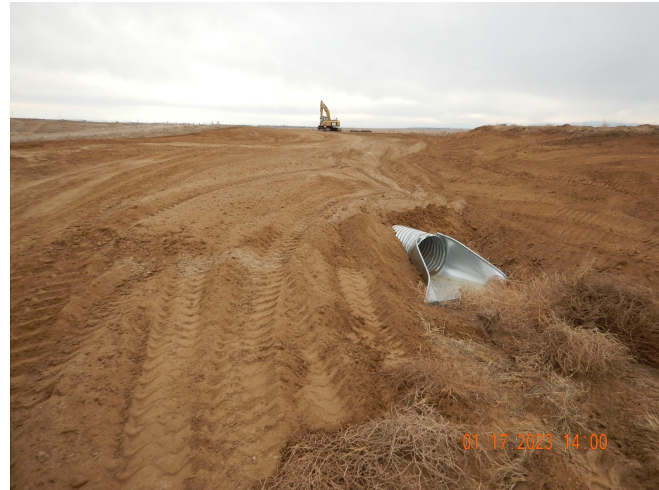
Photo 8. Photo taken from the entrance of the approved access road, facing South. Operator is in process of constructing the access road and completing the culvert installation.