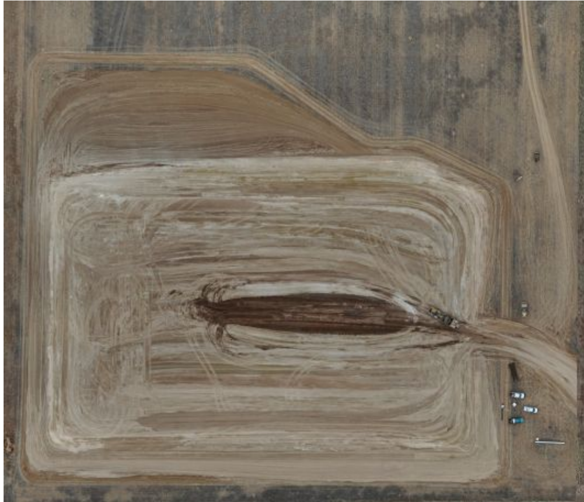
Photo 1. COGCC drone imagery illustrates the location and a disturbance area of 7.95 acres. The stockpile observed in the central location is topsoil from the access road being salvaged. Note- Operator was utilizing a temporary access road north of the location that was not permitted but is owned by Enerplus. See next photo for additional details.