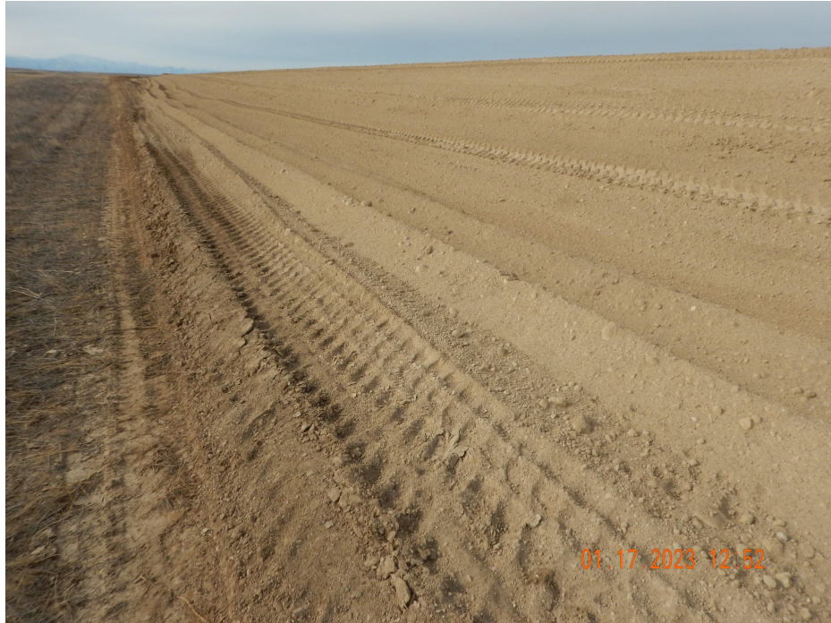
Photo 3. Photo taken from the southern location, facing West. Photo illustrates the fill slope material has filled in the temporary stormwater ditch and berm BMP. Note- Operator appears to be constructing a detention pond or detention berm along the southern location per Weld County standards.