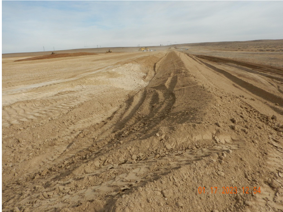
Photo 5. Photo taken from the southwestern location, facing East. Photo illustrates what appears to be the start of construction for the detention pond or detention berm.