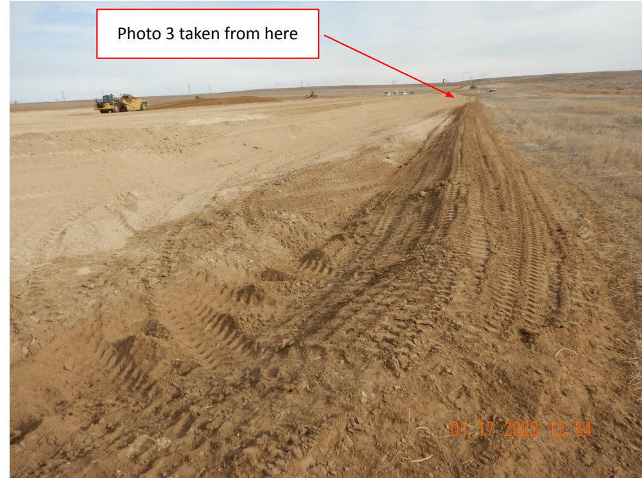
Photo 4. Photo taken from the southwestern location, facing East. Photo illustrates the temporary stormwater ditch and berm BMP without fill slope material.