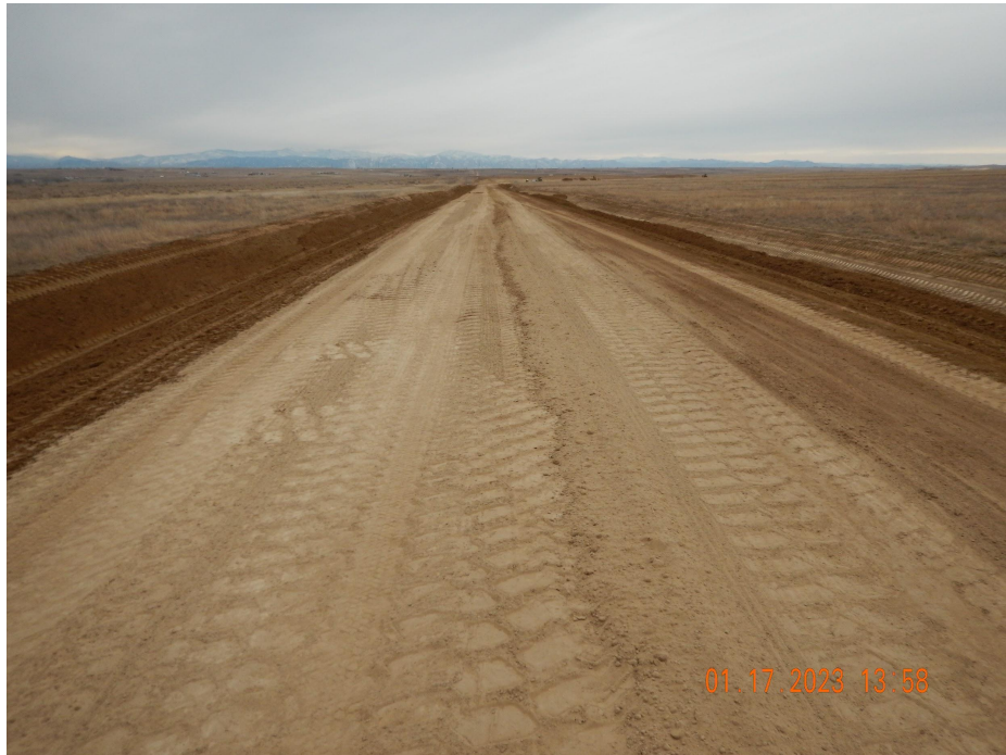
Photo 7. Photo taken from a portion of the access road, facing West. Photo illustrates the Operator is stockpiling/applying topsoil to an approximate depth of 6" along the ditch area of the access road to facilitate final reclamation.