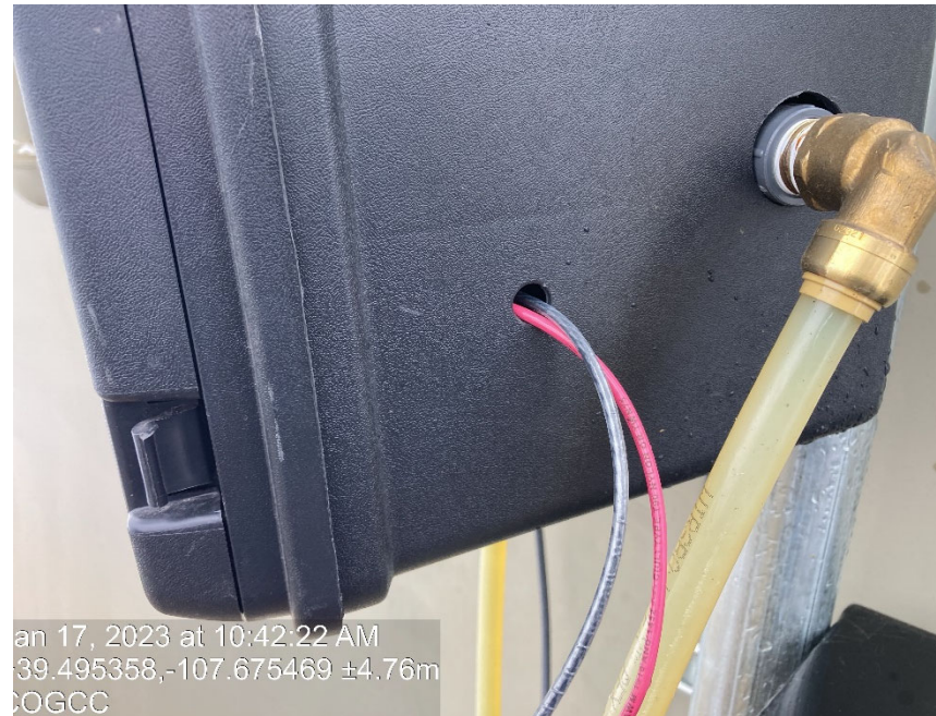
Wires going into box with pump