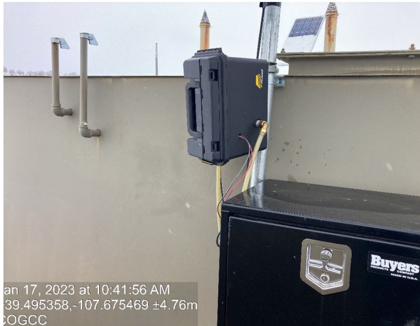
Electric pump and battery box for heat trace mounted on side of separator.