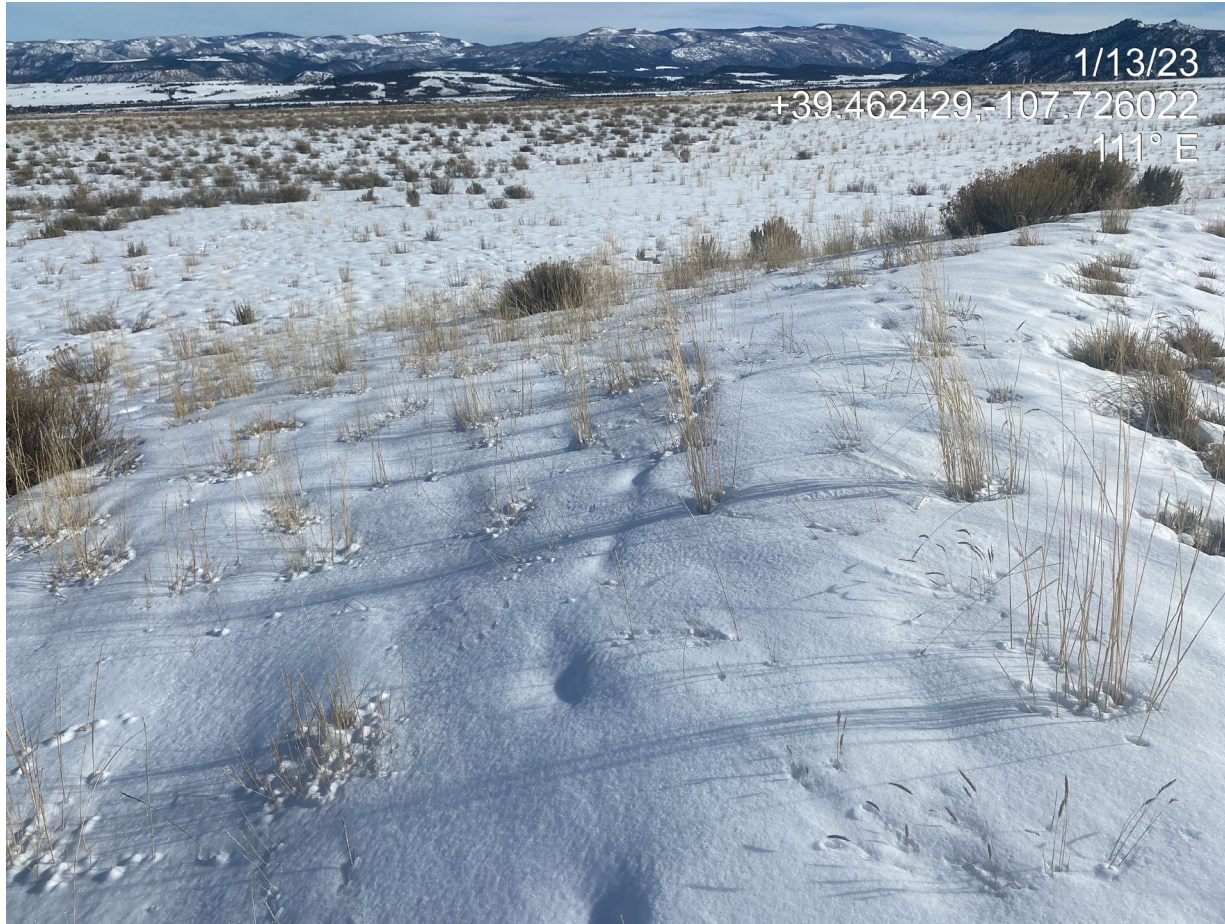
Photo 5. Photo shows an example of location interim areas. Introduced perennial grasses appear established.