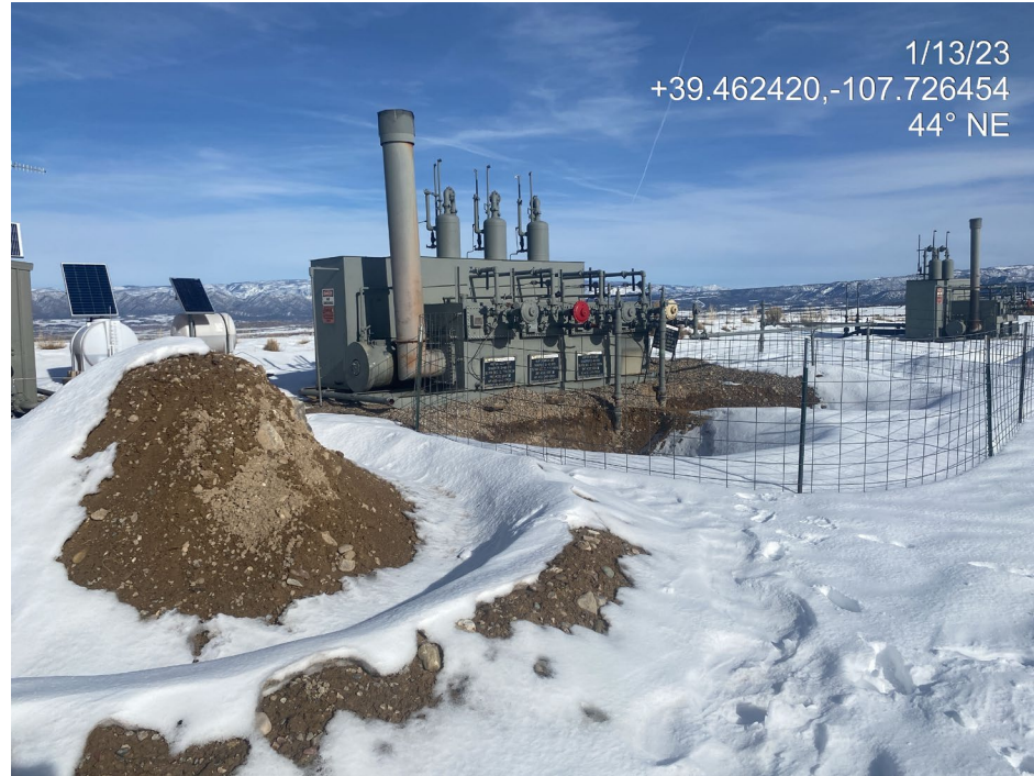
Photo 1. Photos show production areas.