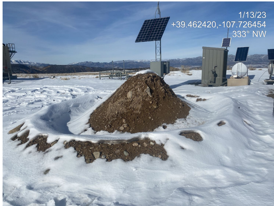
Photo 4. Photos show stockpiled soil associated with plugged and abandoned well API #045-09128 (left) and the associated separator and flowline (right) excavations. Perimeter control berm does not appear properly compacted. Soils are loose, and susceptible to wind and water erosion and may act as a sediment source.