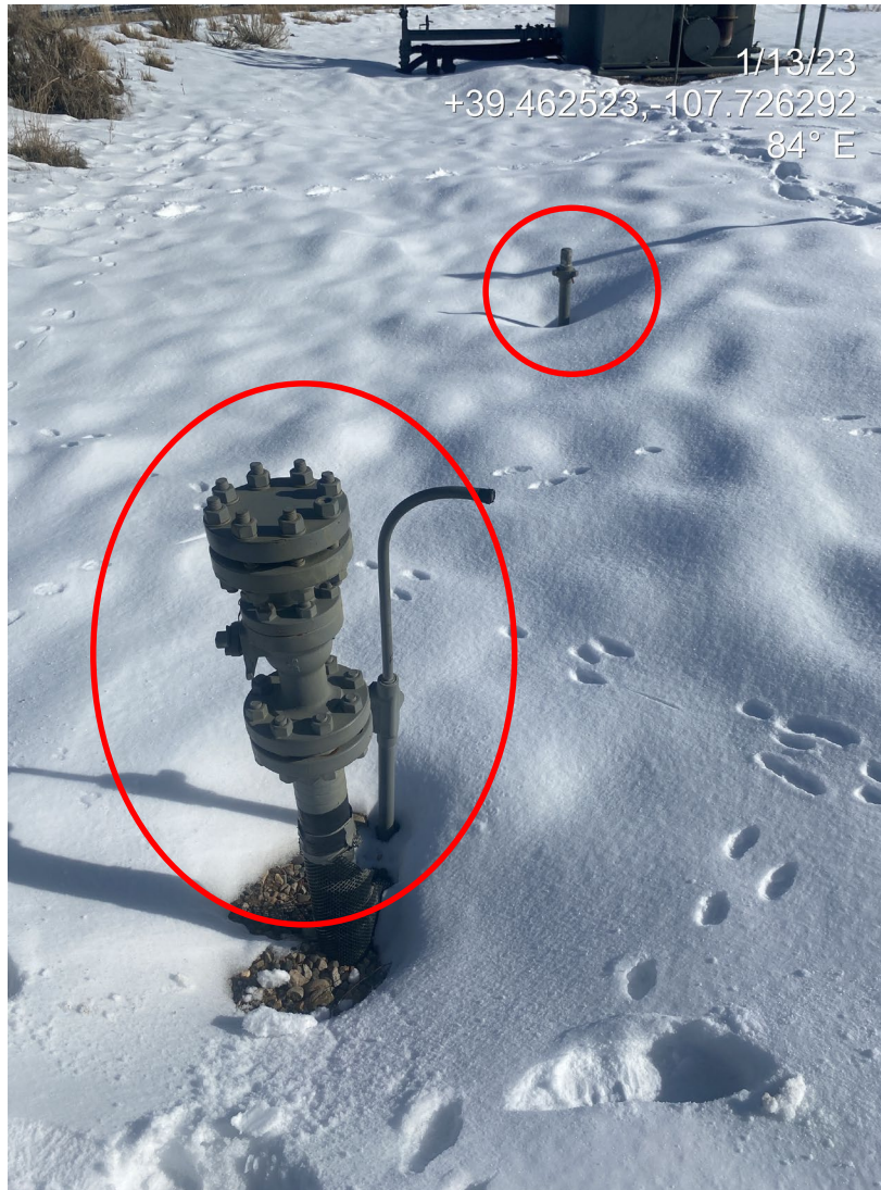
Photo 3. Photo shows two (2) risers which appear to be associated with plugged and abandoned well API #045-10452. Unused equipment must be removed.