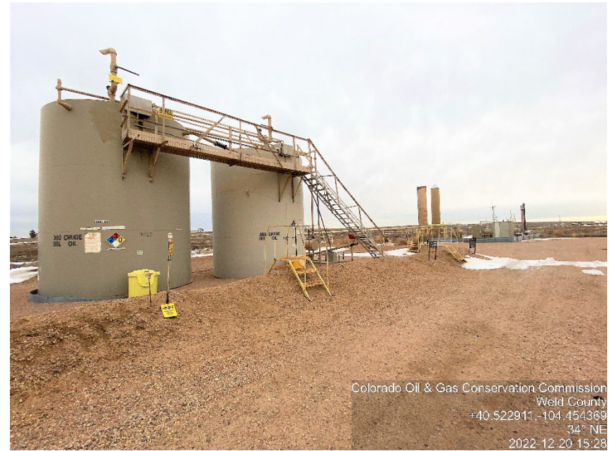
Photo #2 Turman 32-42 Battery site Active Formerly served: Ray 32-44; Plugged & Abandoned | PA prior photo