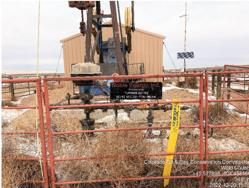
Photo #1 Turman 32-42 (123-24766) Wellsite Producing | PR prior photo