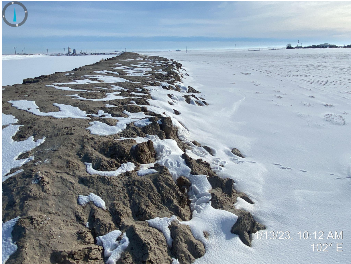
Photo 4. Facing east from the southern pit wall. Photo illustrates unconsolidated material comprising the walls with evidence of rill and gully erosion. Snow cover is obstructing view of adjacent ground and a follow-up inspection will be constructed at a later date to assess site conditions.