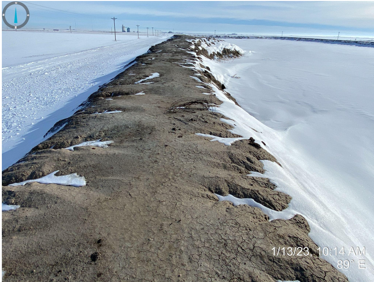
Photo 6 . Facing east from the northern pit wall. Photo illustrates rill and gully erosion occurring on both the interior and exterior walls.