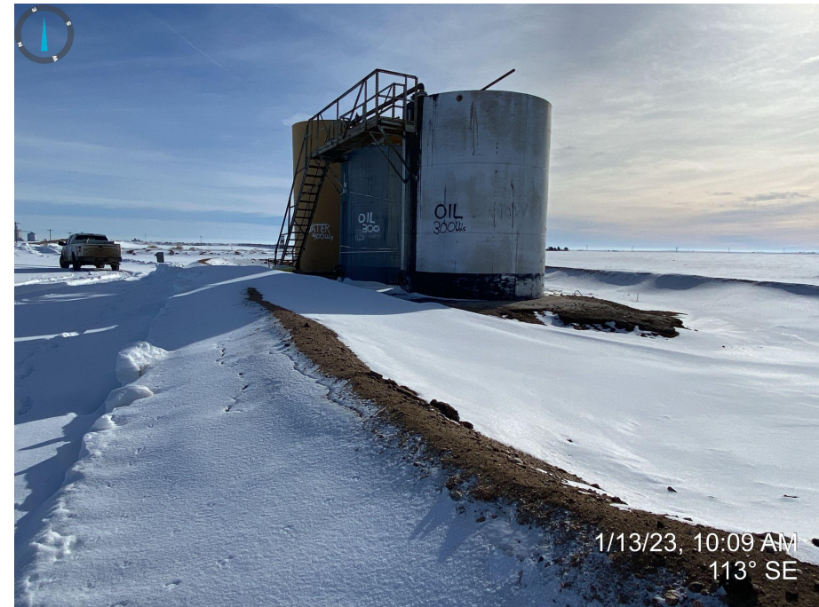
Photos 1 & 2. Facing south and southeast at tank battery. NFPA placards are missing and or not legible.