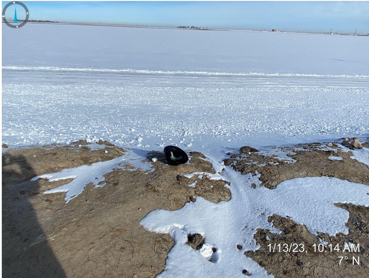
Photo 5. Facing north from the northern pit wall. See comments in Photos 3 & 4.