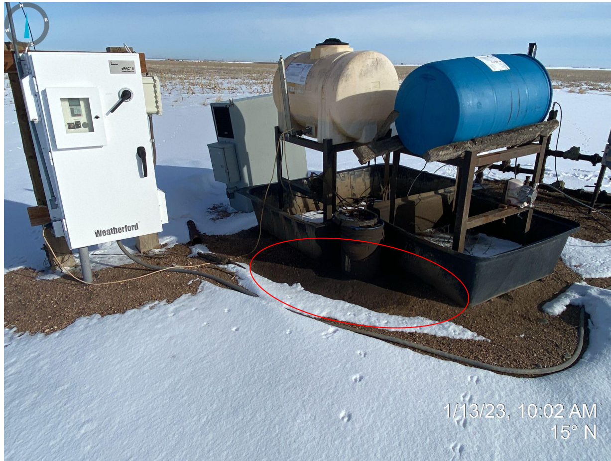
Photo 8. Facing north at wellhead. See comments in Photo 7.

Inspection Photos Location Name: Walters Location ID: 317277