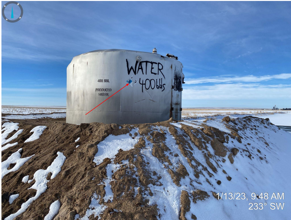
Photo 5. Facing southwest at the produced water tank. NFPA placards are inadequate and need to be replaced/installed.