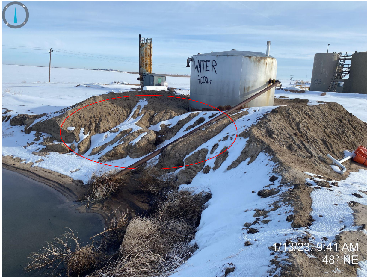
Photo 1. Facing northeast near the produced water tank. Photo illustrates the the western earthen berm has been breached with evidence of rill and gully erosion.