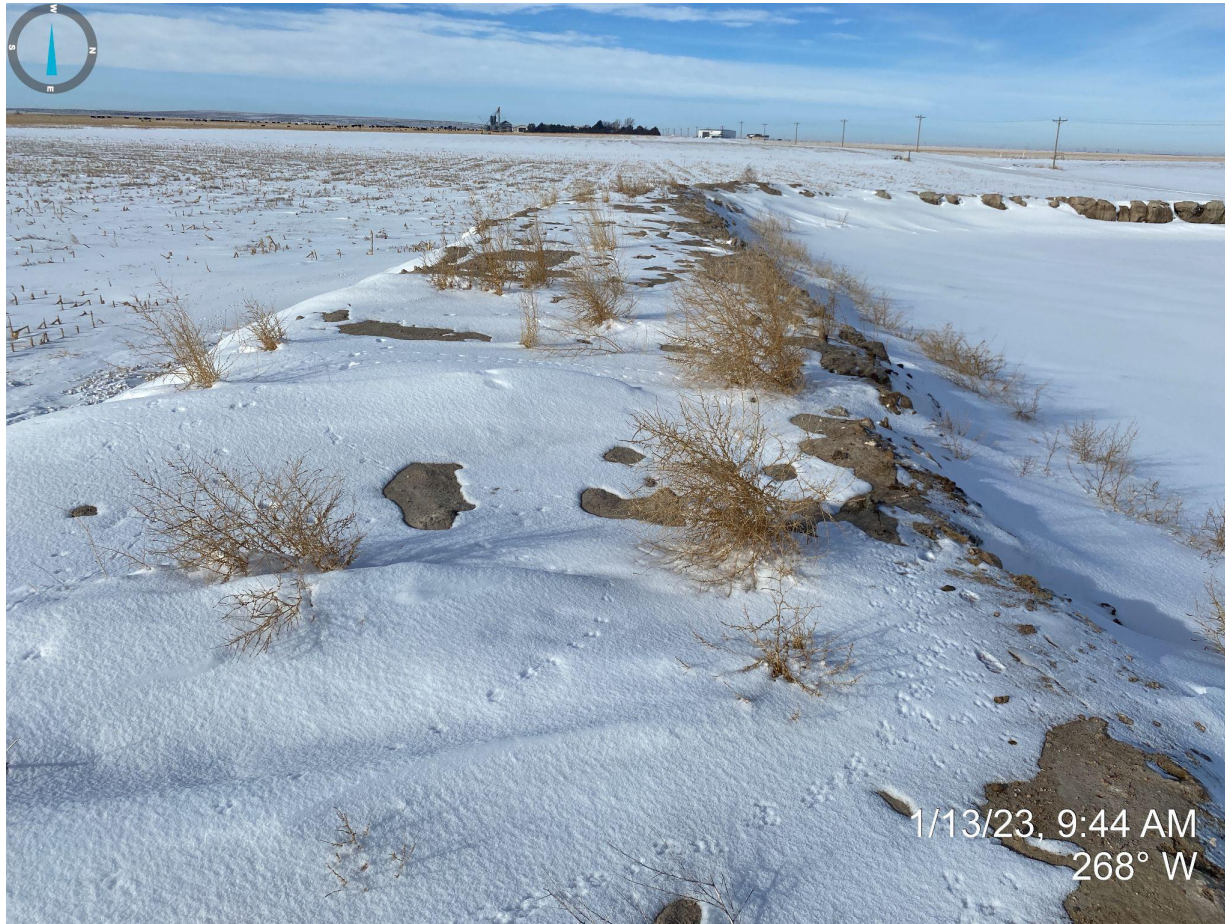
Photo 4. Facing west from the western portion of the pit. Undesirable weedy vegetation was observed throughout the location and needs to be managed as it is now considered debris.