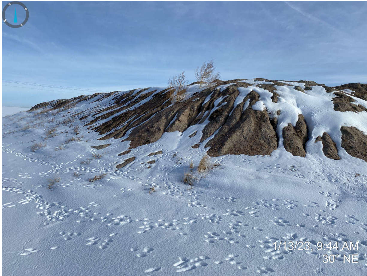
Photo 3. Facing northeast at the southwest corner of the produced water pit. See comments in Photo 2.