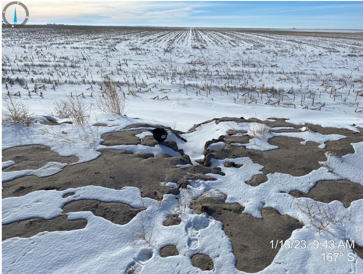
Photo 2. Facing south on the southern pit wall. Photo illustrates gully erosion (approx. 3' wide) on the exterior pit wall. A future inspection will be conducted to evaluate the off-location conditions as snow cover blocked view during this inspection.