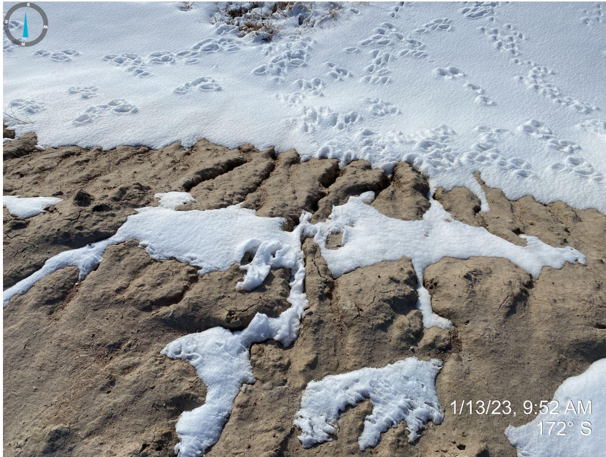
Photo 8. Facing south from the eastern portion of the pit walls. Photo illustrates that the pit walls have evidence of rill erosion. Due to snow cover, it is uncertain whether or not sediment laden stormwater has exited off location. This location will be inspected at a future date to reassess conditions.