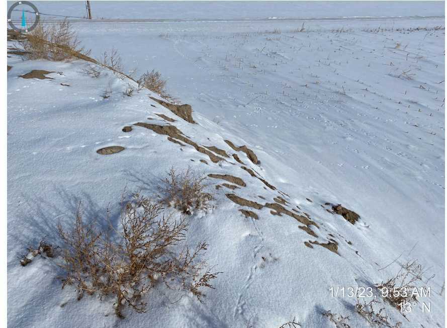
Photos 6 & 7. Facing northeast and north from produced water pits. Undesirable weedy vegetation observed throughout the location; weeds are now considered debris and need to be removed/managed.