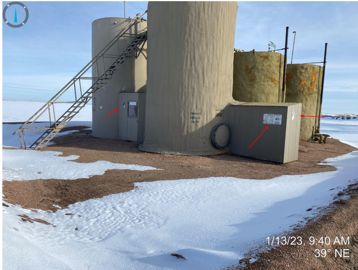
Photo 2. Facing northeast at tank battery. Tank NFPA placards are faded, cracking, and not legible.