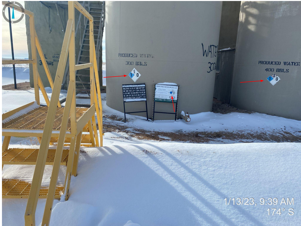
Photo 1. Facing south at tank battery. Tank NFPA placards are faded, cracking, and not legible.