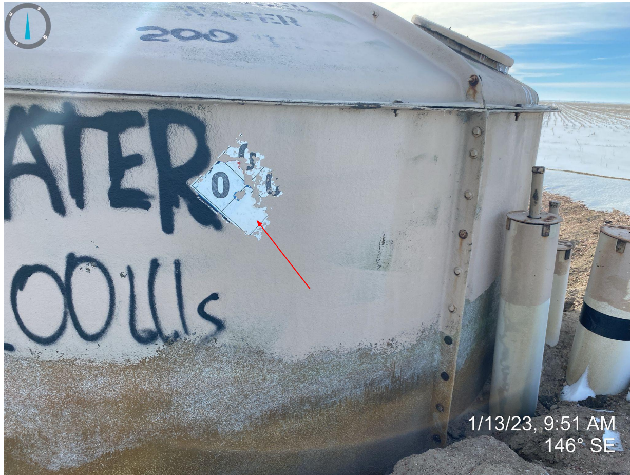
Photo 3. Facing southeast at produced water tank. Tank NFPA placards are faded, cracking, and not legible.