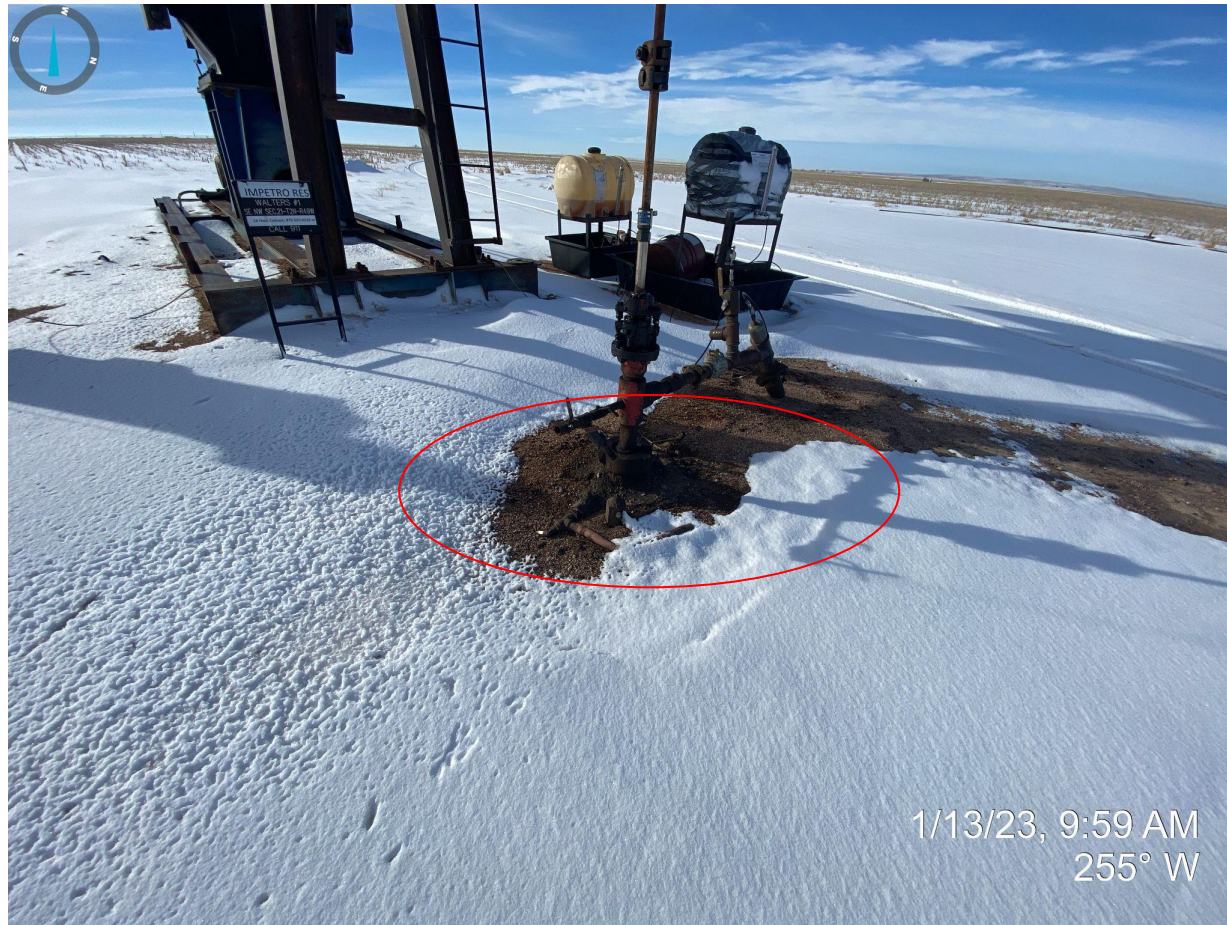
Photo 10. Facing west at the wellhead. Photo illustrates oily stained soil that will need to properly cleaned up.