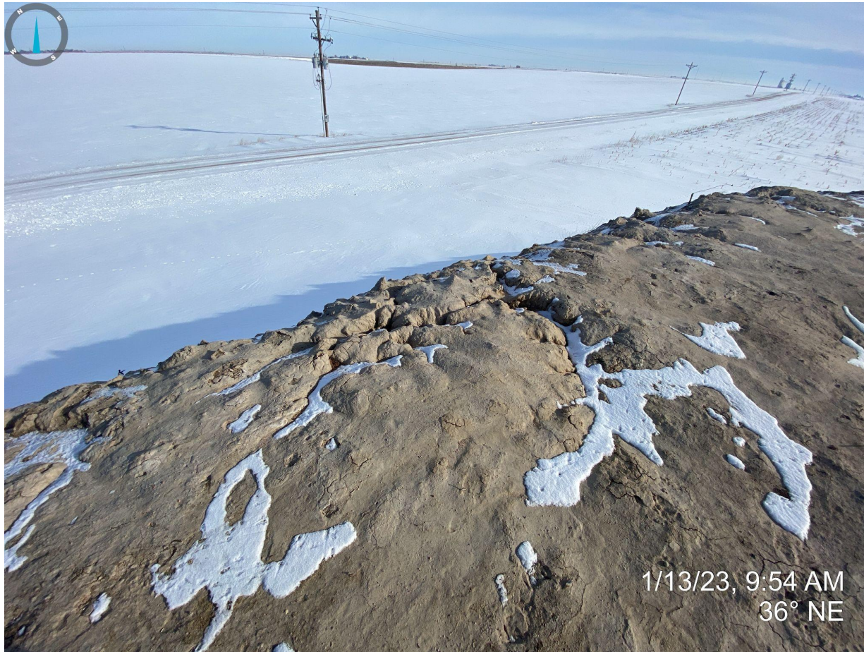
Photo 9. Facing northeast near the northeast corner of the pit. See comments in Photo 8.