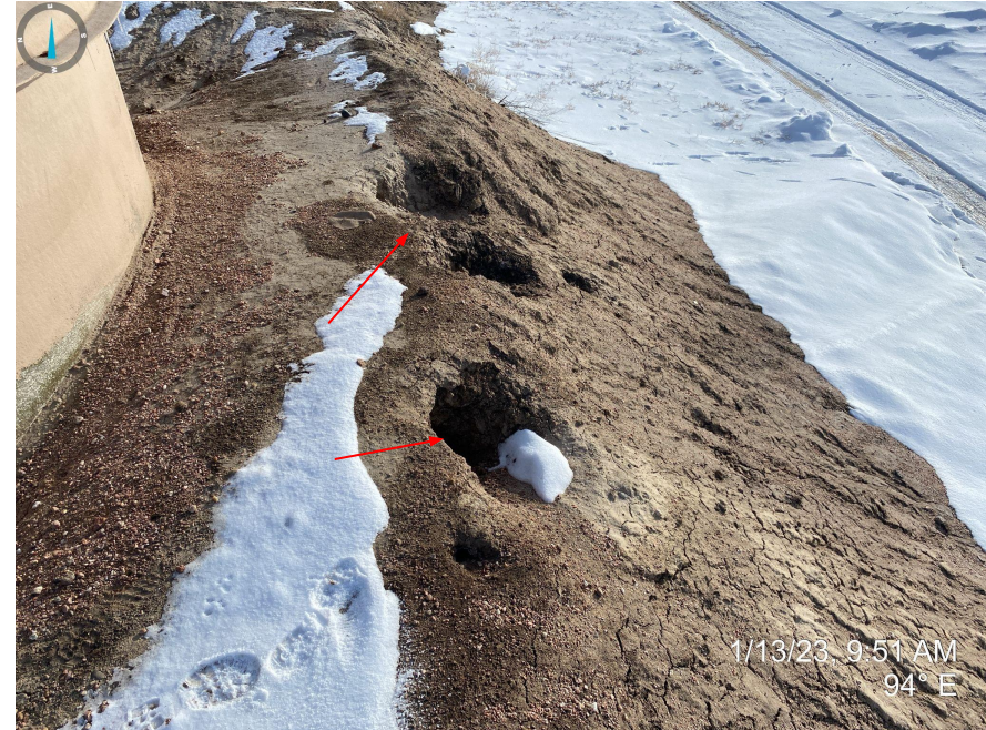
Photos 4 & 5. Facing north and east from the produced water tank. Evidence of rill erosion and animal burrows observed on the earthen berms.