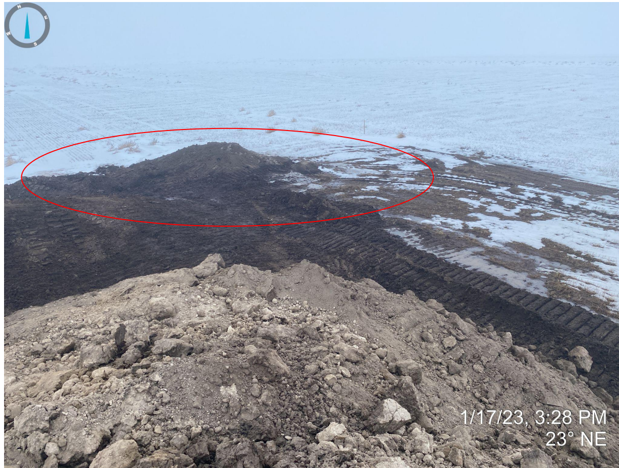
Photo 6. Facing northeast towards the northeast corner of the location. Photo illustrates that portions of the perimeter berm/BMP are comprised of unconsolidated material and not properly stabilized.