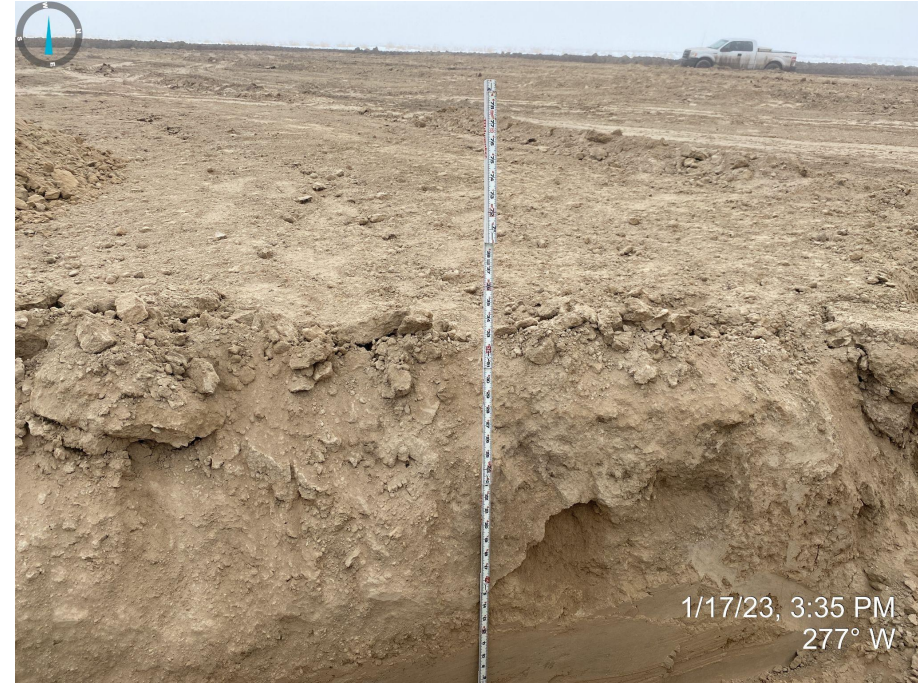
Photo 13 & 14. Photo 13 (left) taken on a 01/13/2023 inspection illustrating that several inches of topsoil remained on location; a corrective action required the operator to remove all topsoil on location. Photo 14 (right) taken 01/17/2023 illustrating that the operator has complied with the corrective action to remove the remainder of the topsoil layer/horizon.