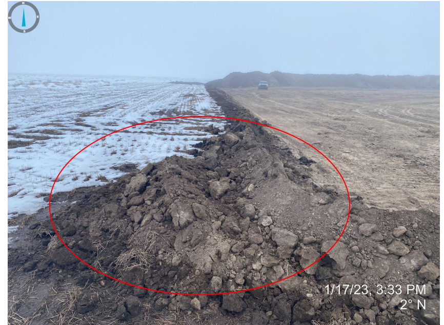
Photos 9 & 10. Facing east (photo 9) and north (photo 10) from the southwestern portion of the location. Photo illustrates that portions of the perimeter berm/BMP are comprised of unconsolidated material and not properly stabilized.