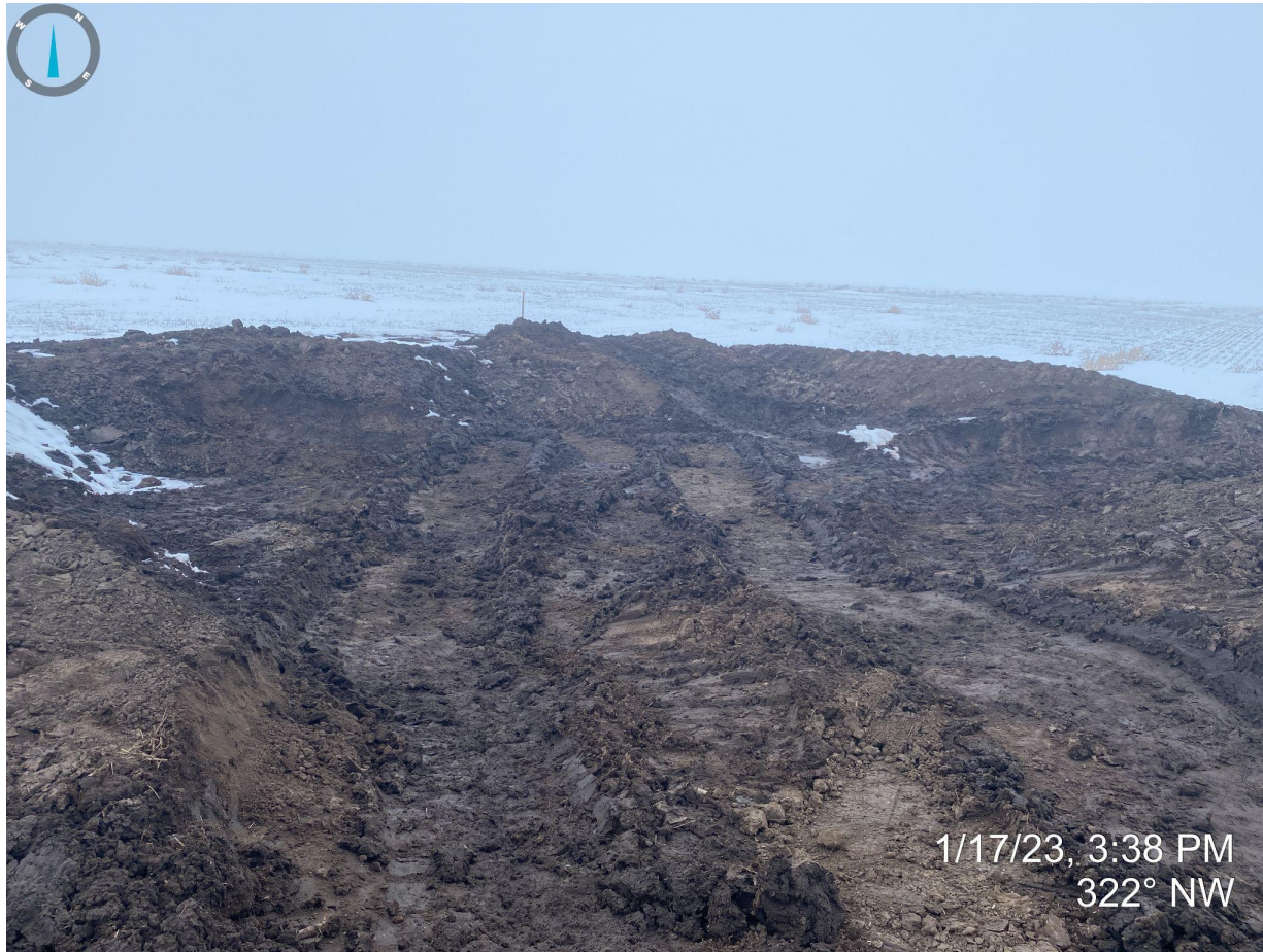
Photo 12. Facing northwest from the northwest corner of the location. Photo illustrates that the sediment trap is comprised of unconsolidated material and is not properly stabilized.