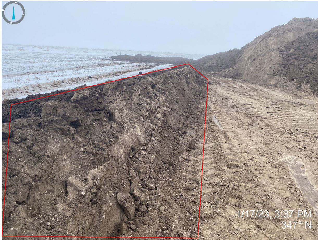
Photo 11. Facing north near the northwest corner of the location. Photo illustrates that portions of the perimeter berm/BMP are comprised of unconsolidated material and not properly stabilized.