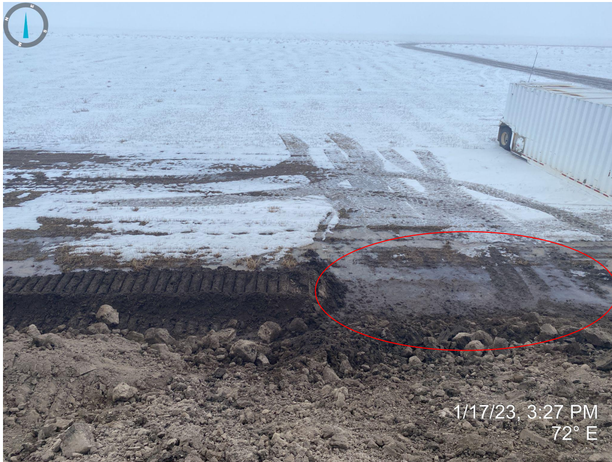
Photo 5. Facing east from the top of the new topsoil stockpile. Photo illustrates (red outline) that part of the perimeter berm has been uninstalled and will need to be re-installed to prevent sediment laden stormwater from exiting off location.