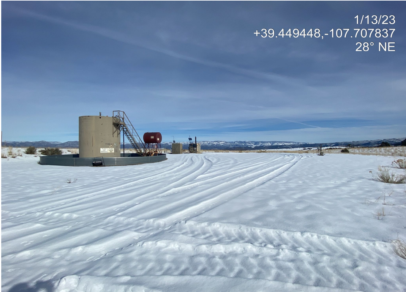
Photo 1. Photo taken from the west shows an overview of the location.