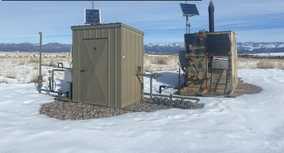
Photo 2. Photos show production areas.