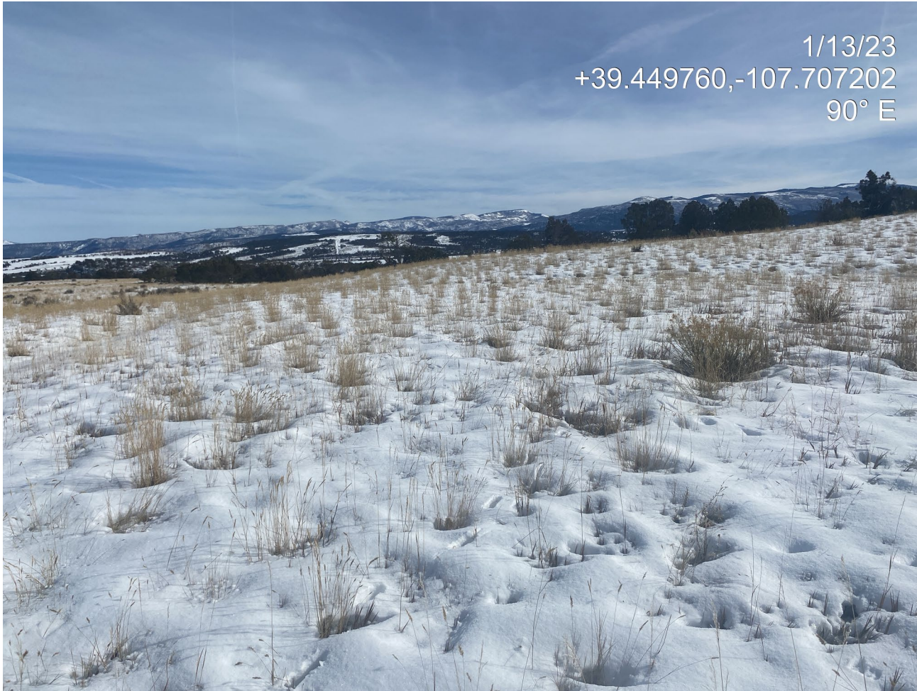
Photo 3. Photo shows an example of location interim areas. Introduced perennial grasses appear established.