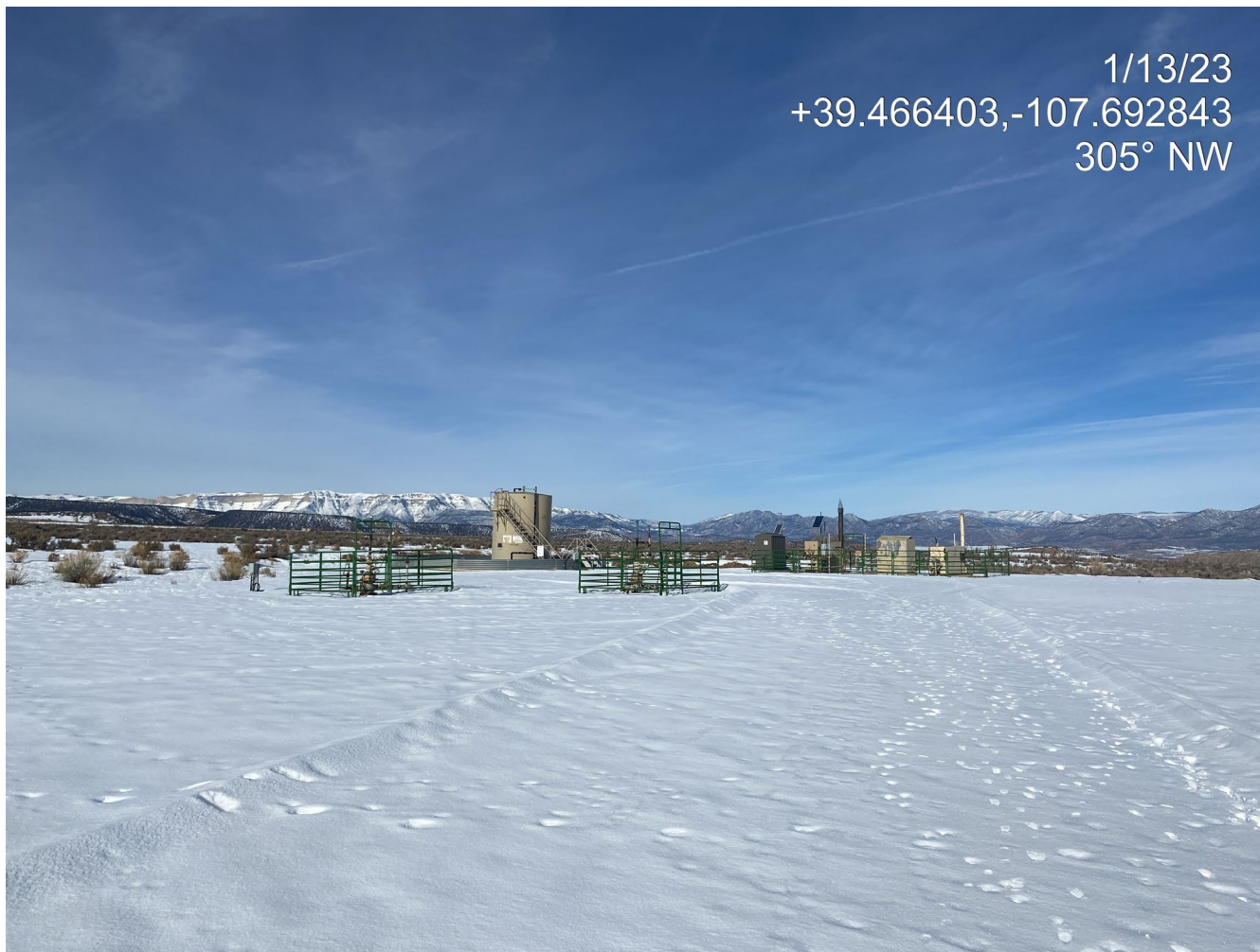
Photo 1. Photo taken from the south shows an overview of the location.