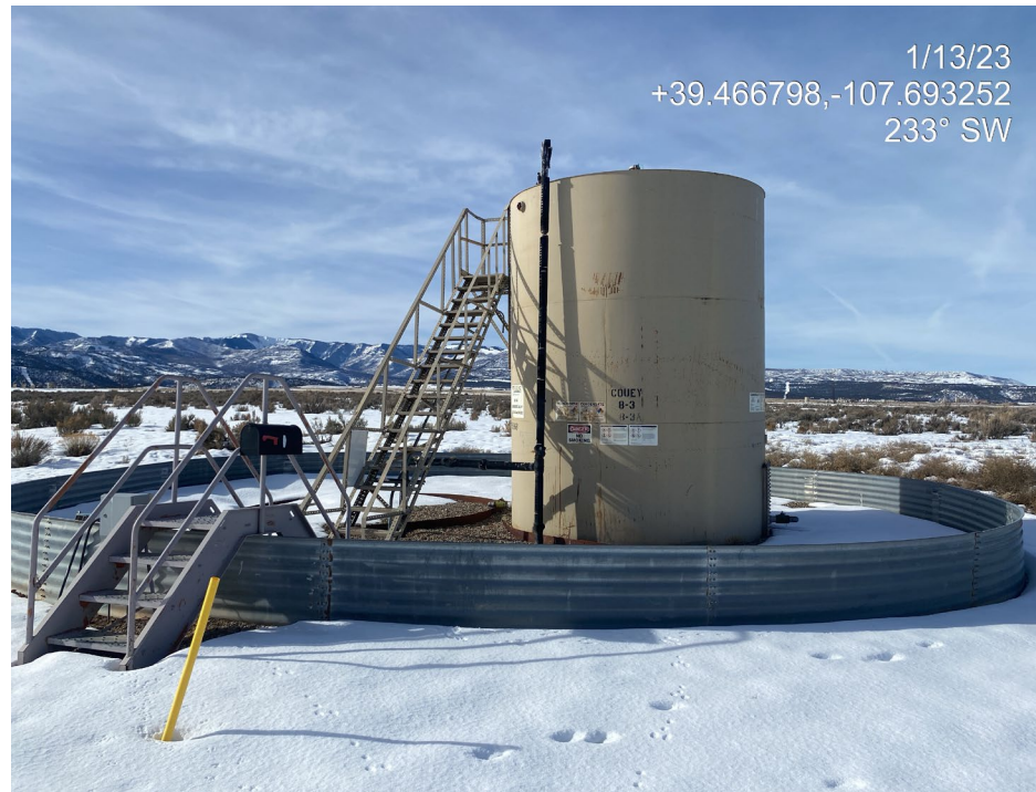
Photo 2. Photos show production areas. A tank battery sign is absent (right).