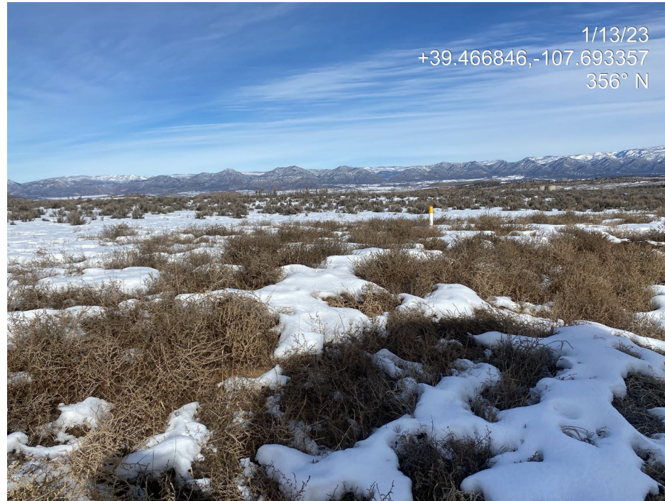
Photo 3. Photos show examples of location interim areas. Sagebrush appears established in portions of the interim areas. Perennial herbaceous understory is not evident. Portions of the location appear to have either high establishment or debris accumulation of Russian thistle (annual, undesirable plant species).