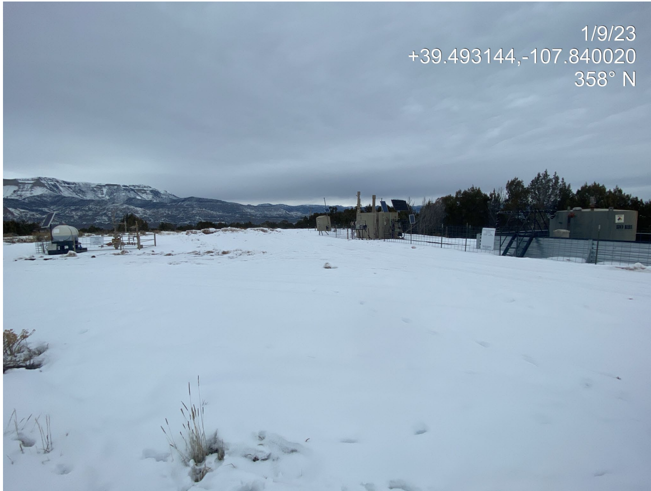
Photo 1. Photo taken from the south shows an overview of the location.