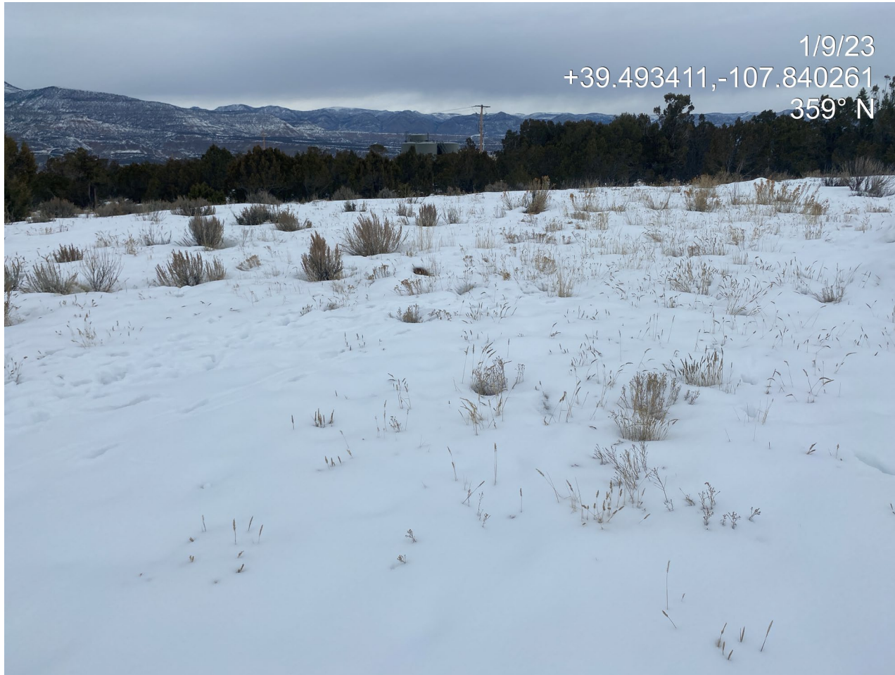
Photo 3. Photo shows interim areas appear vegetated with perennial grasses and occasional shrubs.