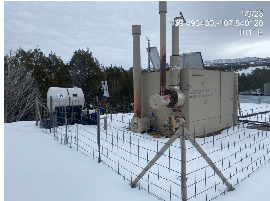
Photo 2. Photos show production areas.