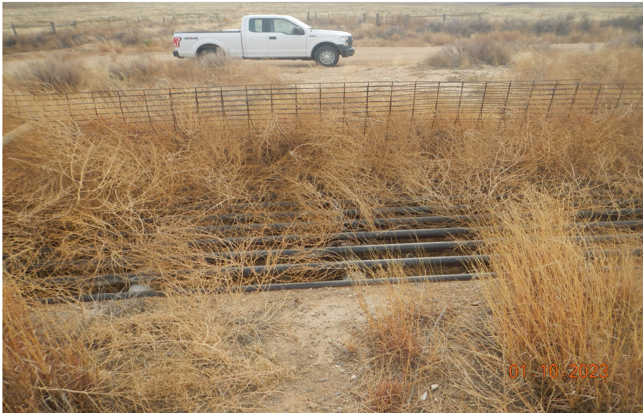
Photo 2. The cattleguard needs to be removed and fence put back to original position.