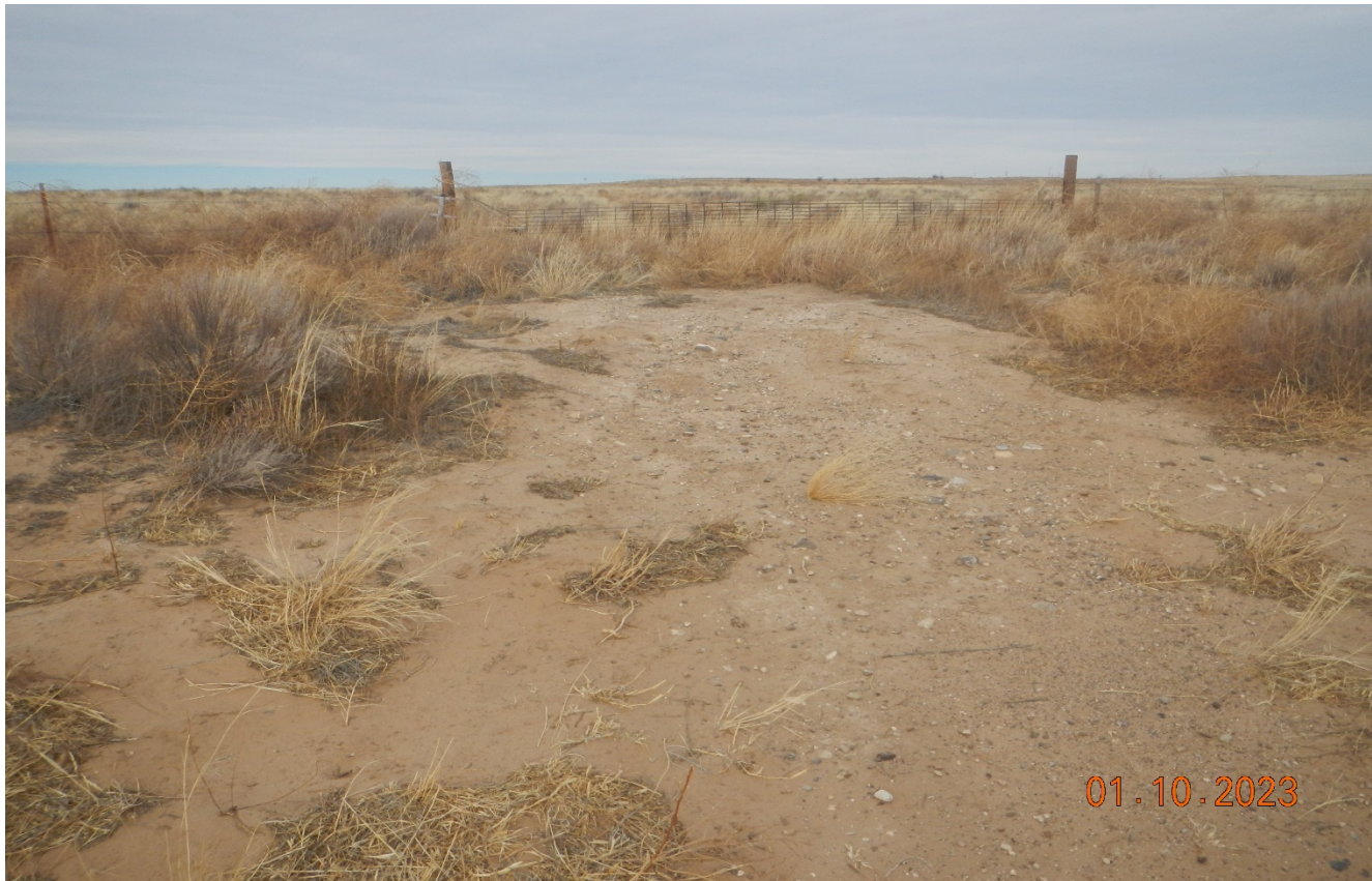
Photo 1. Facing north at the beginning of the access road which has not been reclaimed and the cattle guard remains.