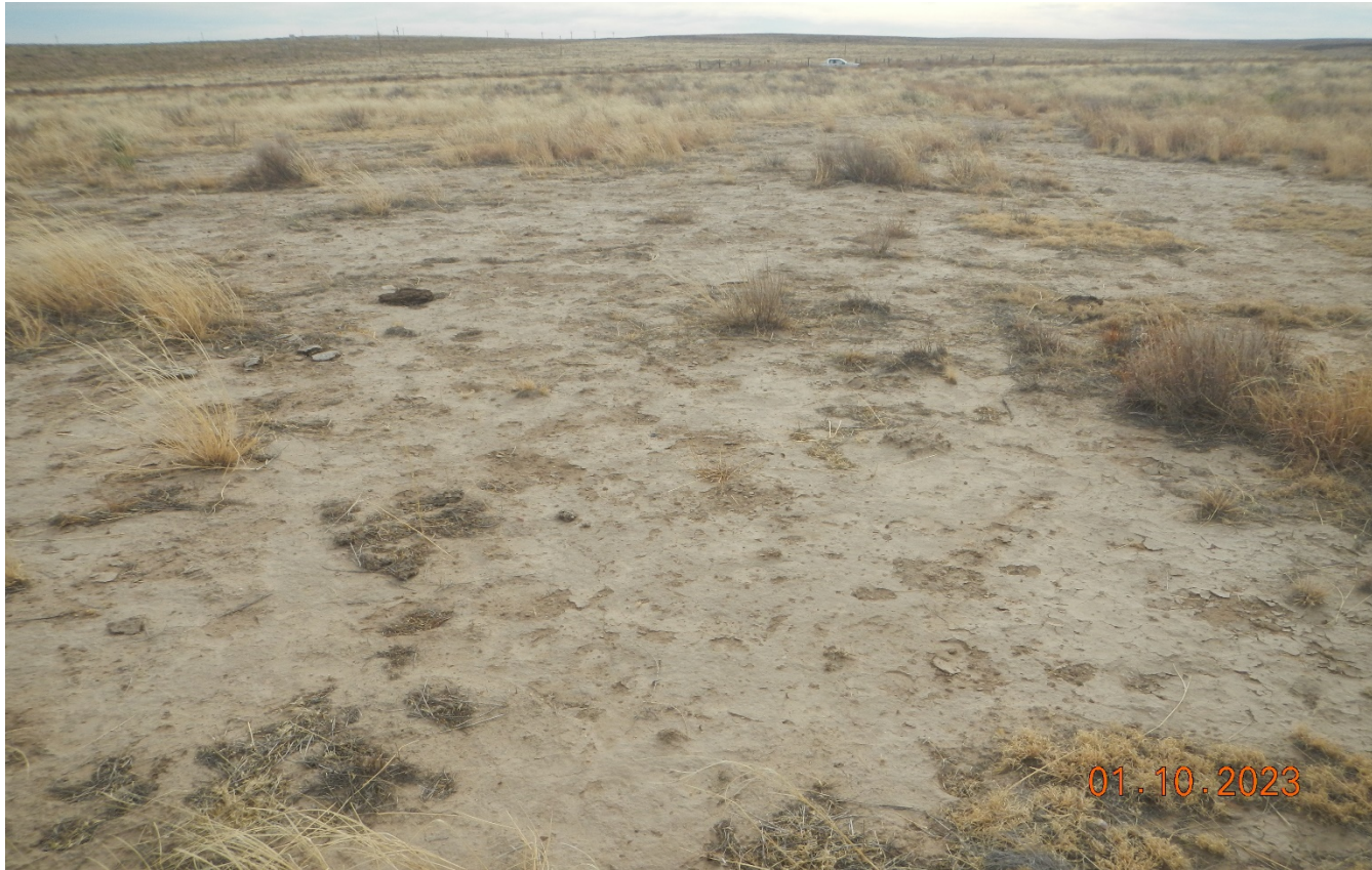
Photo 5. Facing south at the location. There are areas of sparse vegetation and soils seem to be compacted.