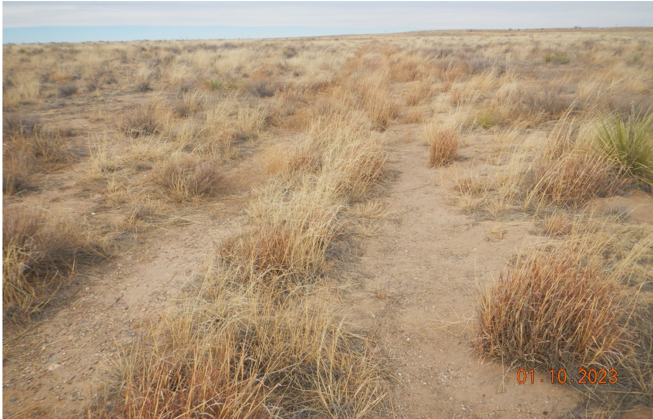
Photo 3. Facing north along the former access road.