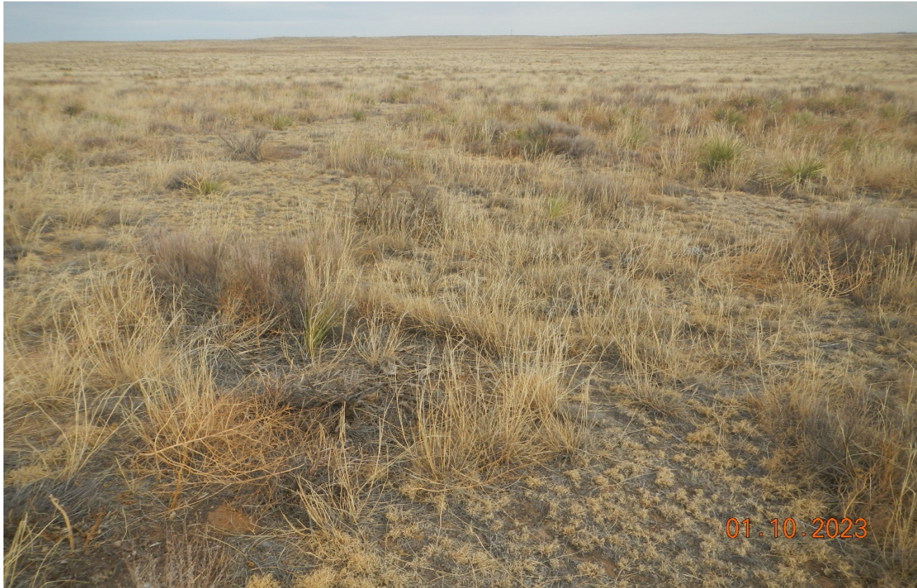
Photo 6. Facing east toward the surrounding undisturbed reference area.