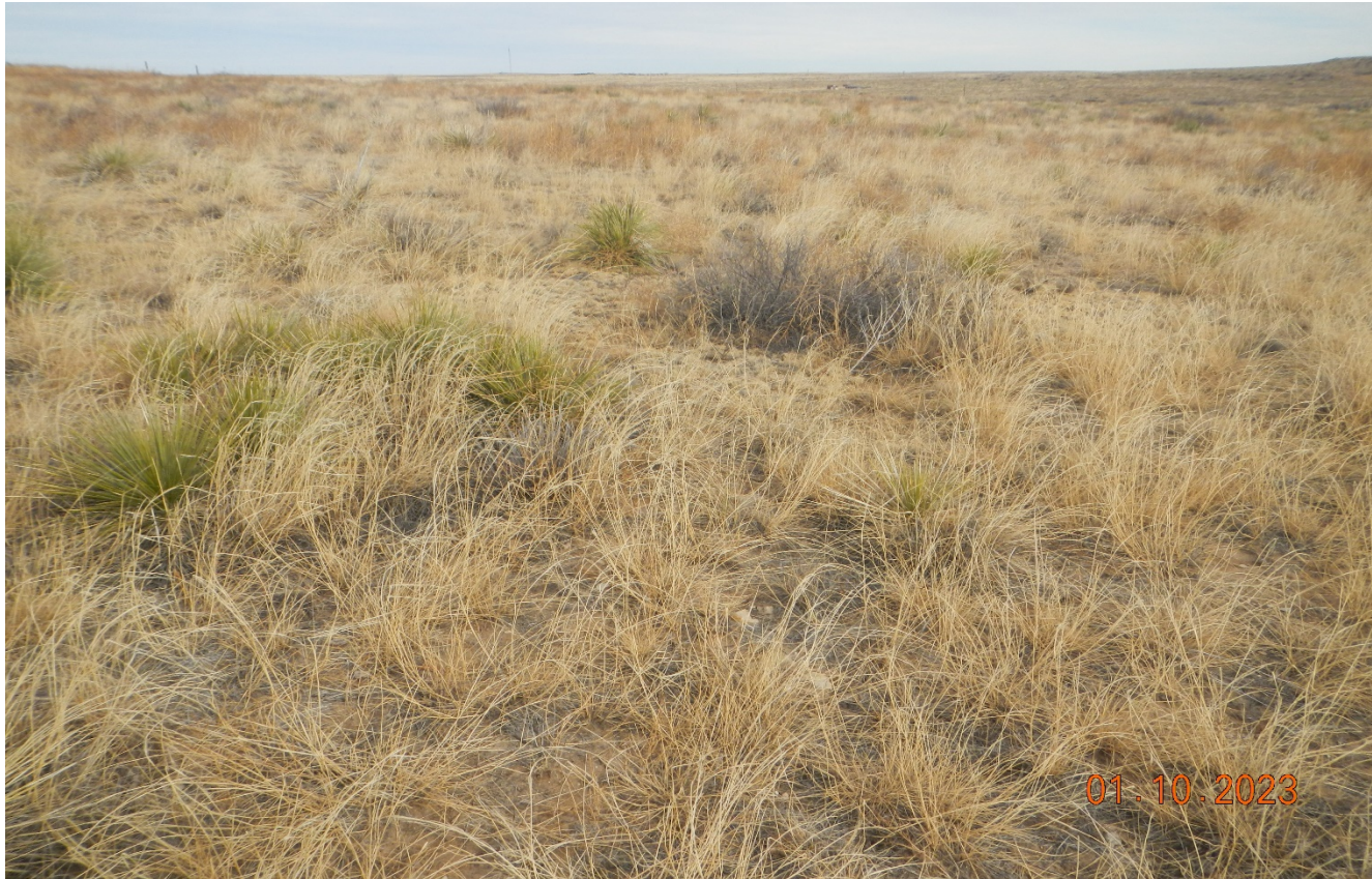
Photo 6. Facing toward the surrounding undisturbed reference area which consists of Blue grama, Sand dropseed, Prairie threeawn, among other native species.