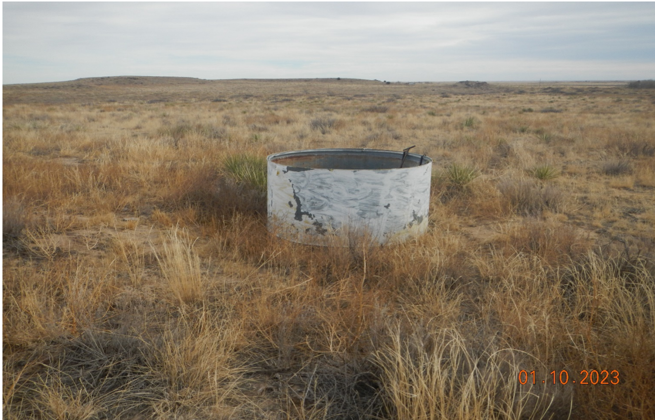
Photo 2. Facing northeast near the location. There is cellar with pipeline valves northeast of the location that may have been associated with the well.