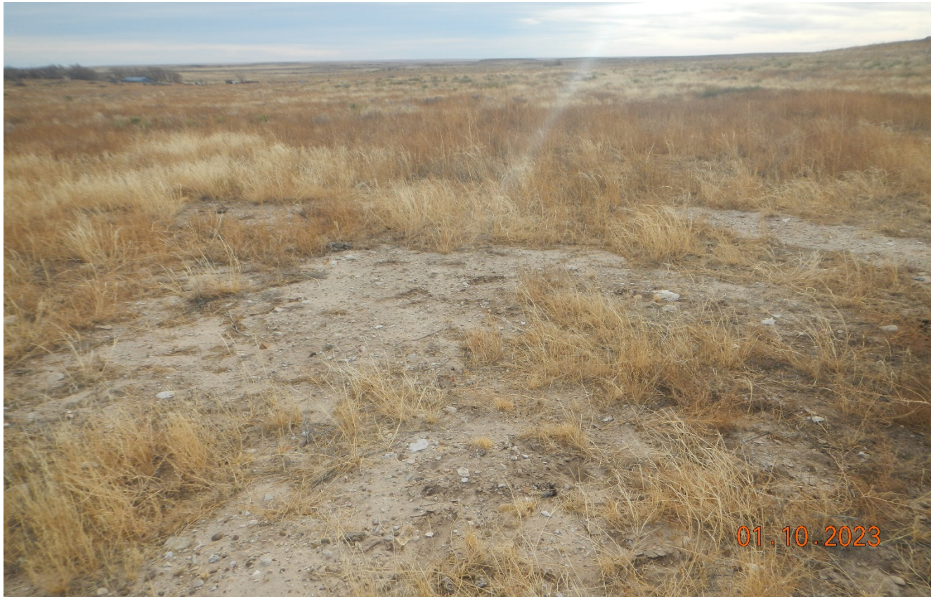
Photo 3. Facing south at the location. The location has not been reclaimed.