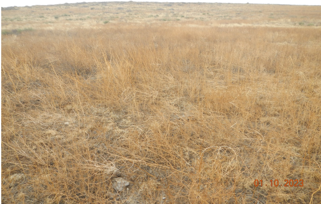
Photo 4. Facing west at the south side of the location. This area consists mostly of undesirable weeds (Russian thistle, Kochia).