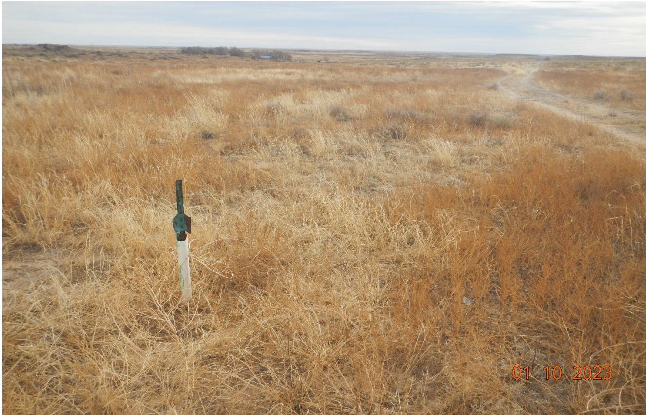
Photo 1. Facing southeast toward the location. There is a white pvc pipe extending out of the ground at the north side of the location..