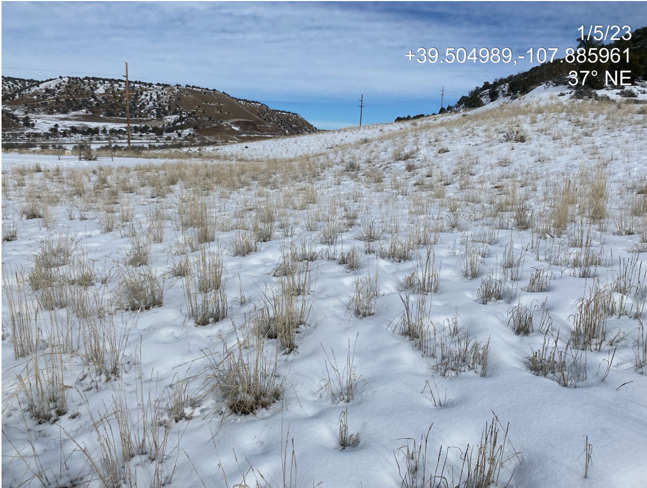
Photo 4. Photo shows an example of the interim areas. Introduced perennial grasses appear established.