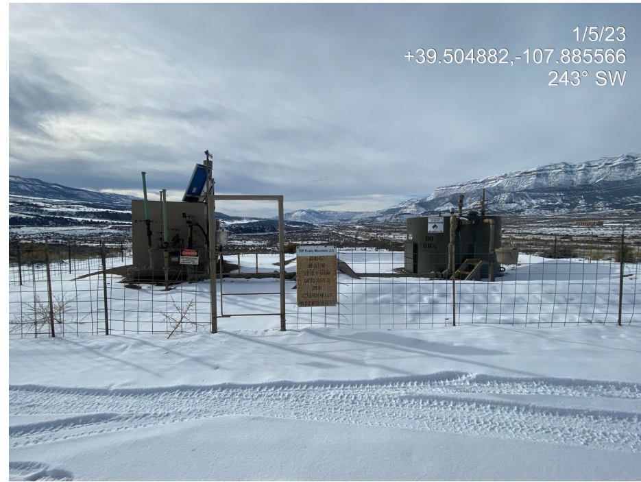
Photo 2. Photos show equipment areas.