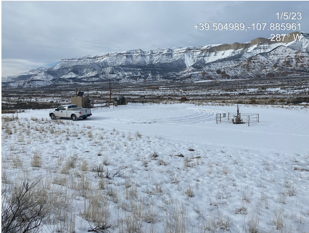
Photo 1. Photo taken from the south shows an overview of the location.