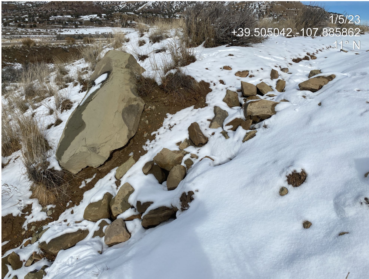
Photo 3. Photo shows the armored stormwater ditch at the northwest.

Inspection Photos Location Name: CLOUGH-66S94W/21SESE Location ID: 323917