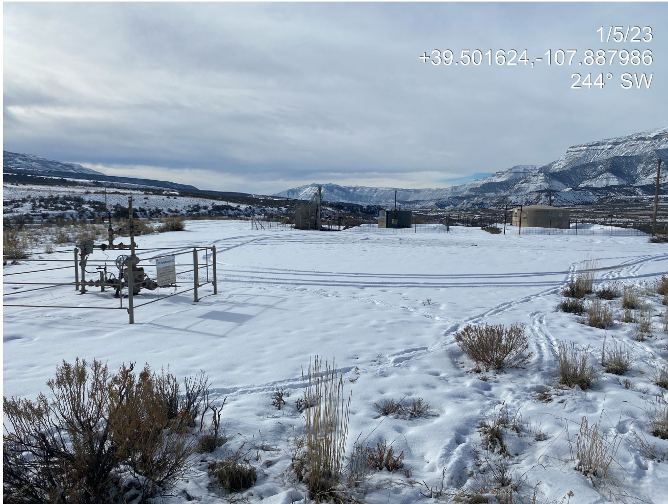
Photo 1. Photo taken from the east shows an overview of the location.