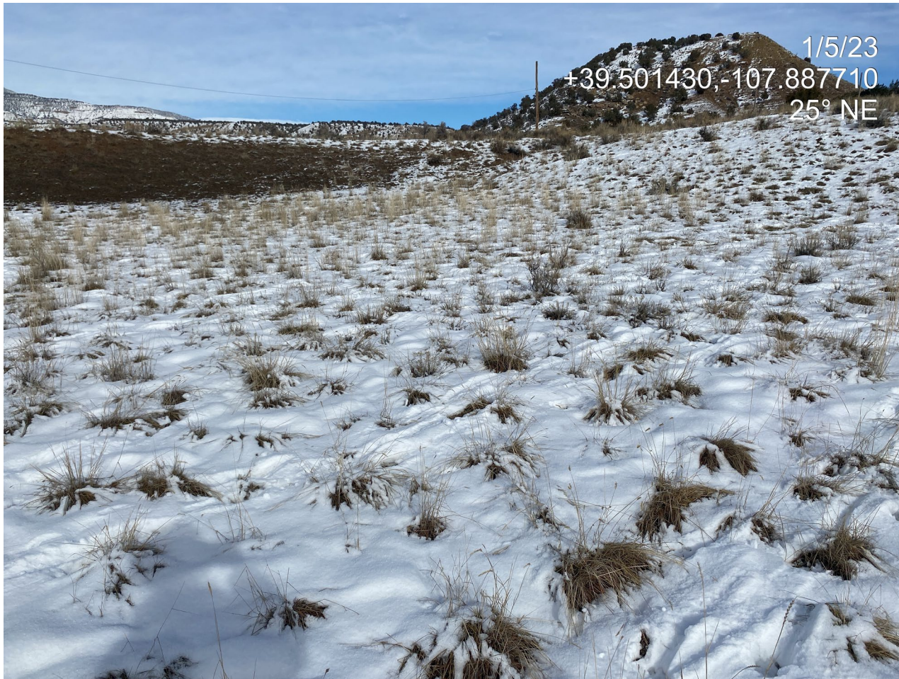
Photo 4. Photo shows an example of the interim areas. Introduced perennial grasses appear established.