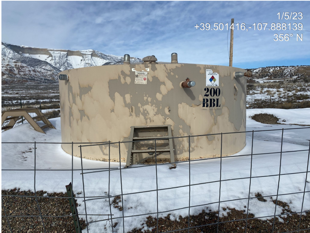
Photo 2. Photo shows the methanol tank at the northwest of the location. Labels are in disrepair.