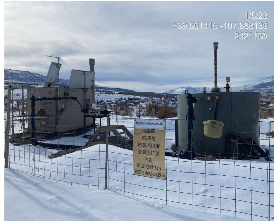
Photo 3. Photos show equipment areas.