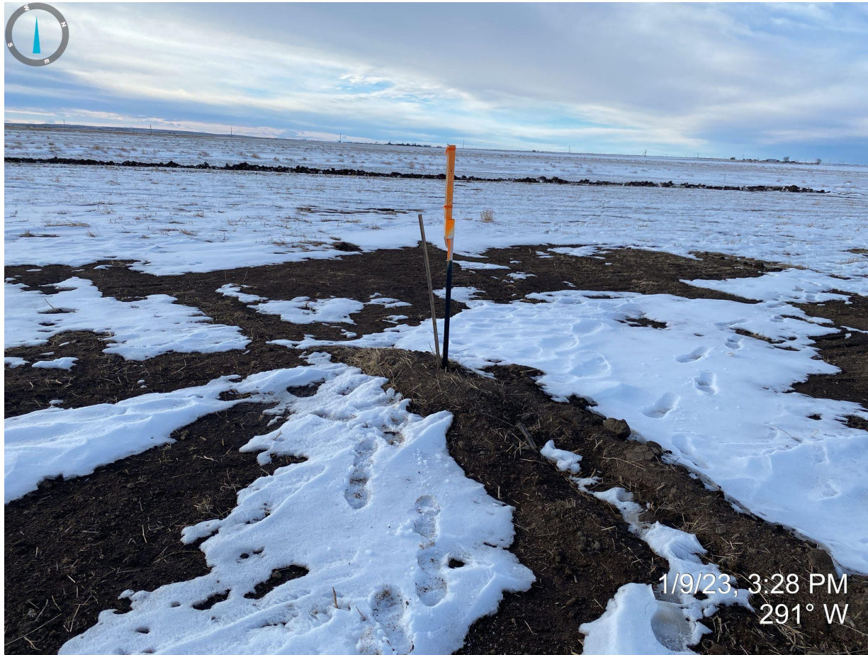
Photo 4. Facing west at the proposed well location.