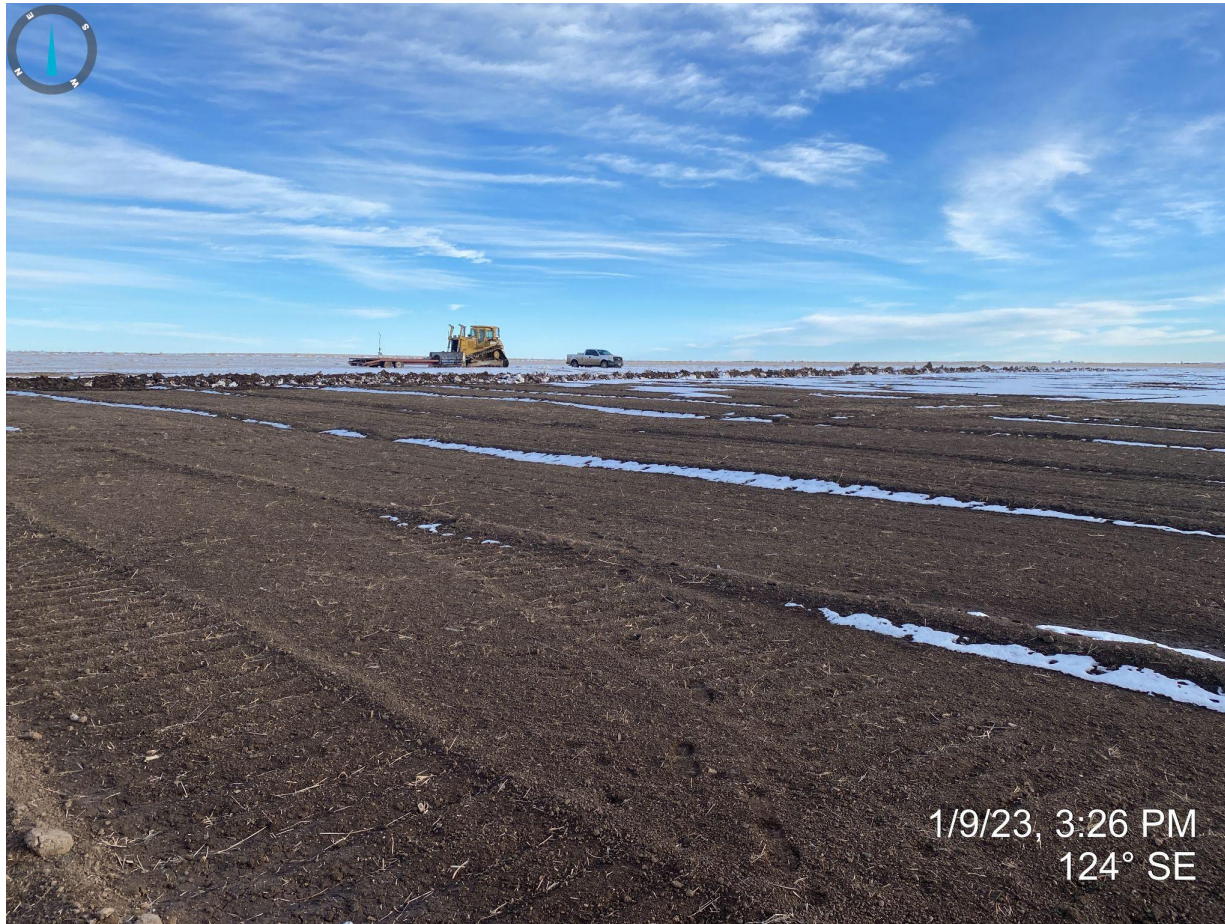
Photo 3. Facing southeast from the center, northern portion of the location. See comments in Photo 2.