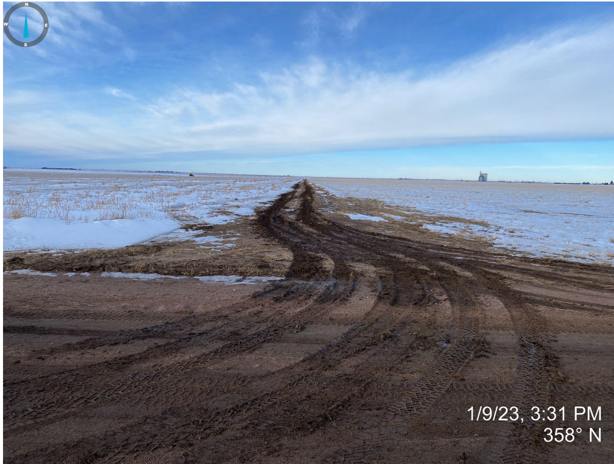
Photo 1. Facing north from CR 38. The access road being used appears to be different from the access road map document (#402267065) attached to the Form 2A. Operator shall update the map figure and attach it to the location file. Additionally, during this inspection, a Form 2A and location sign were not posted and will need to be installed. See Photo 5 for additional information.