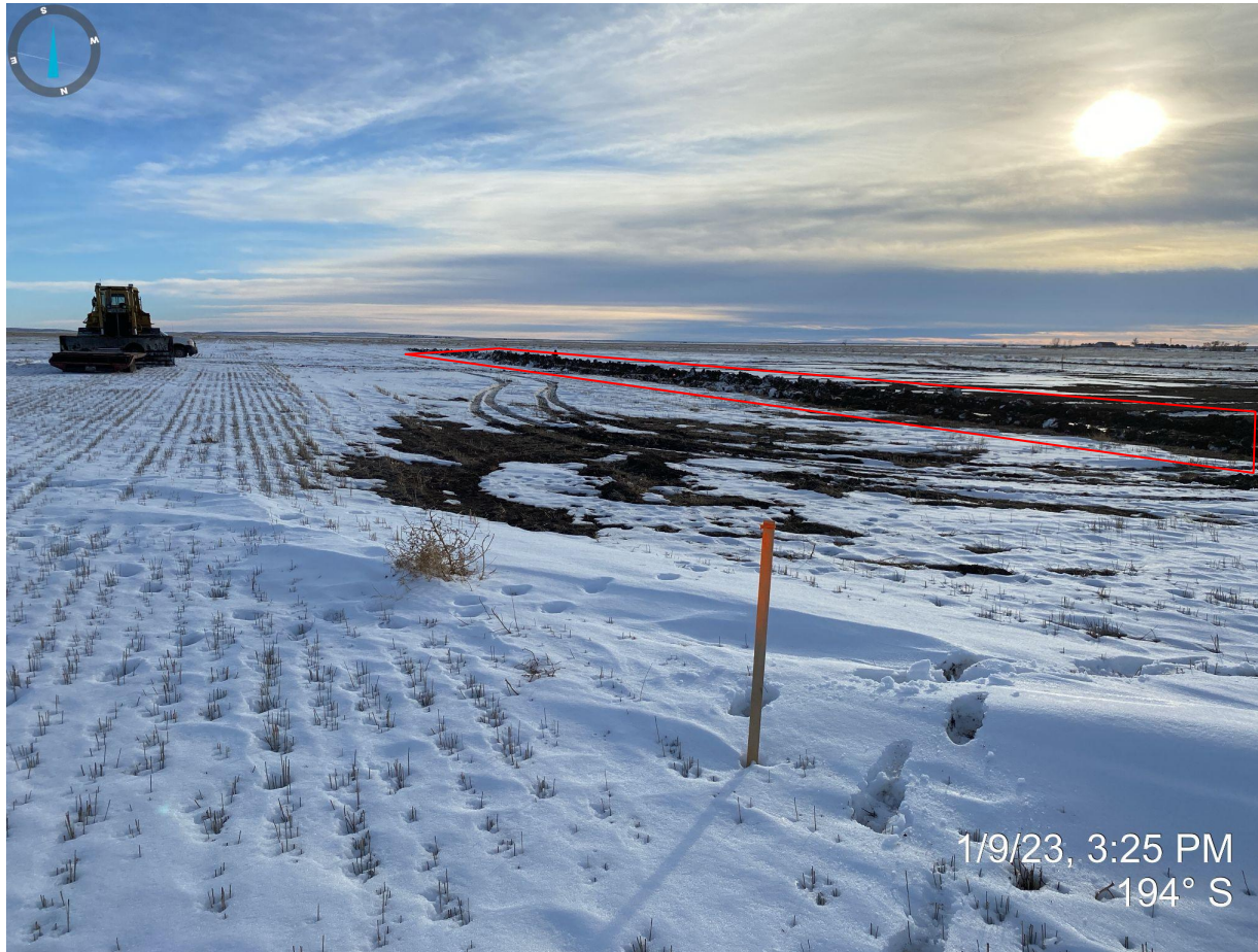
Photo 2. Taken from the northeast corner of the disturbance area, facing south. Photo illustrates heavy machinery has been brought to location and recent soil disturbance was evident, outlined in red. A follow-up inspection will be performed in the future to document topsoil salvage operations.