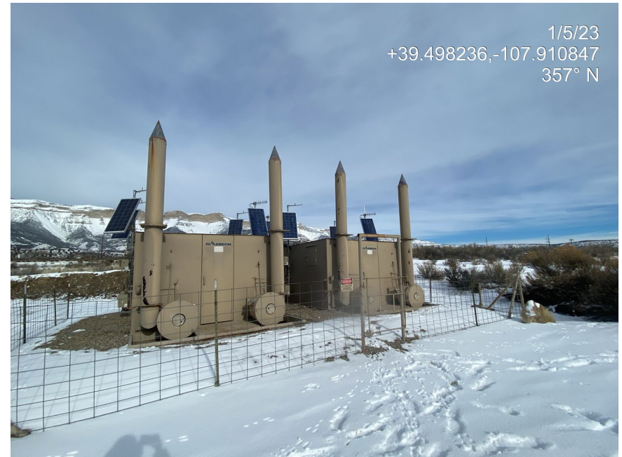
Photo 1. Photos show production areas.