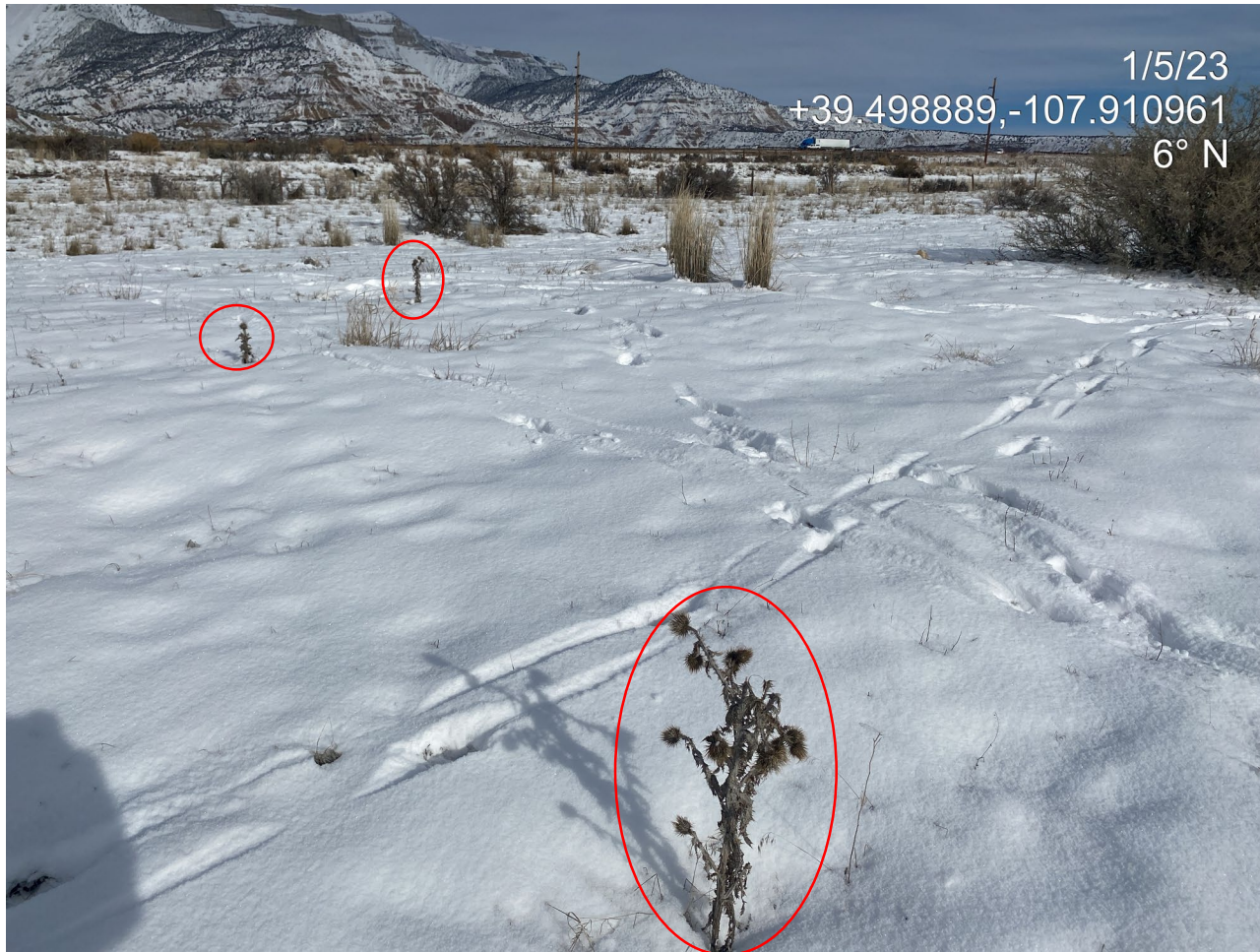
Photo 4. Photo shows Scotch thistle (List B Noxious). Note also, establishment of perennial grasses in midground and apparent lack of perennial grasses in foreground.