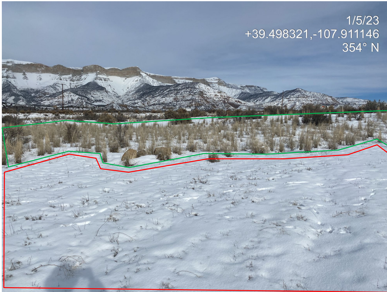
Photo 3. Photo shows an example of the interim areas. Note areas with perennial grass establishment (green) and areas where it appears perennials are absent and annual weeds dominate (red).