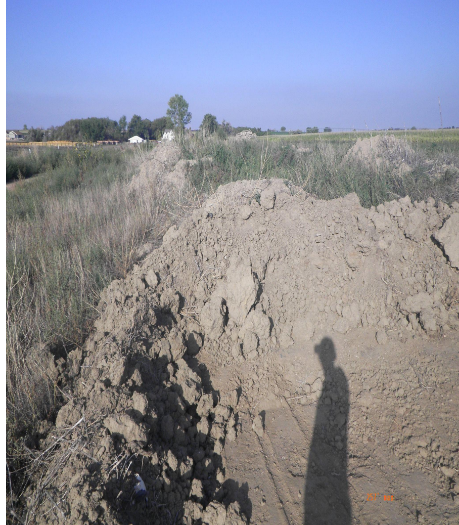
Photo 5. Cardinal photos taken at ground level from the middle of the tank battery. Left photo facing south, right photo facing west. Note: tank battery has a large pile of dirt in the middle of the disturbance and portions of the northern access road remain unreclaimed with gravel.