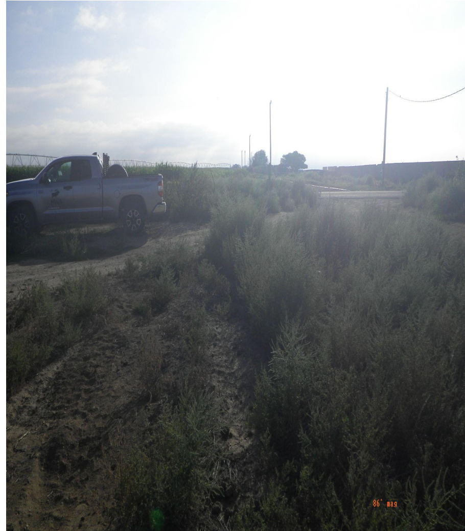
Photo 4. Cardinal photos taken from the middle of the tank battery. Left photo facing north, right photo facing east.