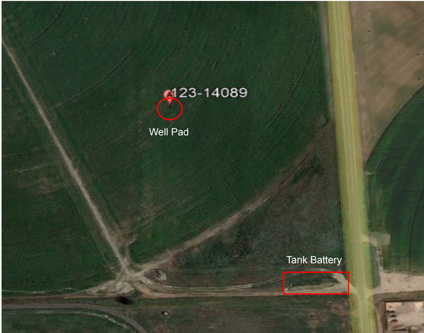
Photo 1. 2020 aerial imagery of the well pad and tank battery. Note: could not identify access road from historical imagery.