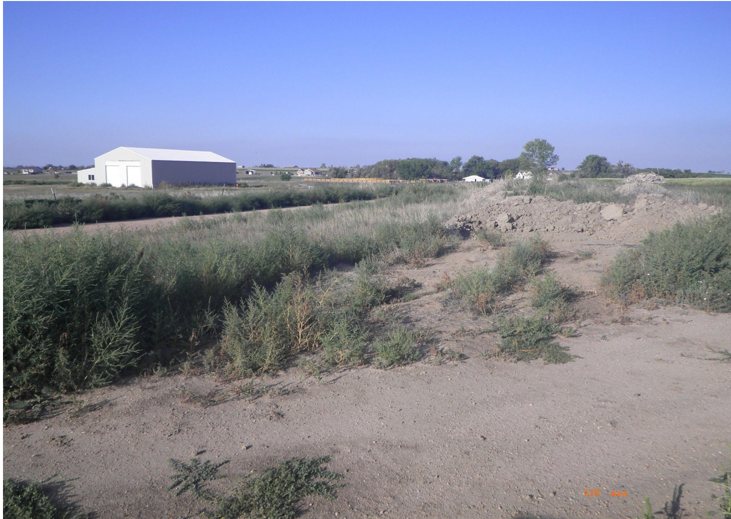
Photo 3. Overview photo of the tank battery taken at ground level from the eastern edge facing west. Note: tank battery falls within a corner crop area.