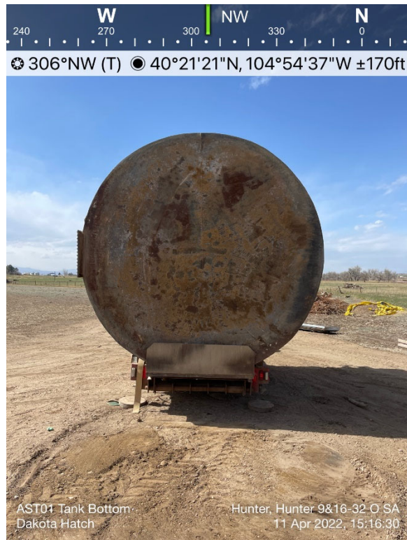
Above Ground Storage Tank (AST) 01 Bottom