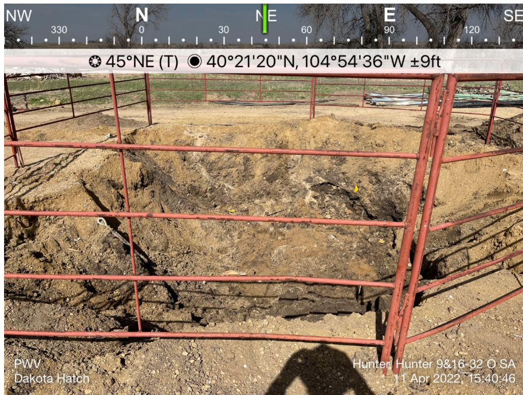
Produced Water Vessel (PWV)