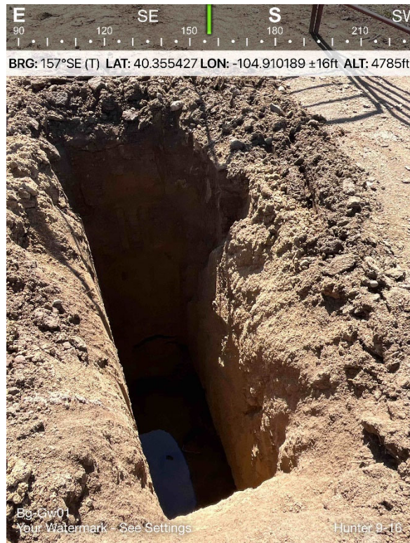
Background (BG) – Groundwater (GW) 01