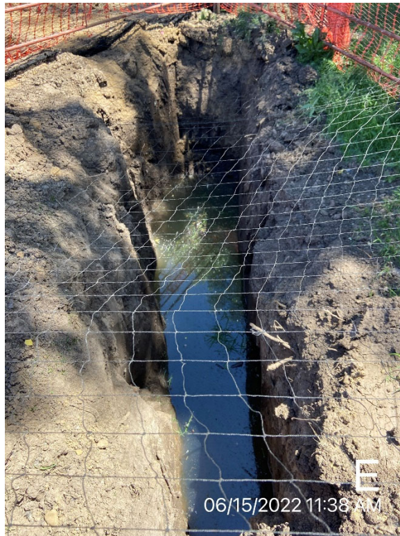
Pothole (PH) 01 Excavation