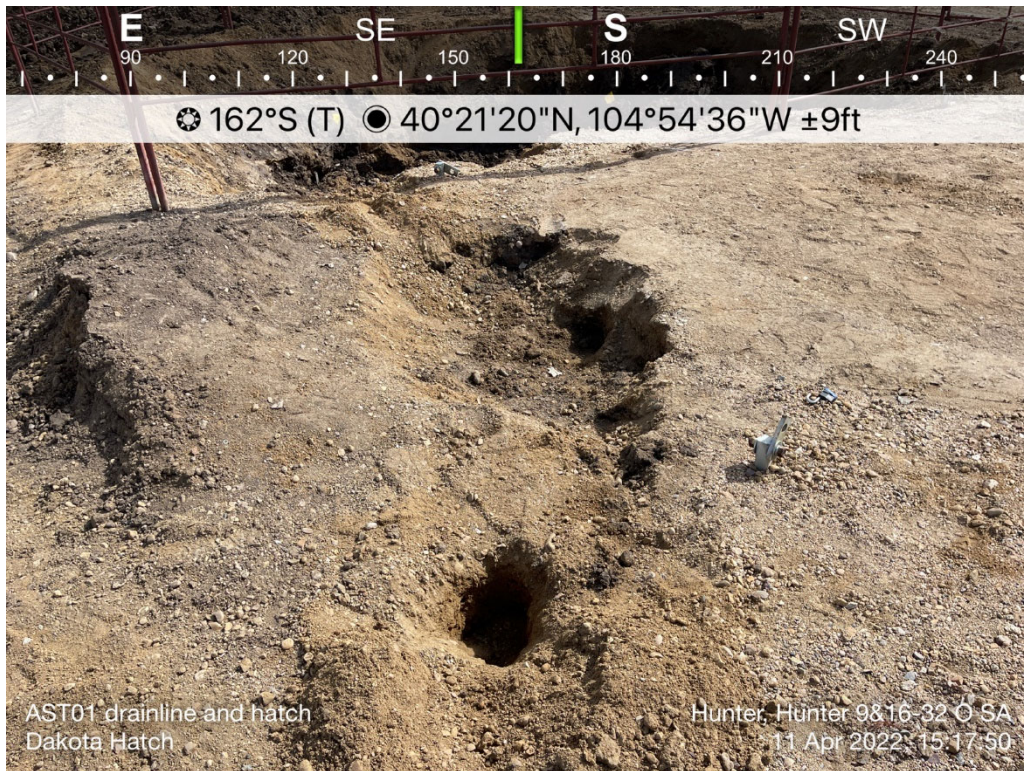
AST01 Drainline and Hatch